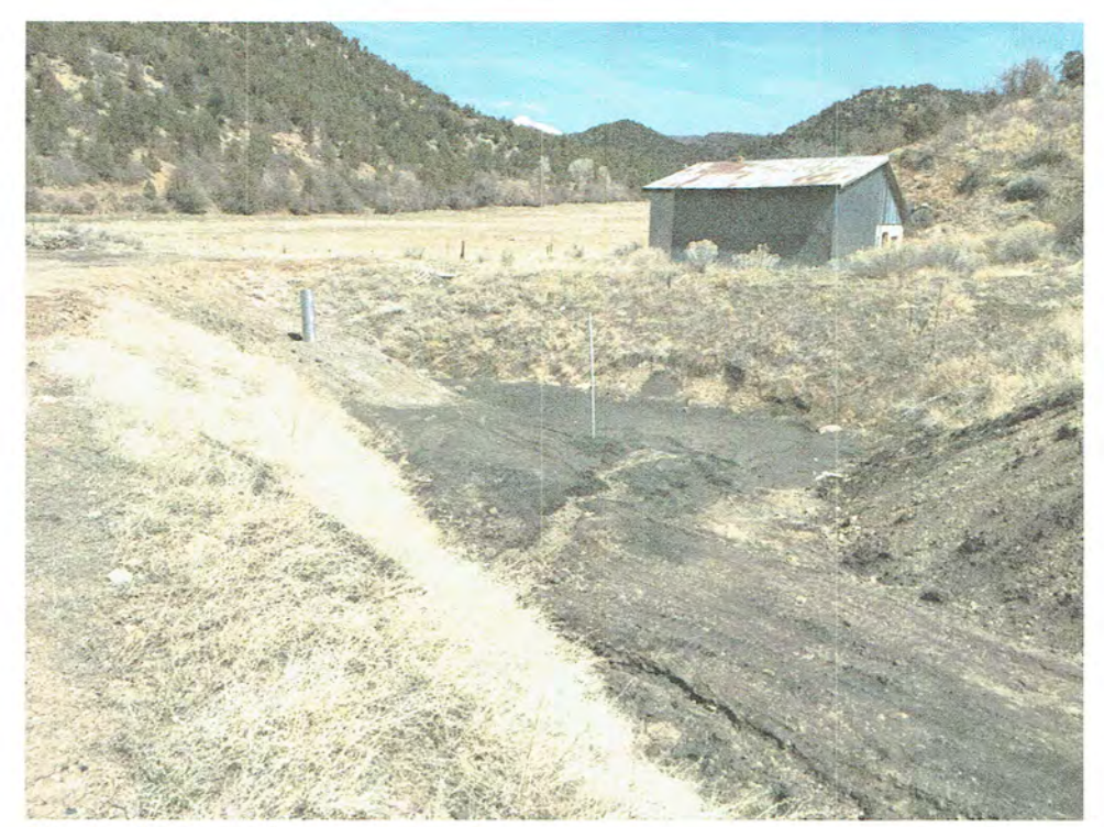
Pic. 1 – East pond.