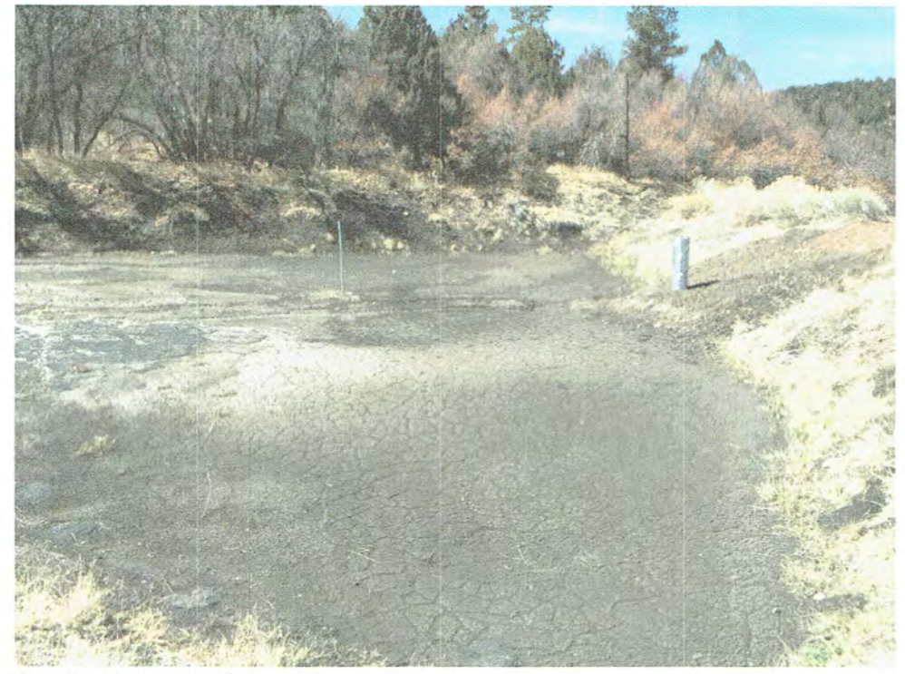
Pic. 2 – West pond.