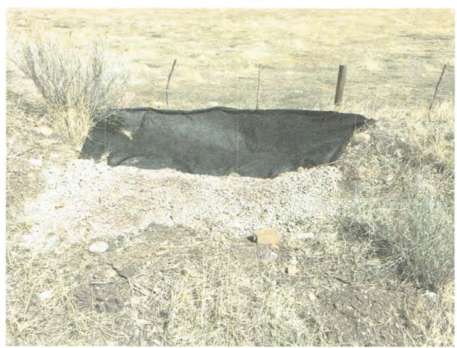
Pic. 4 – Sediment trap along east side of driveway has been repaired.