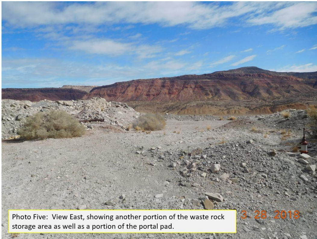
Photo Five: View East, showing another portion of the waste rock storage area as well as a portion of the portal pad.

George Glasier Pinon Ridge Mining LLC P O Box 825 Nucla, CO 81424