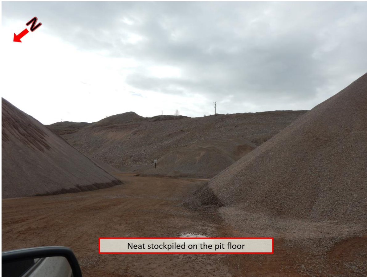
Neat stockpiled on the pit floor