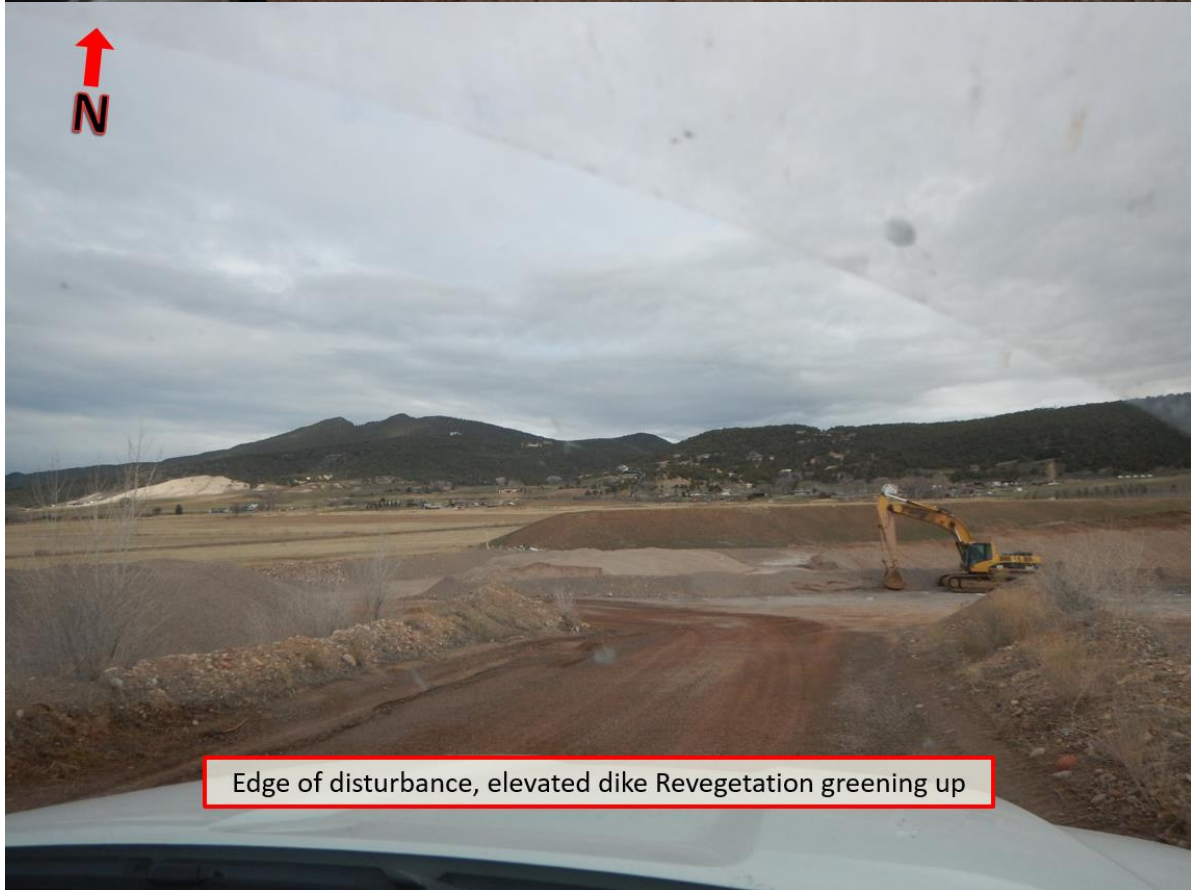
Edge of disturbance, elevated dike Revegetation greening up