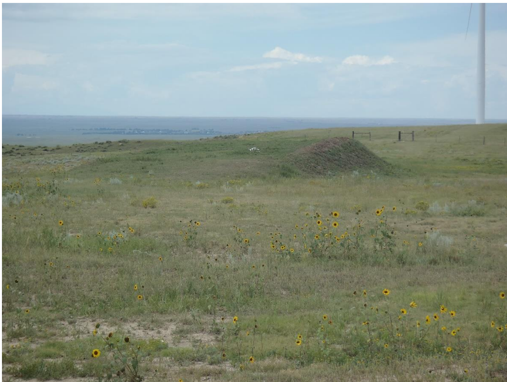
Photo 7. Probable topsoil stockpile (north side of west end, looking west).