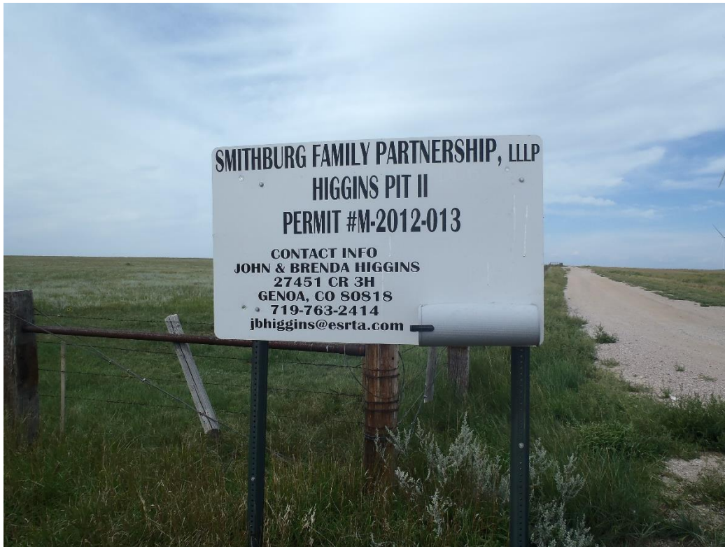
Photo 6. Permit sign at entrance.