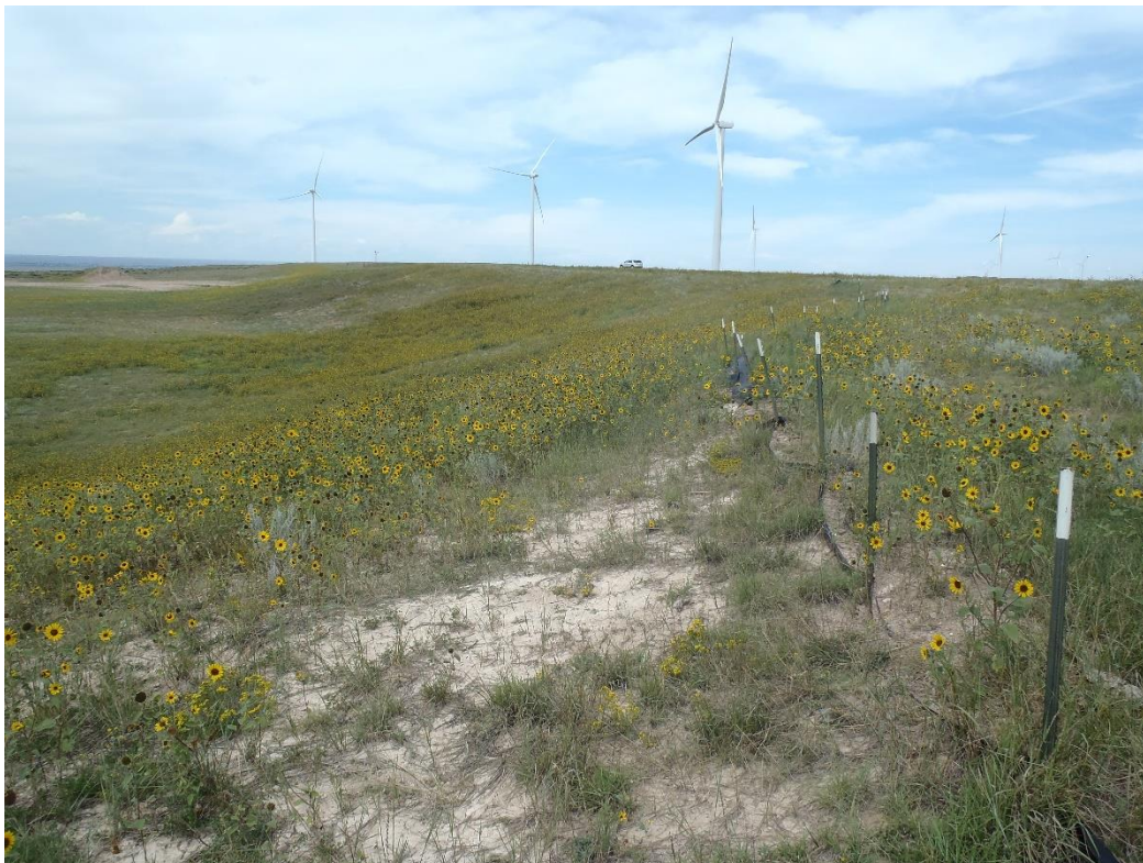
Photo 5. Failing silt fence on crest of eastern end of highwall (looking WNW).