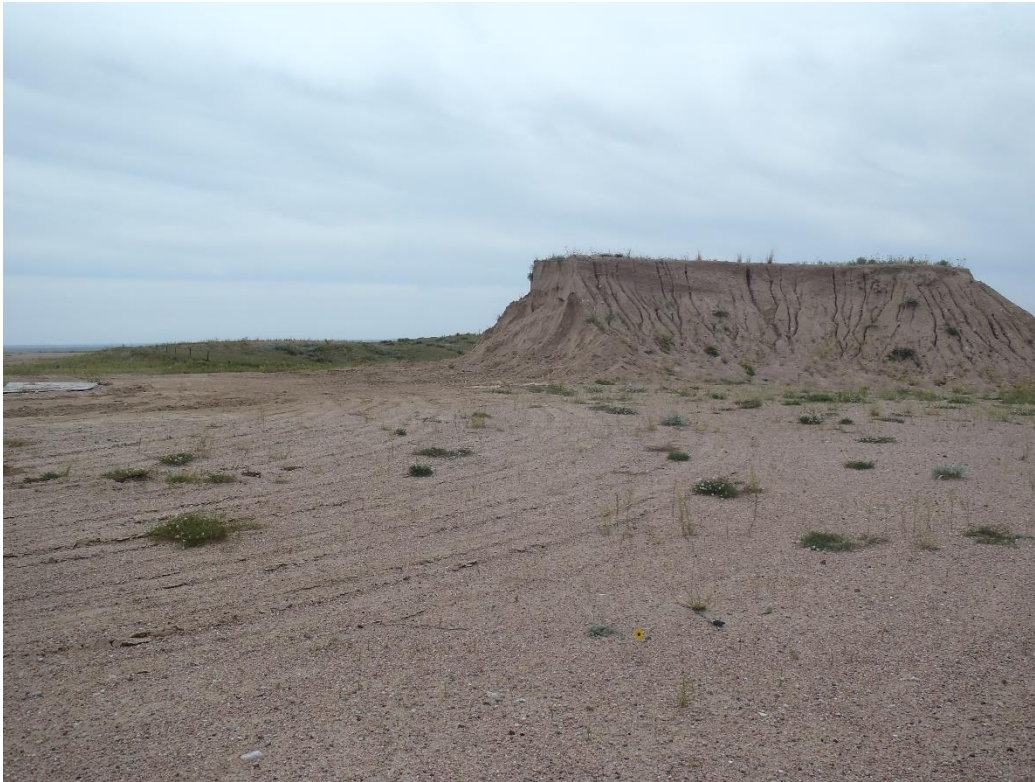
Photo 2. Active area (west end, looking SW; note product stockpile).