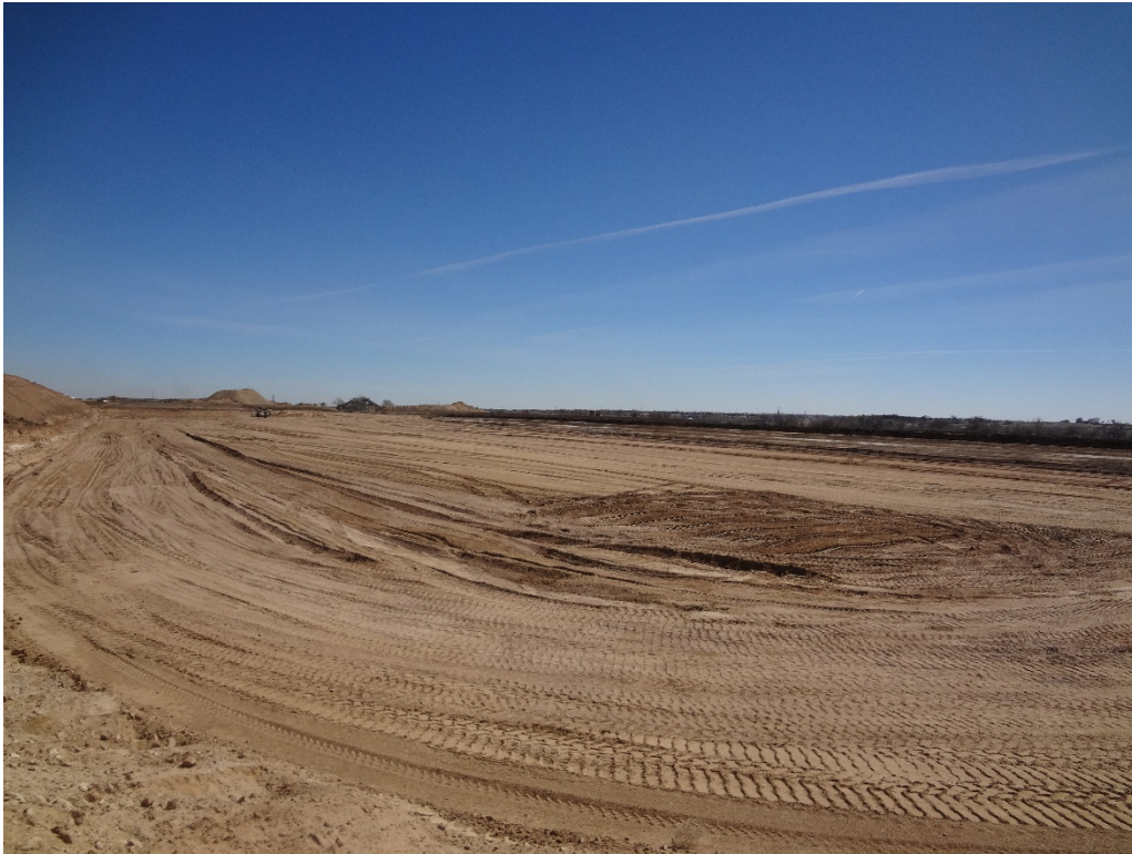
View of Stage 2 from the northwest corner of the stage looking southwest