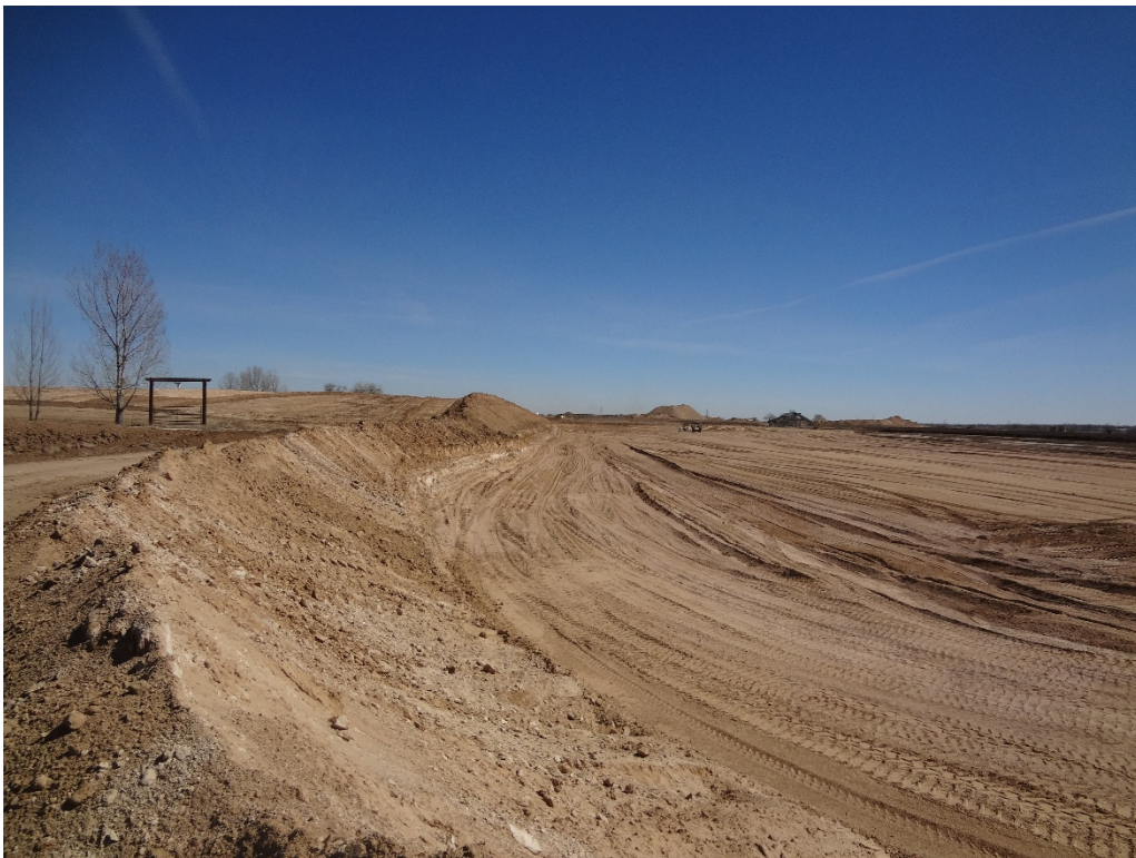
View of Stage 2 from the northwest corner of the stage looking east