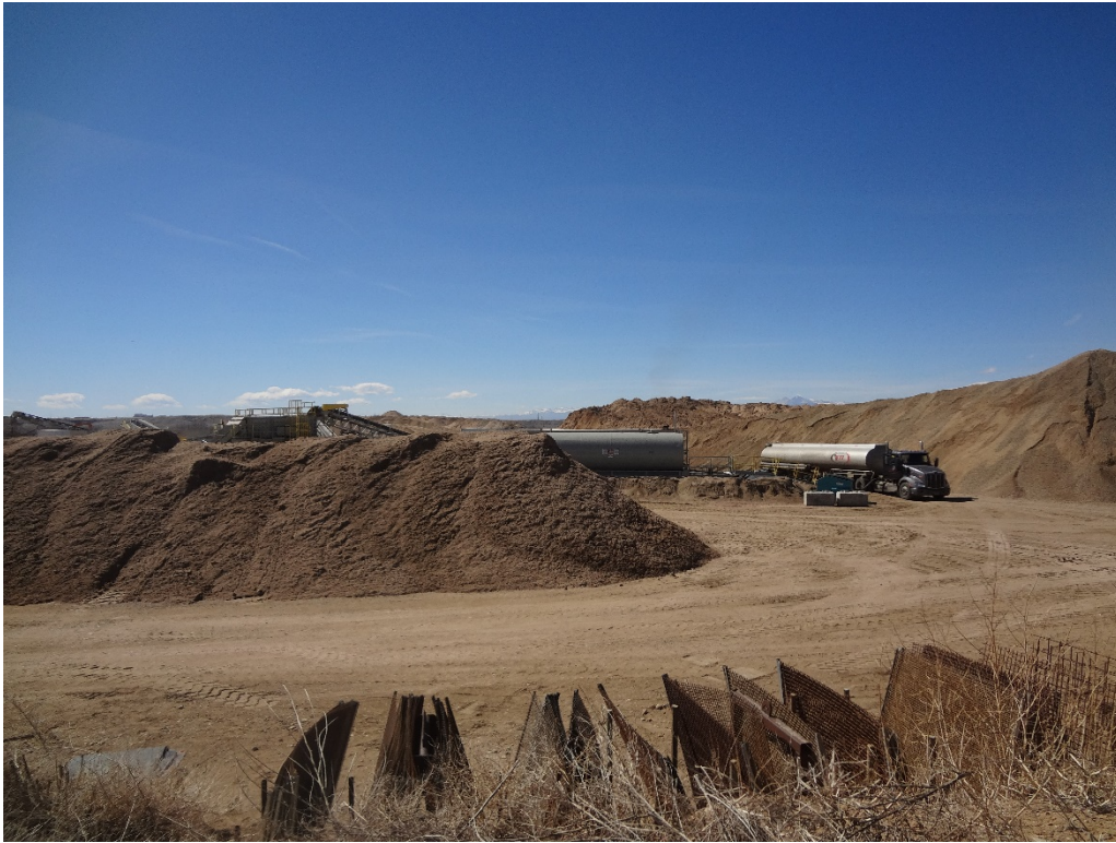
View of the mining activity looking west from the mine office area