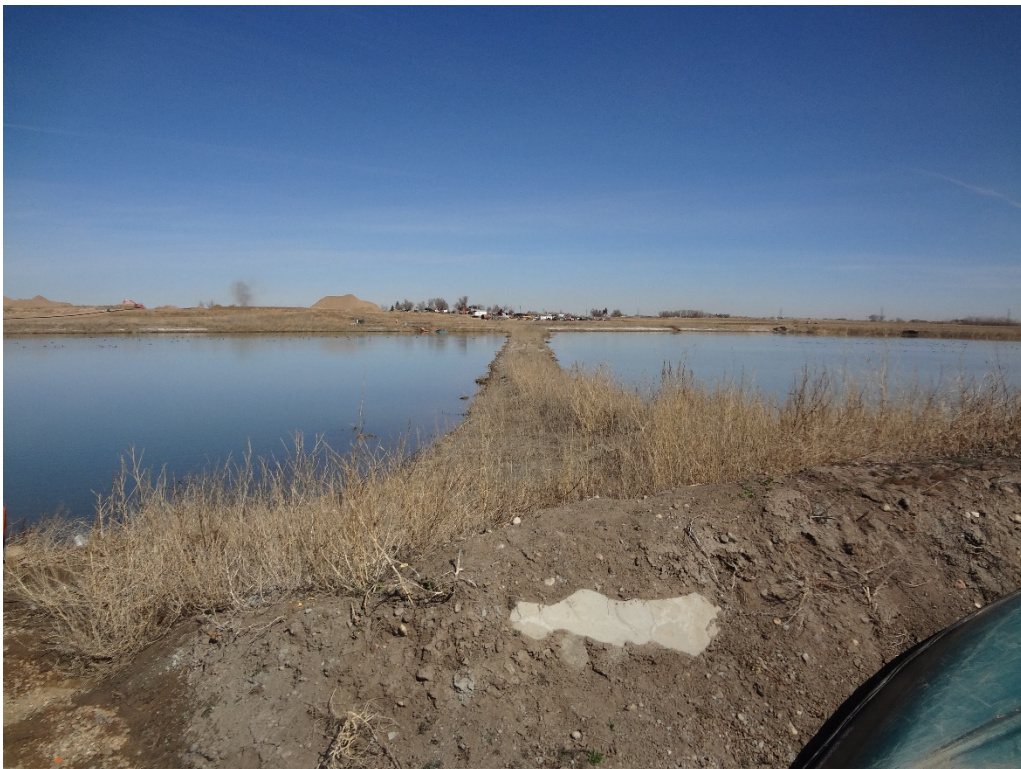
View of the dividing berm between the sedimentation pond and fresh water pond looking north