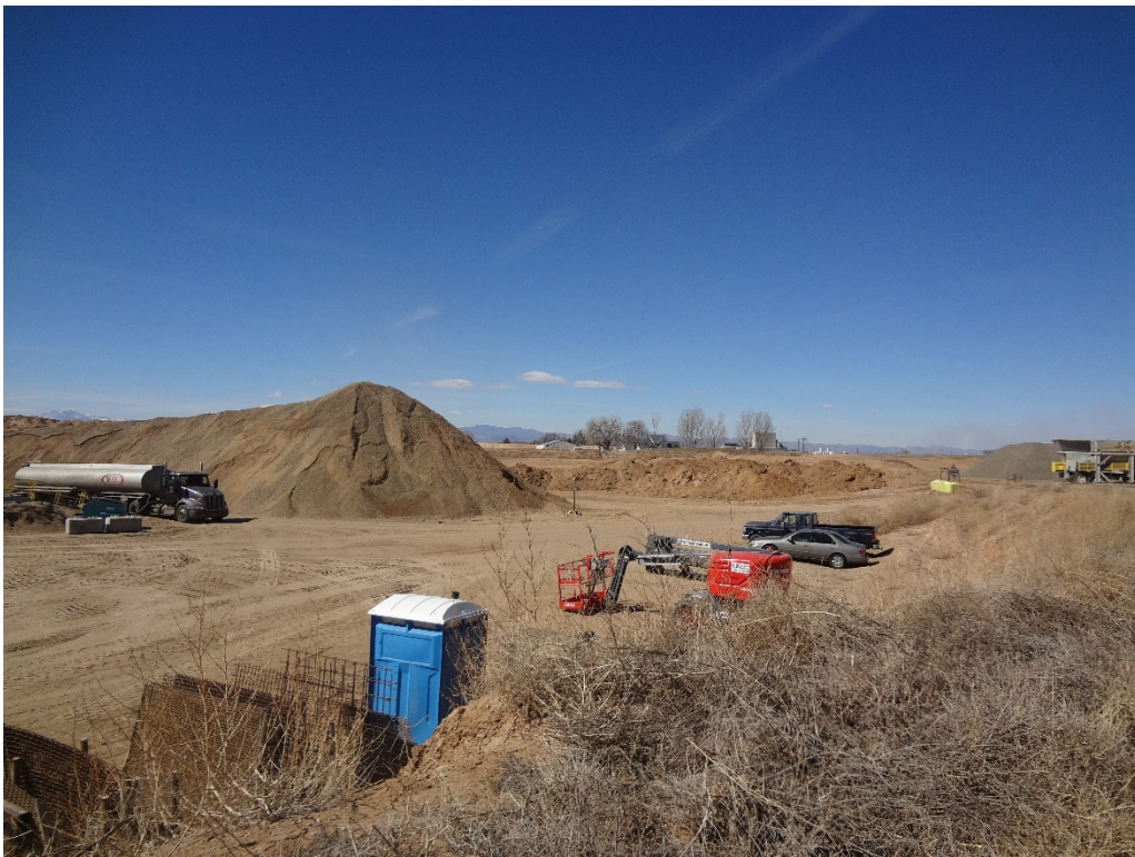
View of the mining activity looking northwest from the mine office area