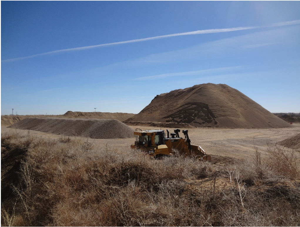
View of the mining activity looking south from the mine office area