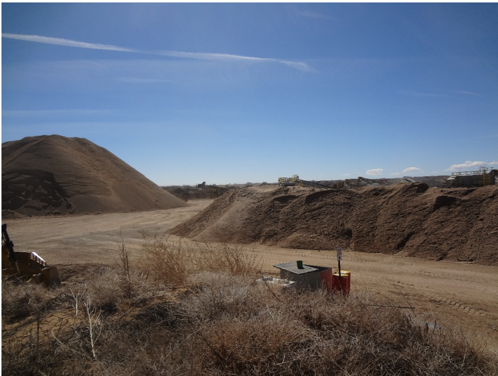
View of the mining activity looking southwest from the mine office area