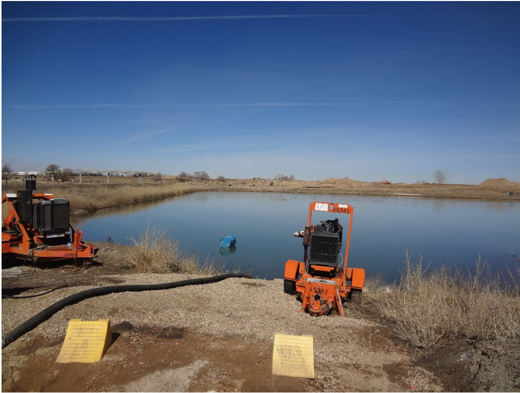
View of dewatering pump and water truck pump located in the southwest corner of the fresh water pond