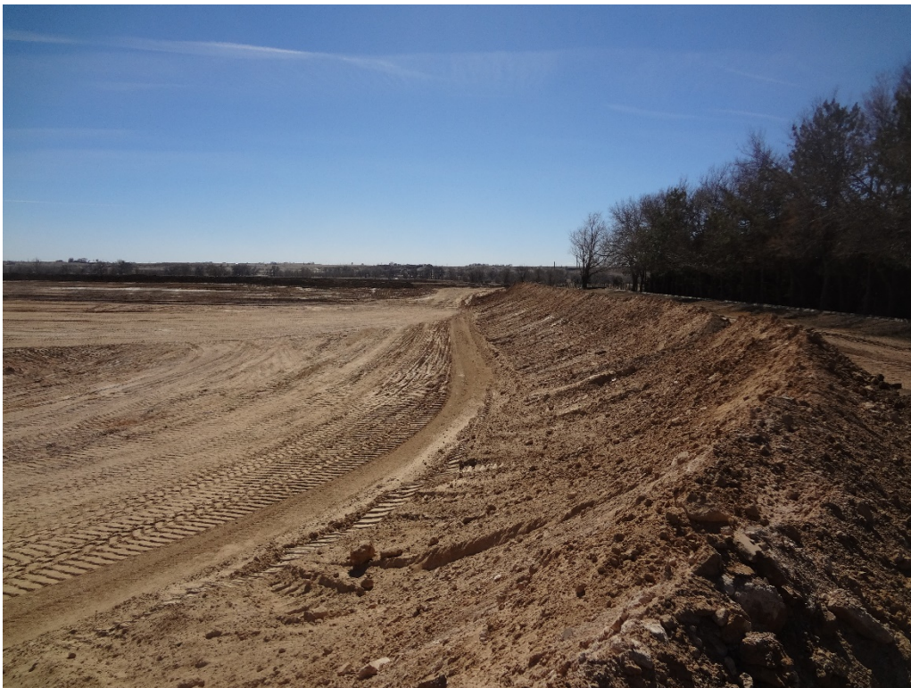
View of Stage 2 from the northwest corner of the stage looking south