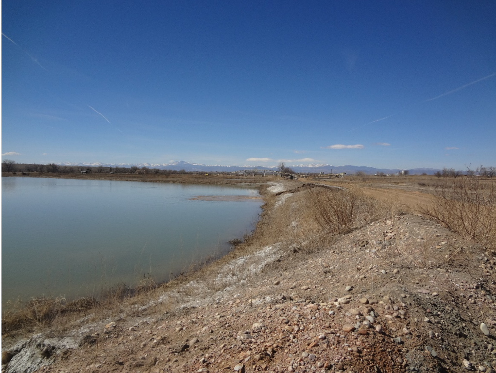
View of the sedimentation pond from northeast corner of the pond looking west