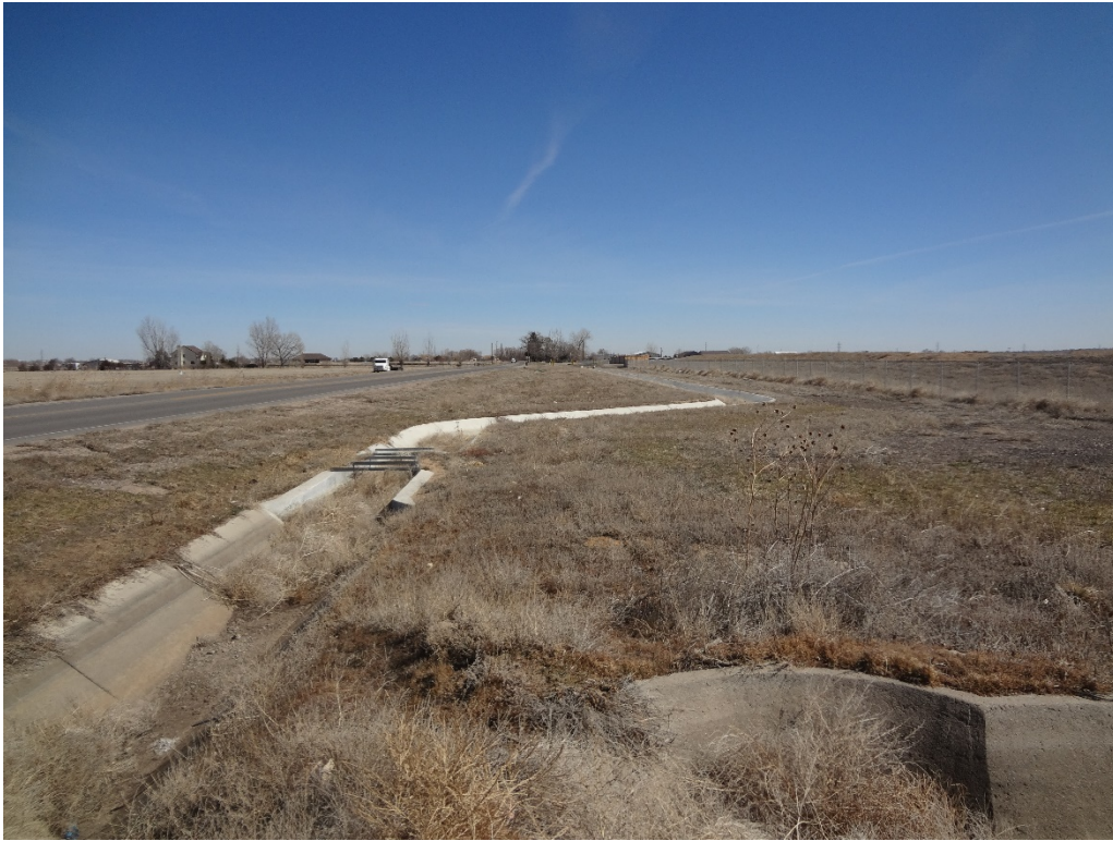
View of relocated Whitney Ditch from CR 64.5 looking east