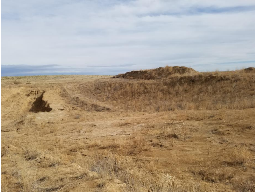
Figure 5. From the south central end of the affected area looking north at the 2015 excavation area.