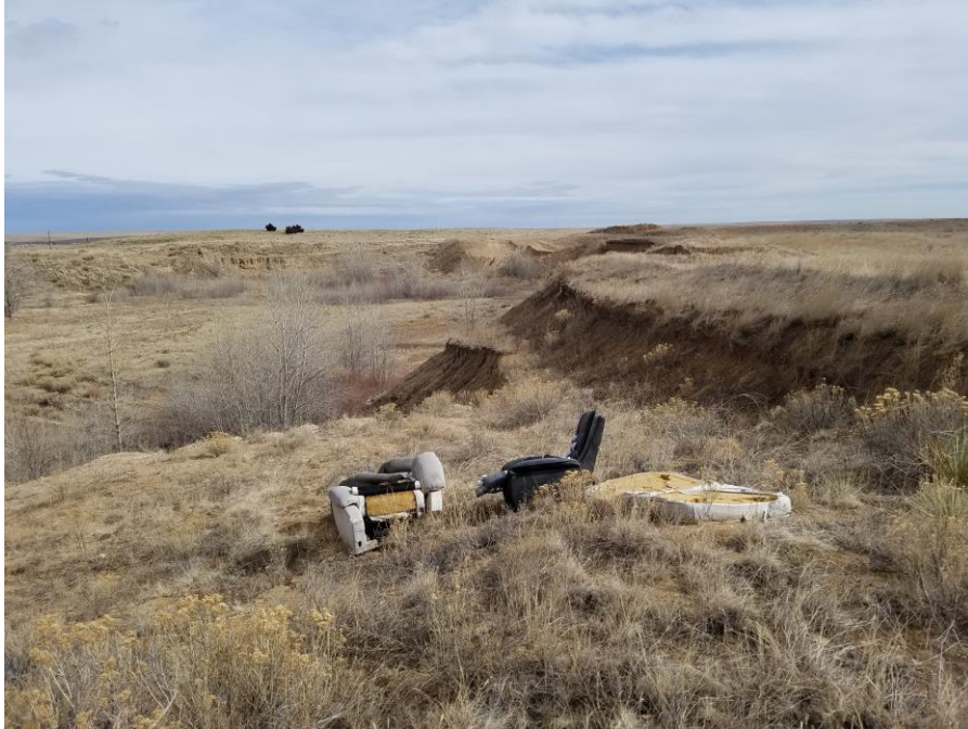
Figure 7. Southern highwall from the west end looking east.