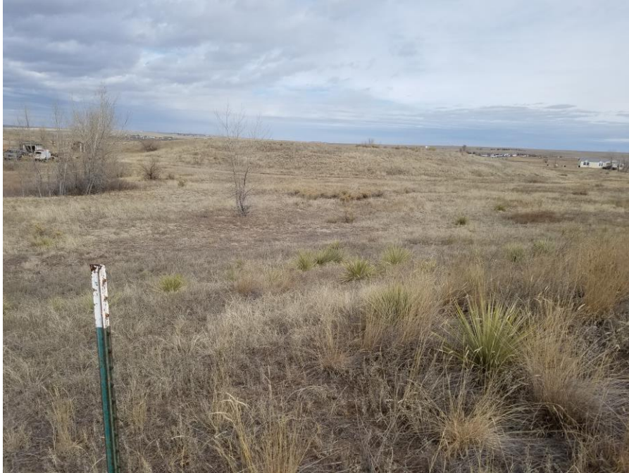
Figure 3. From the northeast corner of the former 111c area looking north.