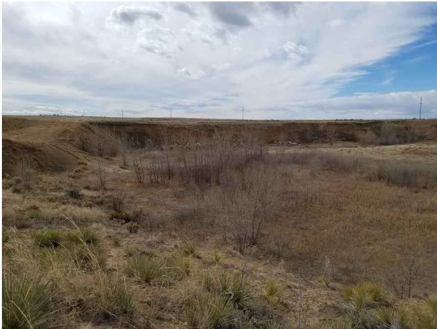
Figure 4. From the northeast end of the affected area looking southwest.