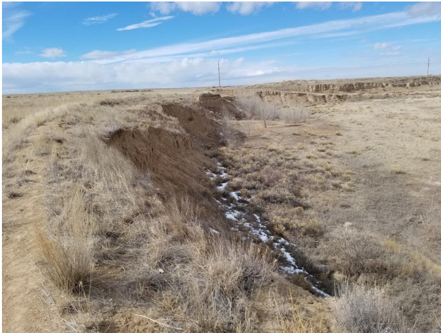
Figure 6. Southern highwall from the east end looking west.