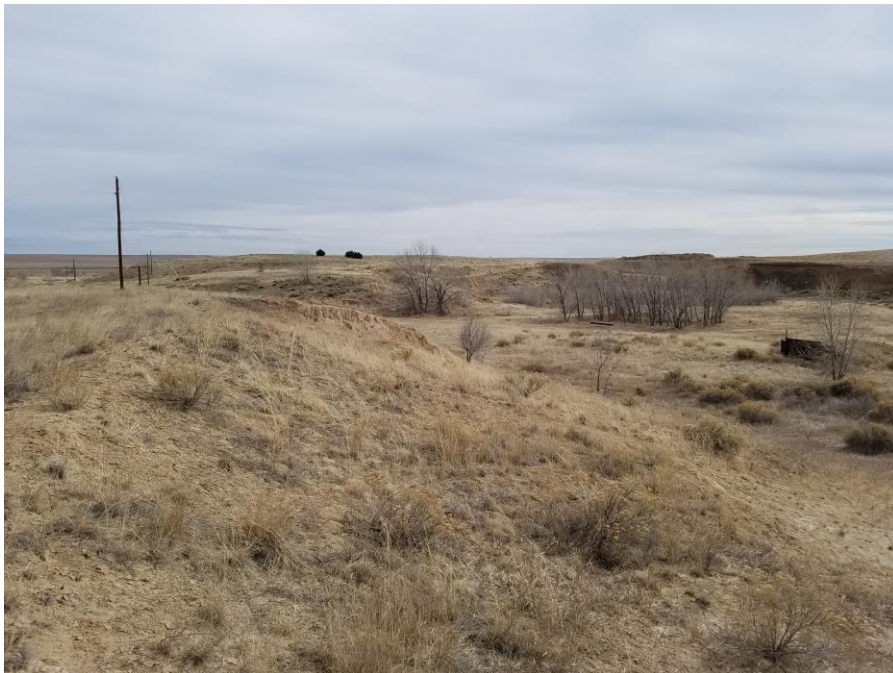
Figure 2. From the north end of the western highwall looking east.