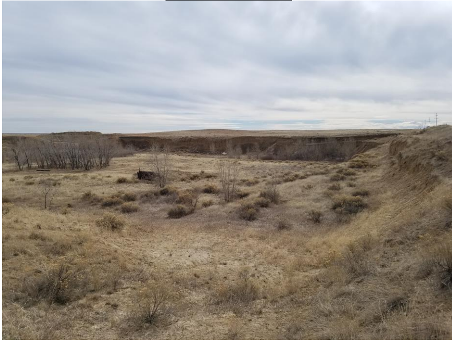
Figure 1. From the north end of the western highwall looking southeast.