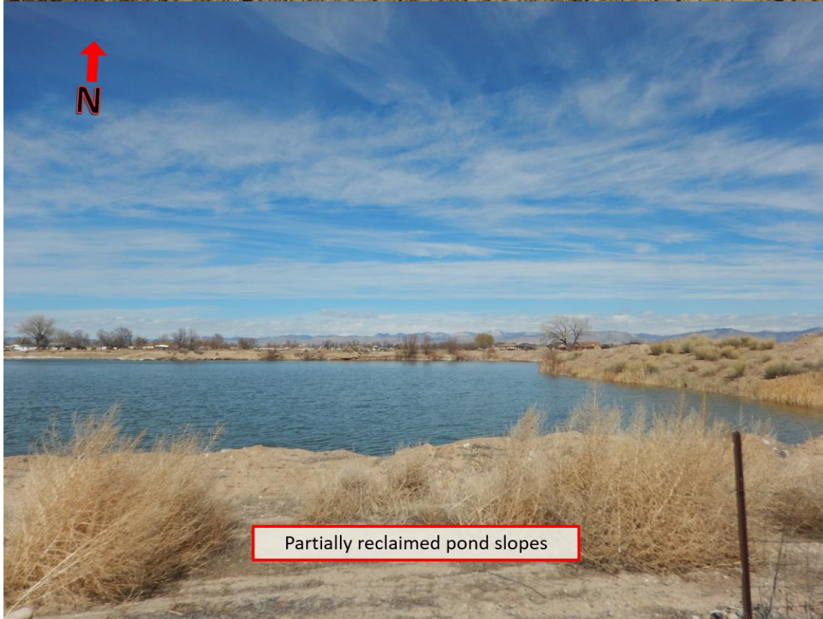
Partially reclaimed pond slopes