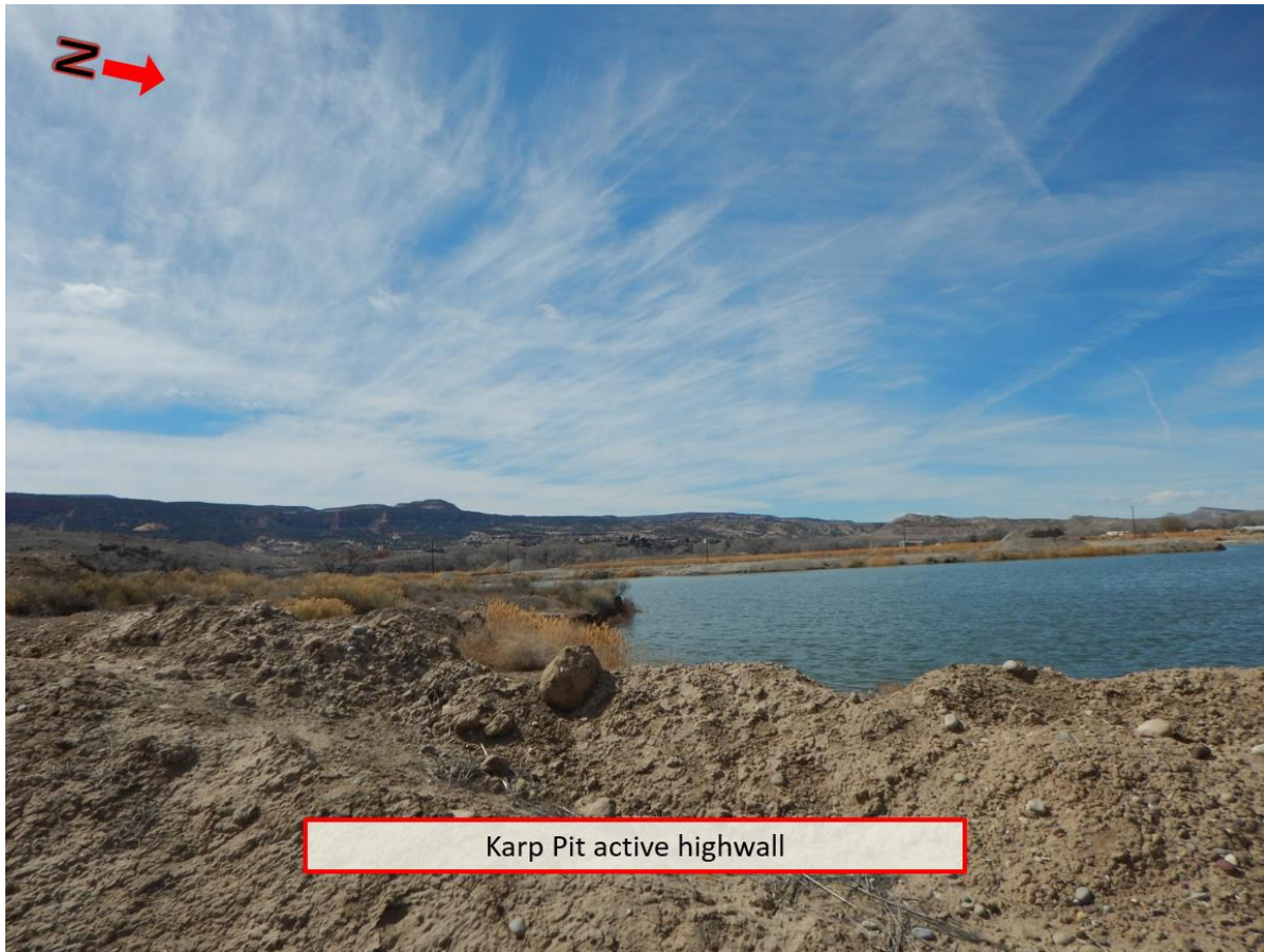
Karp Pit active highwall