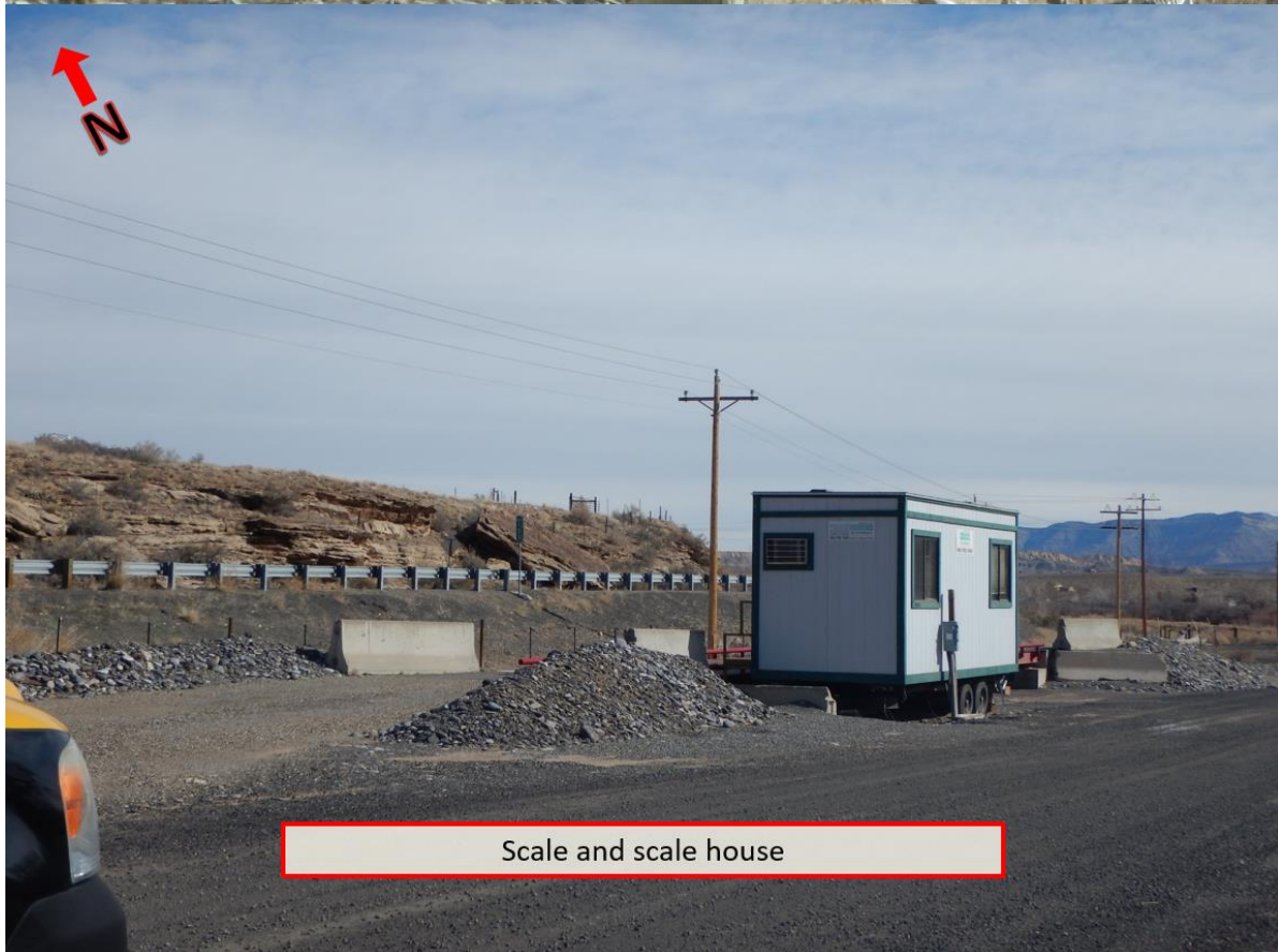
Scale and scale house