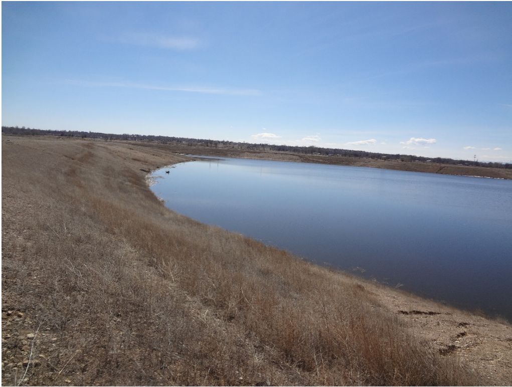
View of the West Pit from the east shoreline looking south