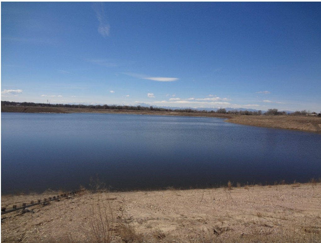
View of the West Pit from the east shoreline looking west