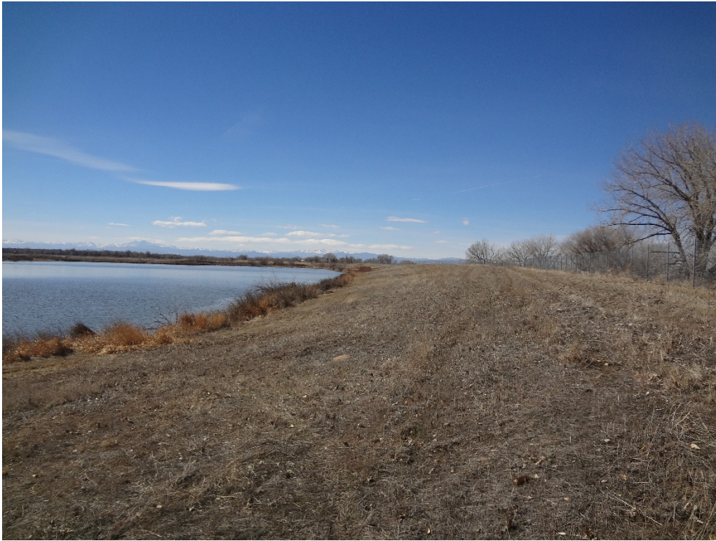
View of the north lake from the northeast corner looking west