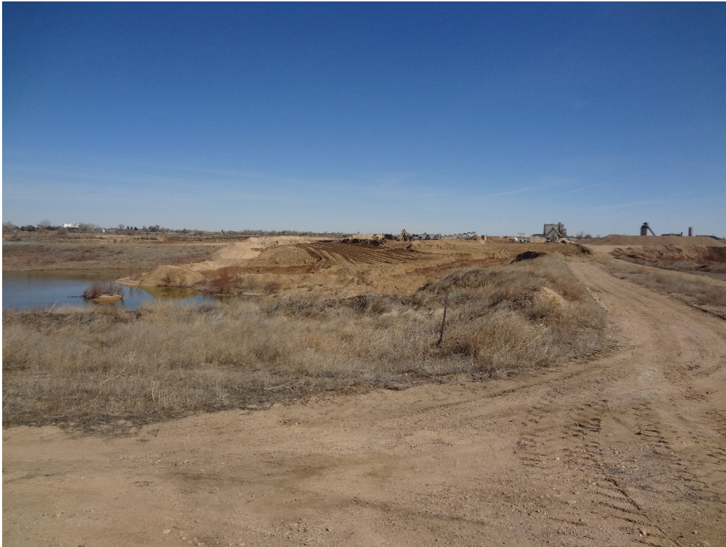
View of the active mining activity during the inspection looking northeast