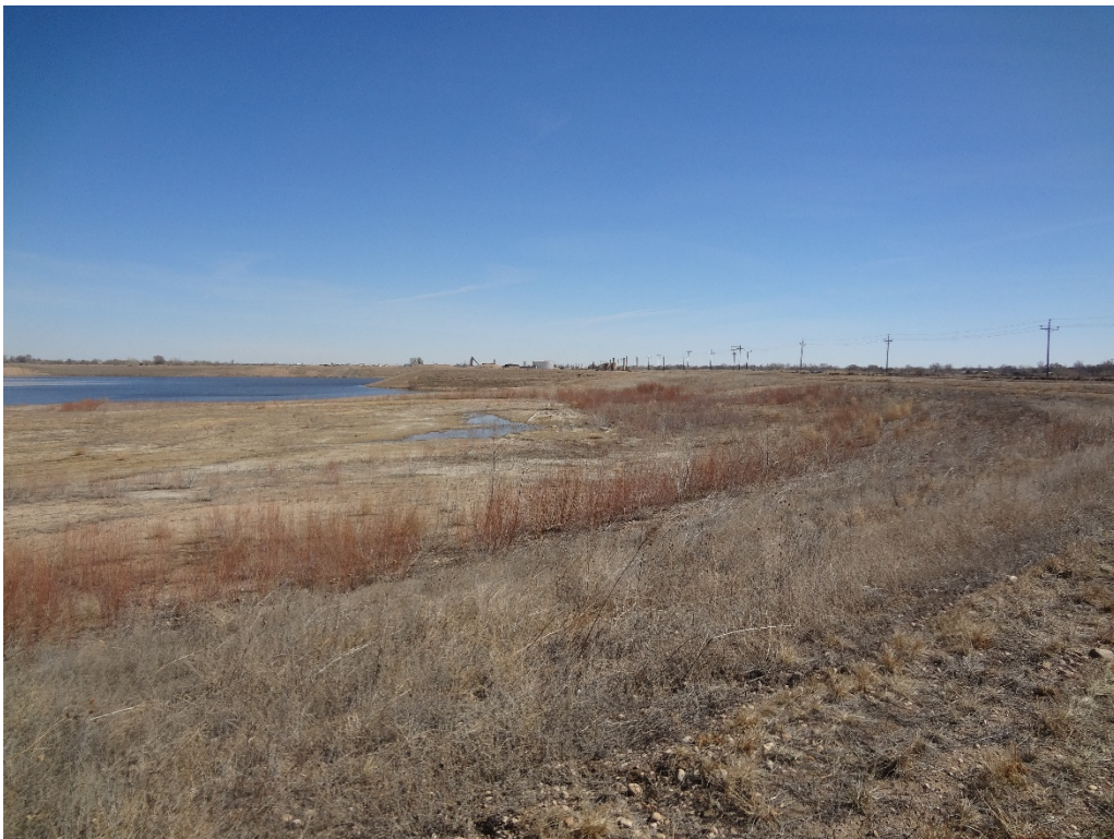
View of the West Pit from the southwest corner looking east