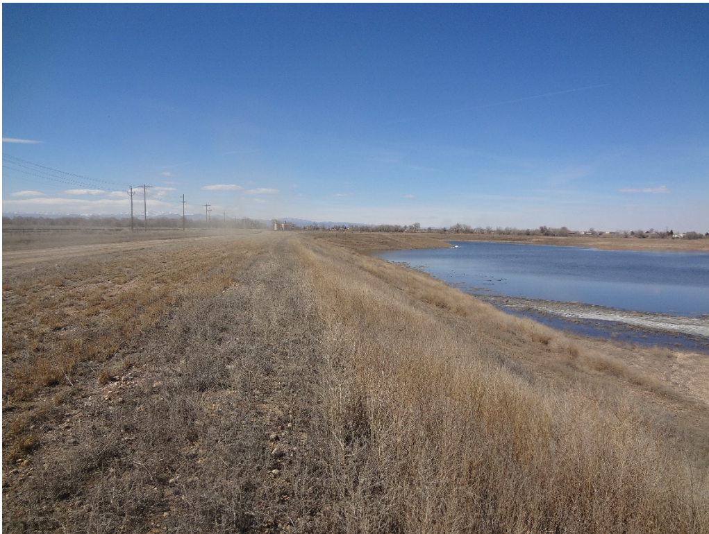
View of the West Pit from the southeast corner looking west