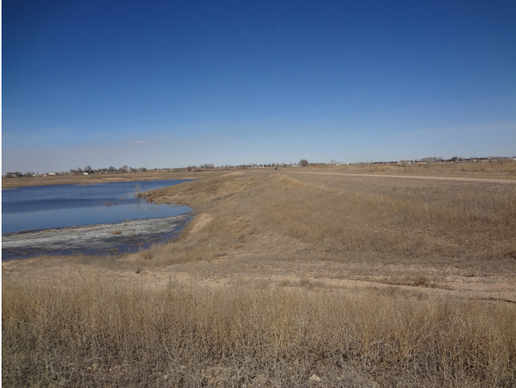
View of the West Pit from the southeast corner looking north