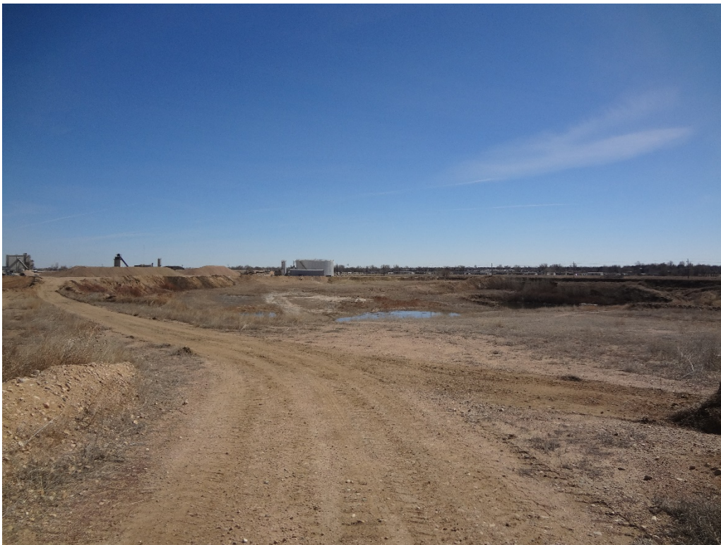
View of the sedimentation pond from the northwest corner of the pond looking southeast