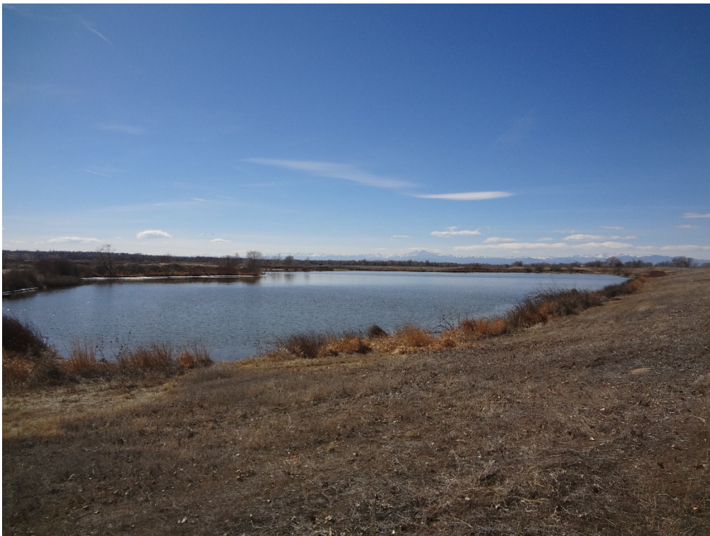
View of the north lake from the northeast corner looking southwest