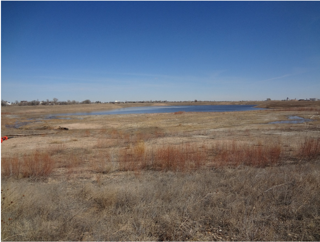
View of the West Pit from the southwest corner looking northeast (pipes from Poudre River in left side of photo)