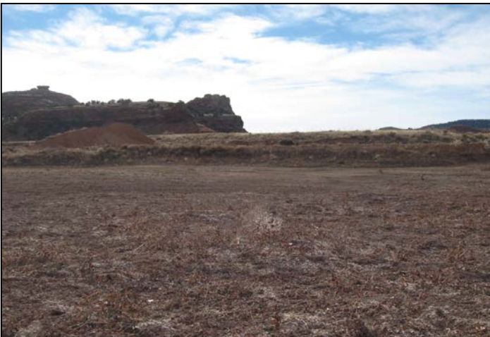
3. Overview of pit floor, photo taken facing west.