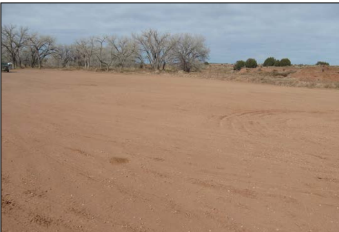
5. Load-out and stockpile area.