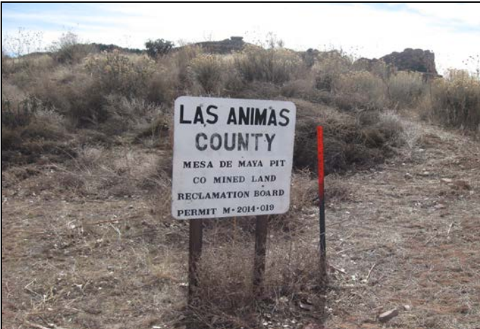
1. Permit sign at site entrance.