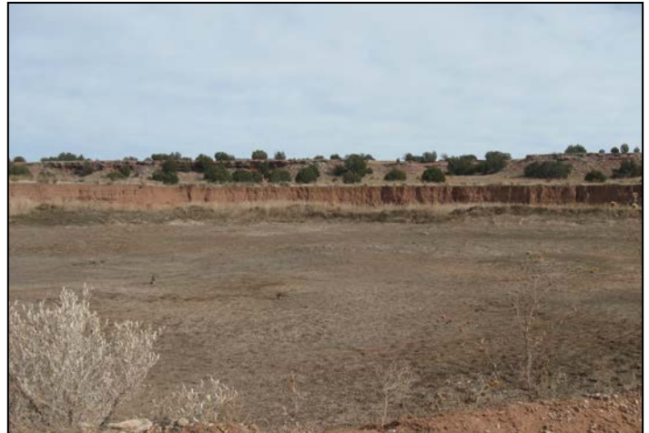
2. Overview of pit floor, photo taken facing east.