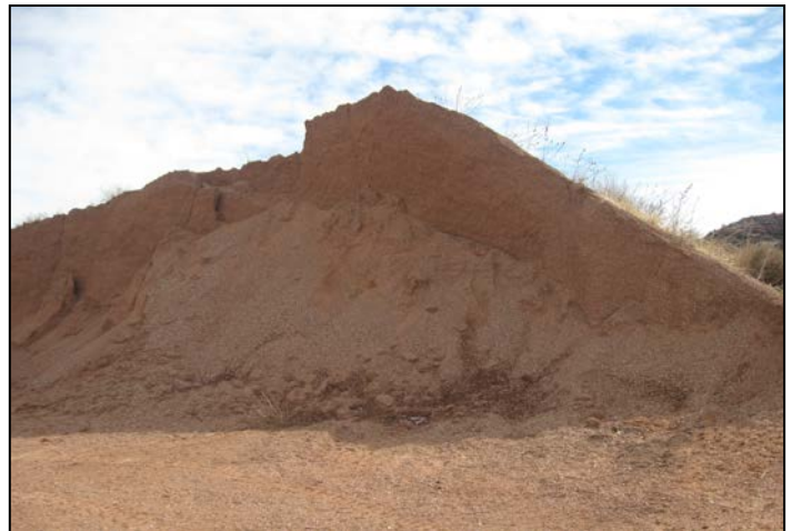
4. Product stockpile.