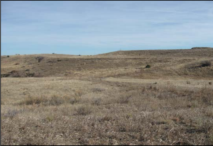
1. Overview of reclaimed lower area.