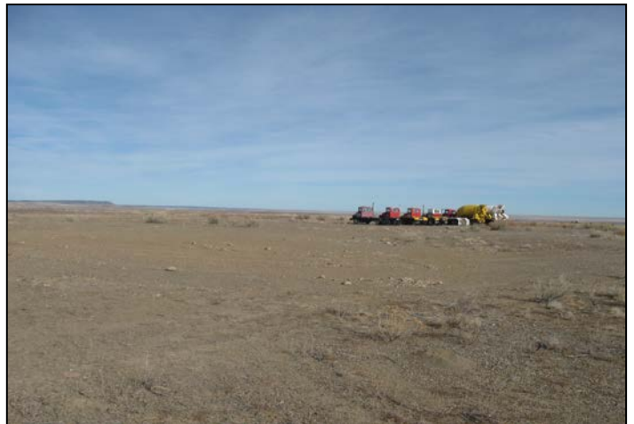
4. Equipment storage on upper area.