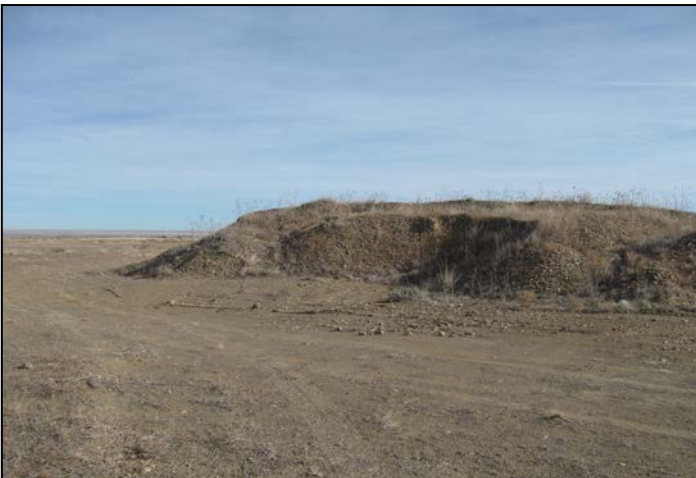
3. Product stockpile on upper area.