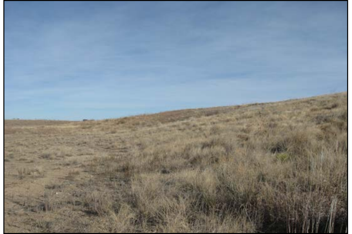
2. Reclaimed slope between upper and lower areas.