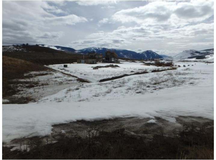
Batch plant area