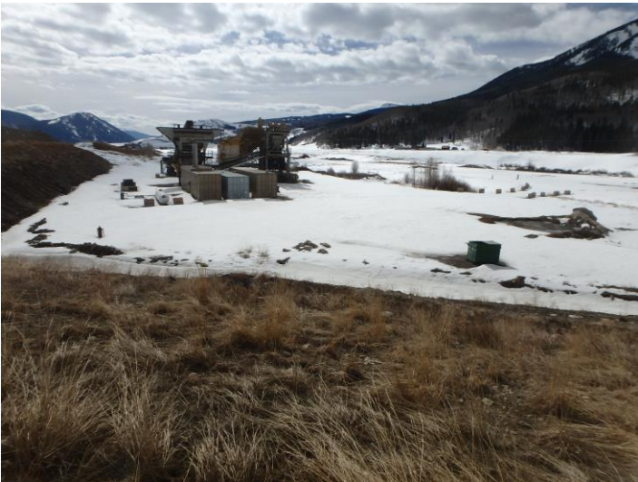
Batch plant area