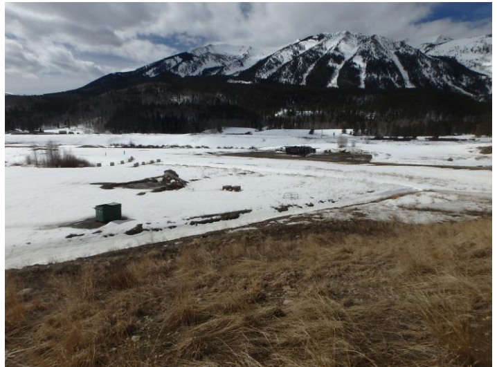
Batch plant area