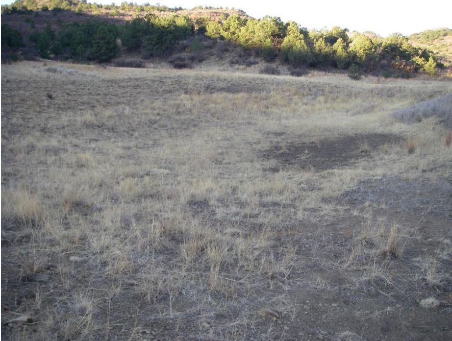
BA-3 borrow area