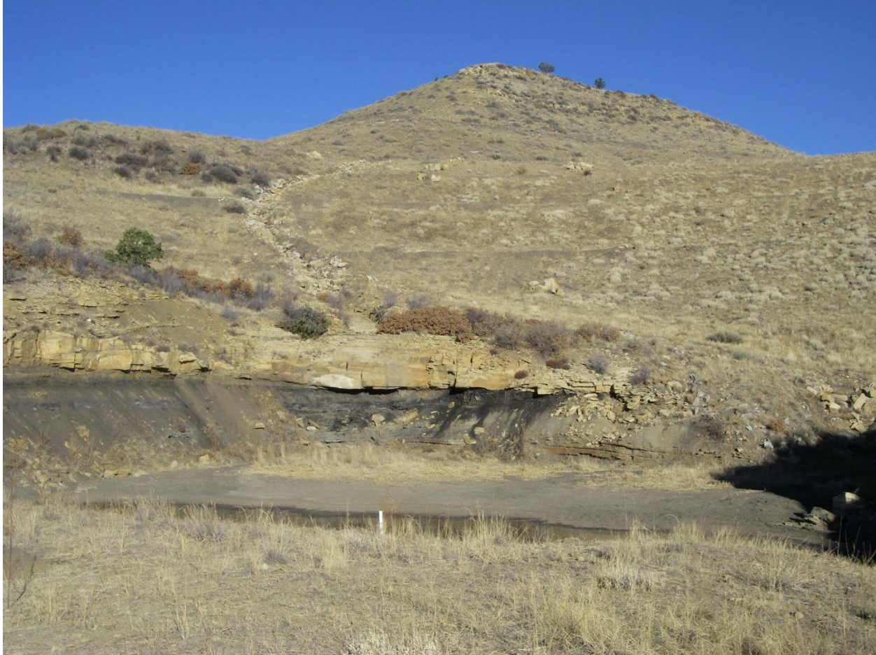
Fill 9 and Pond 9A

Number of Partial Inspection this Fiscal Year: 8