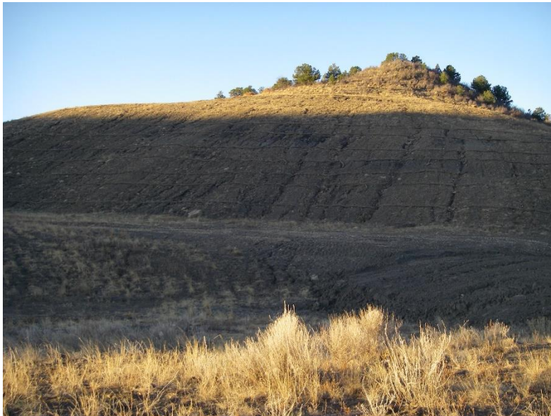
Hillside above pond cleaning dump area

Number of Partial Inspection this Fiscal Year: 8