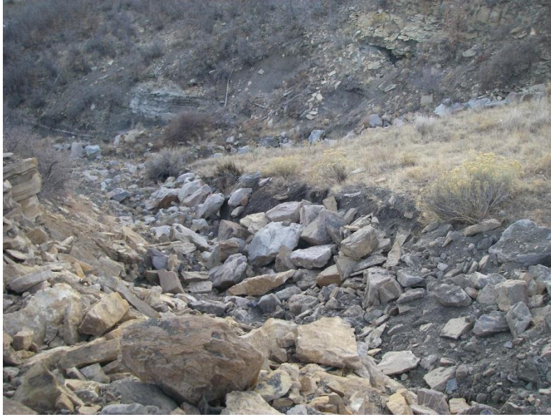
Channel below Fill 8 where Vince Massarotti performed rock work in 2017