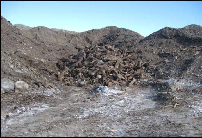
1. Remainder of tree stumps.