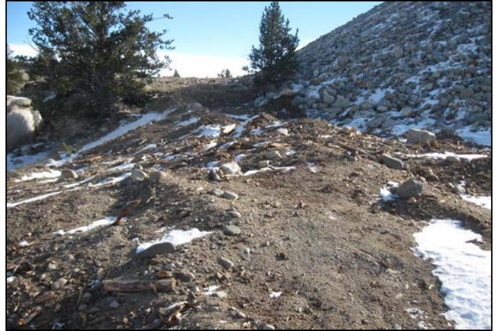
2. Area cleared of tree stumps and slash.