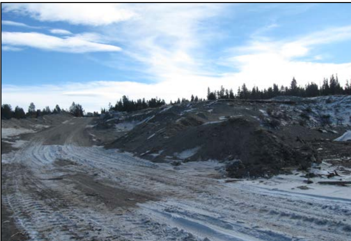
3. Area cleared of tree stumps and slash.