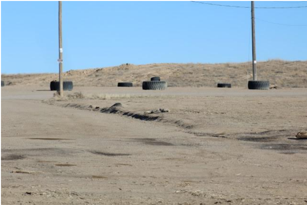
New corrections 2-25-2018