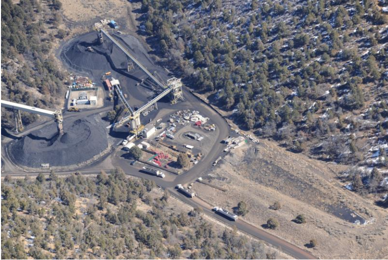
King II lower portion