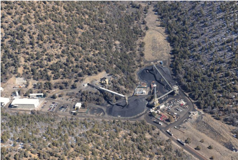
King II upper portion

Number of Partial Inspection this Fiscal Year: 7