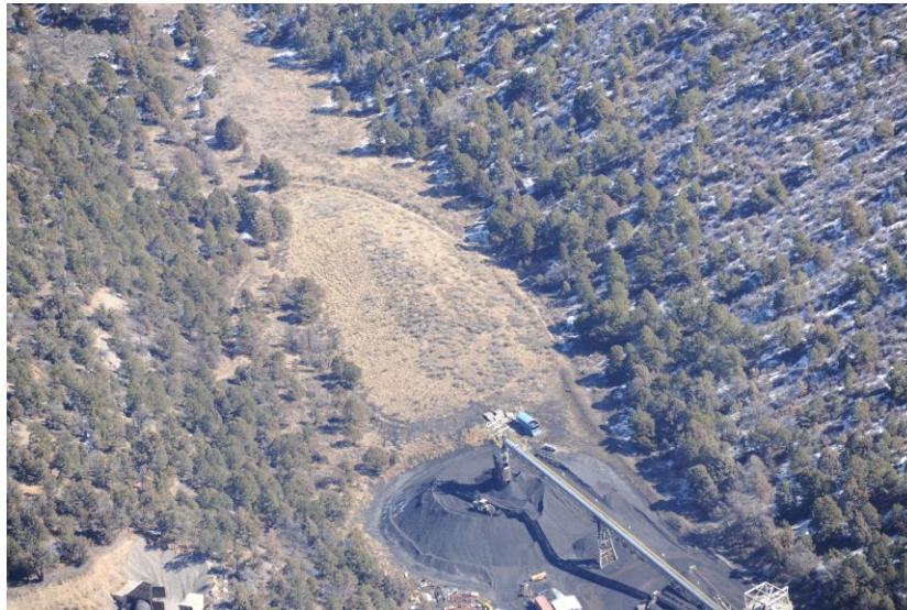
King II topsoil stockpile

Number of Partial Inspection this Fiscal Year: 7