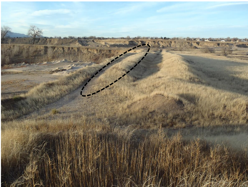
Photo 3. Row of survey markers delineating release area (right) from permit area (left).