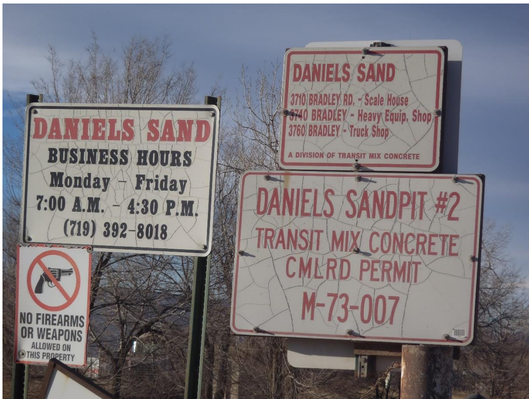
Photo 1. Permit sign at entrance.