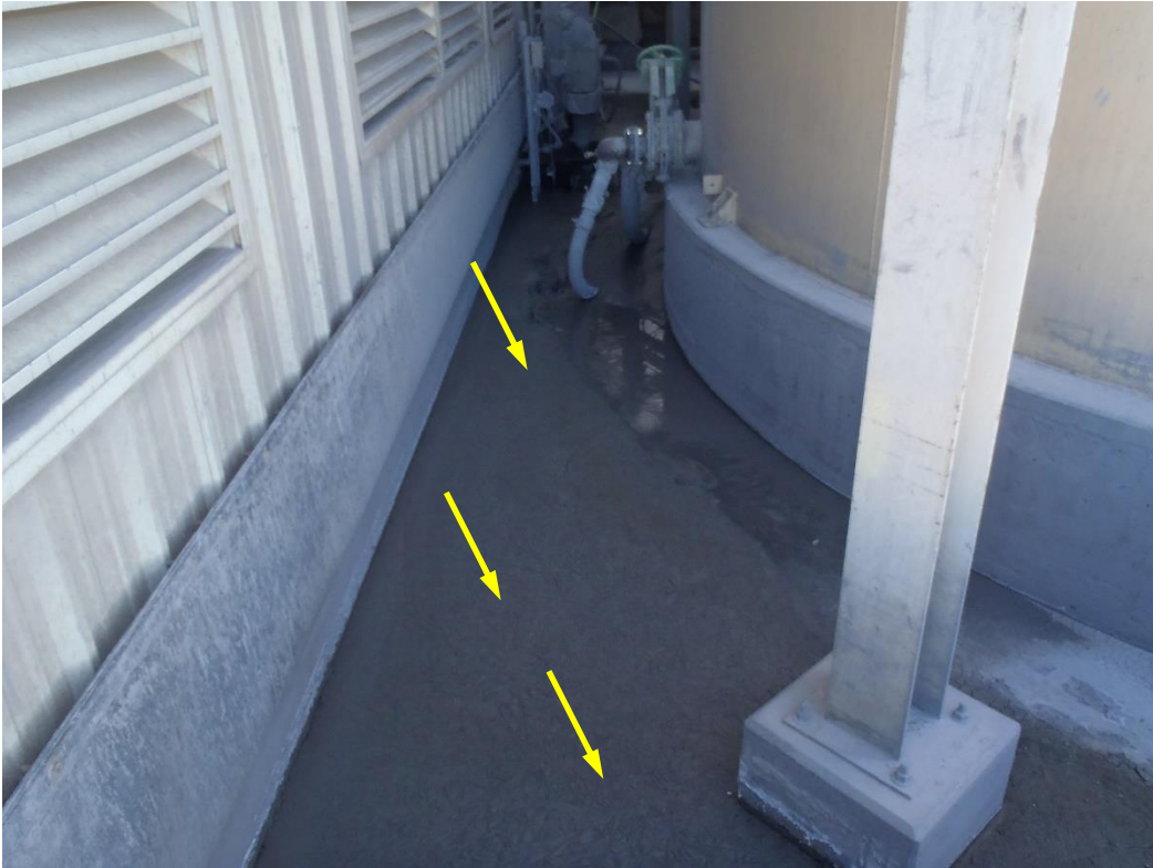
Photo 3. Vat leach secondary containment observed to be partially consumed.