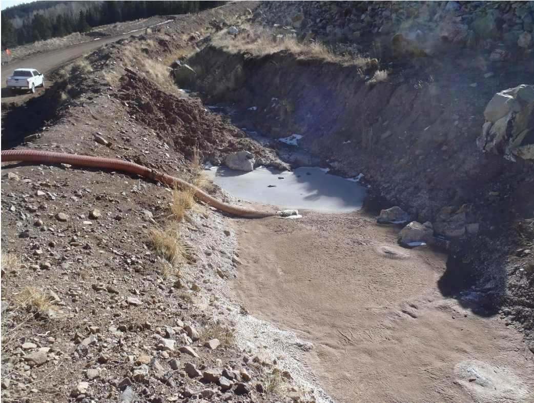
Photo 9. Ice and sediment observed in the ECOSA seep ponding area (looking south).