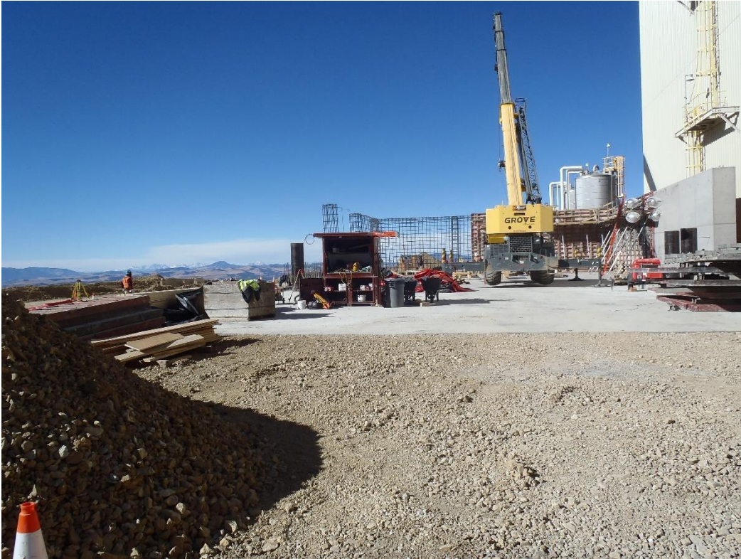
Photo 5. Concentrate shipping facility (Con Barn) construction (looking NW).