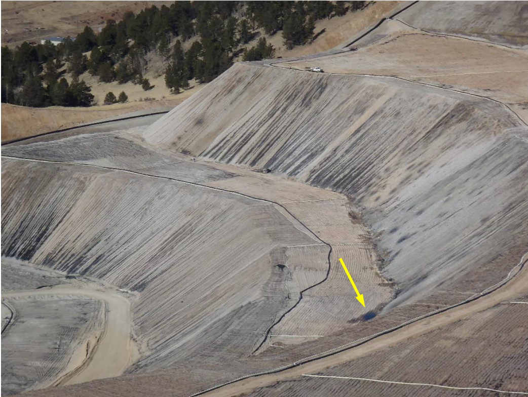
Photo 7. Ponded solution on SGVLF (from AGVLF overlook, looking NW).