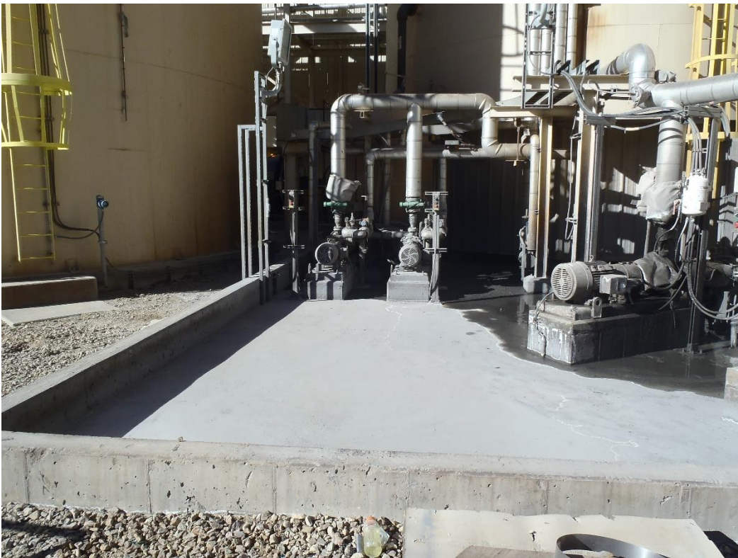
Photo 2. Neutral Process Water Tank secondary containment area.