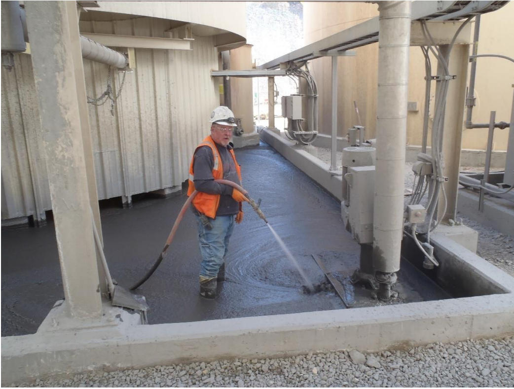
Photo 1. Crew washing slurry out of High pH Thickener secondary containment area.