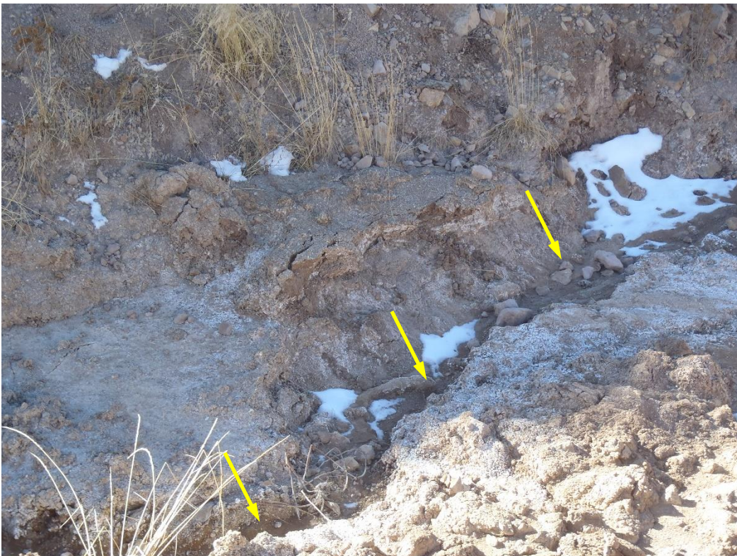
Photo 8. No flow in ECOSA seep area.