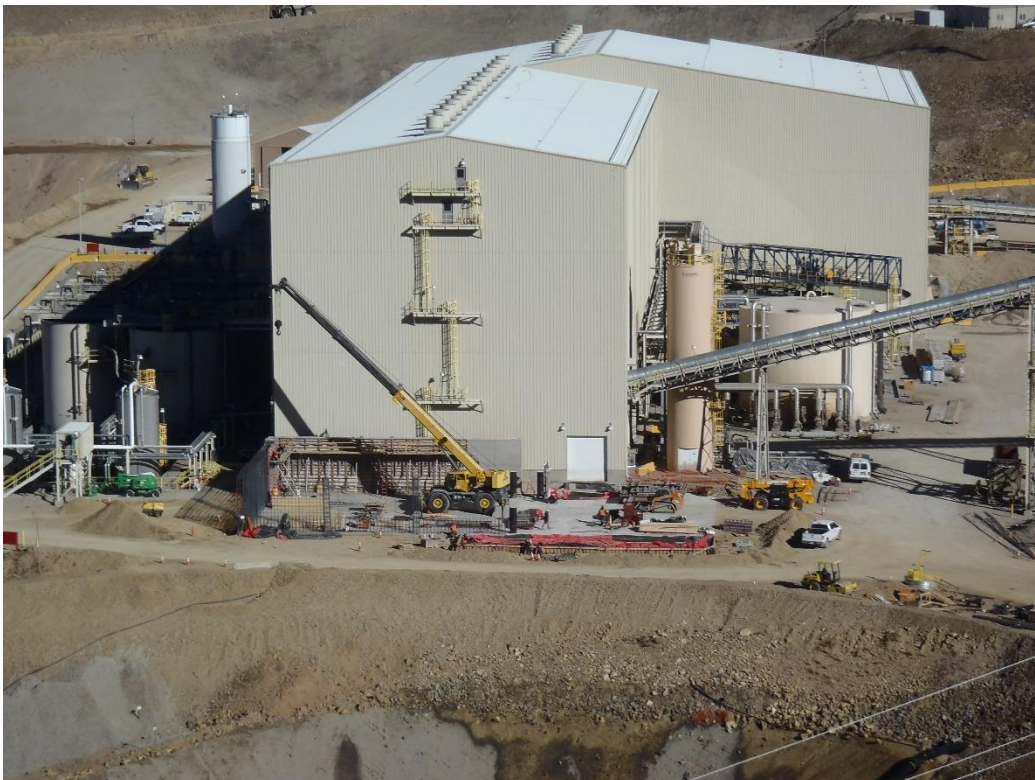
Photo 4. Concentrate shipping facility (Con Barn) construction (from AGVLF overlook, looking NNE).