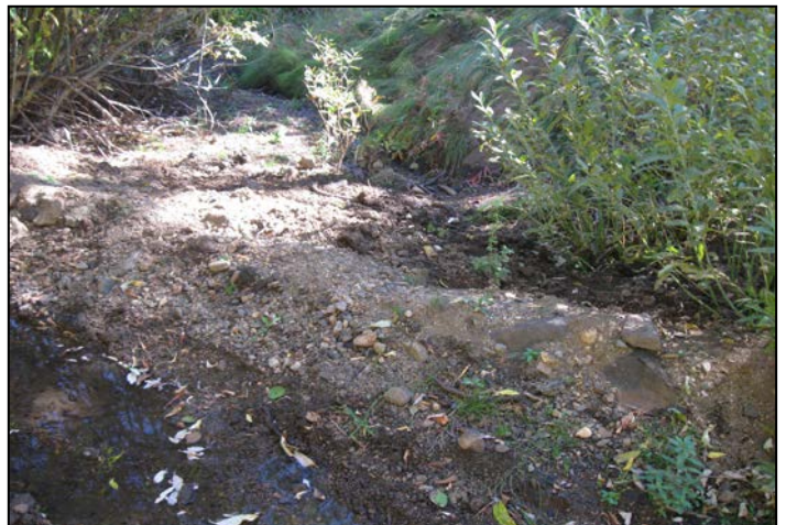
6. Backfilled area along the bank of Lump Gulch.