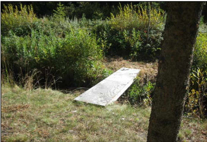
3. Footbridge across Lump Gulch.