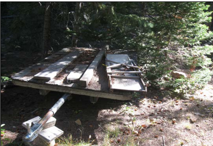
9. Trailer at campsite.