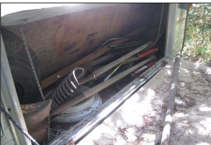
11. Tools present at camper van.