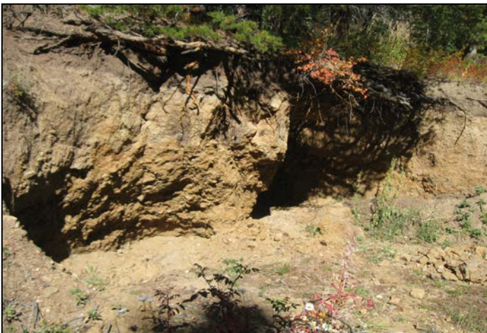
5. Excavation into western bank of Lump Gulch.