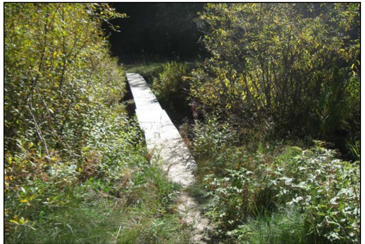
4. Footbridge across Lump Gulch.