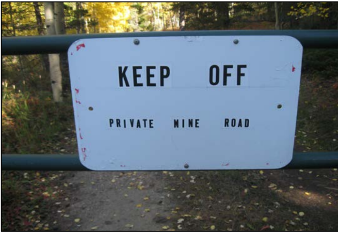
1. Sign posted at gate on USFS road.