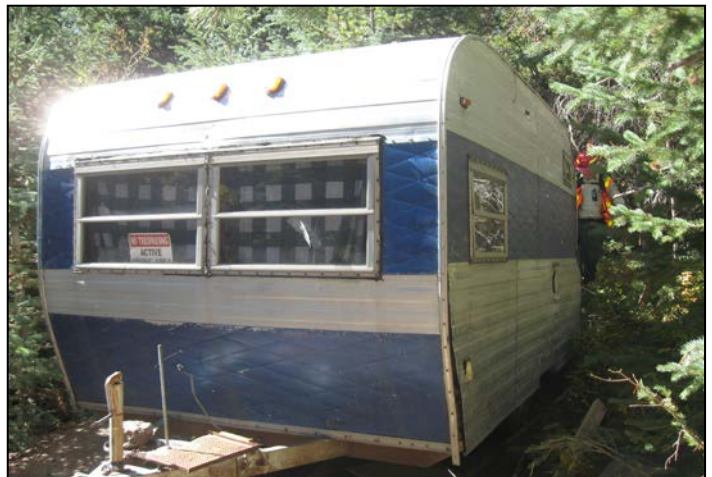
10. Camper van.