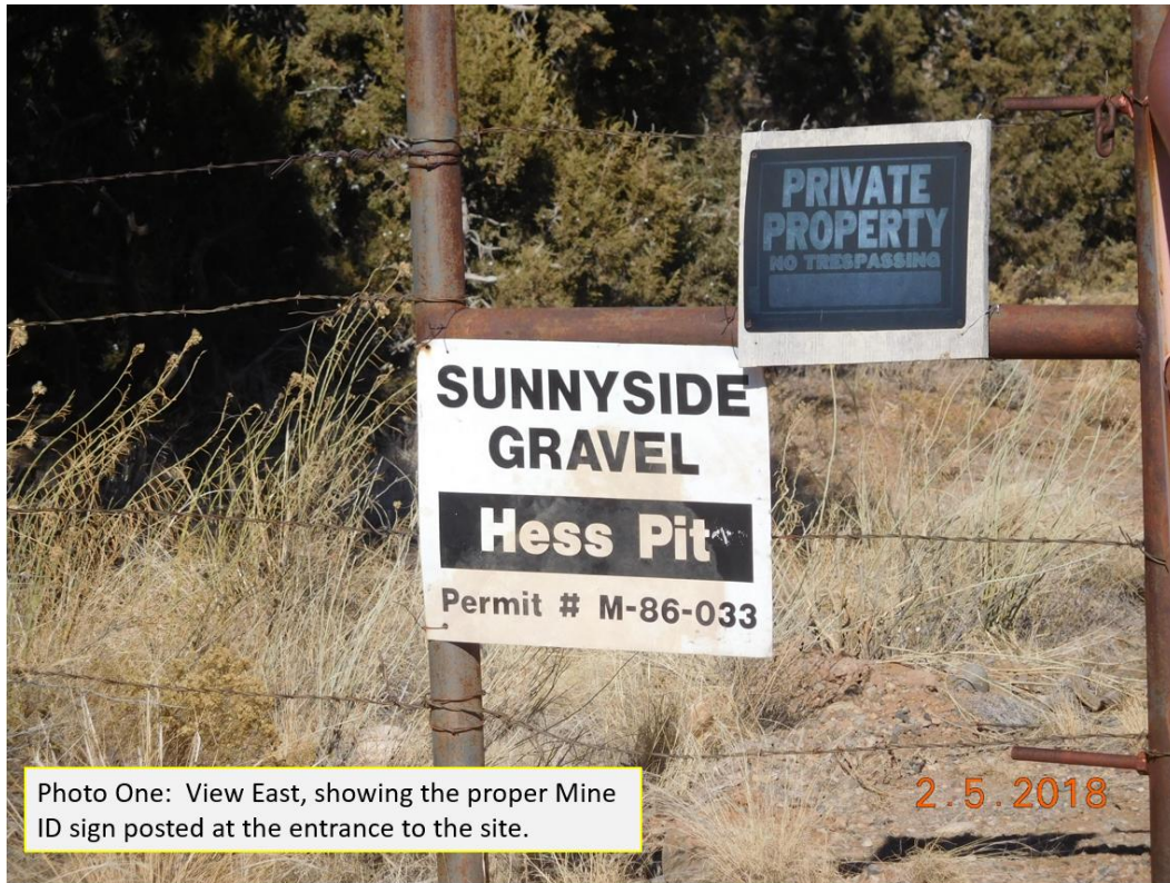
Photo One: View East, showing the proper Mine ID sign posted at the entrance to the site.