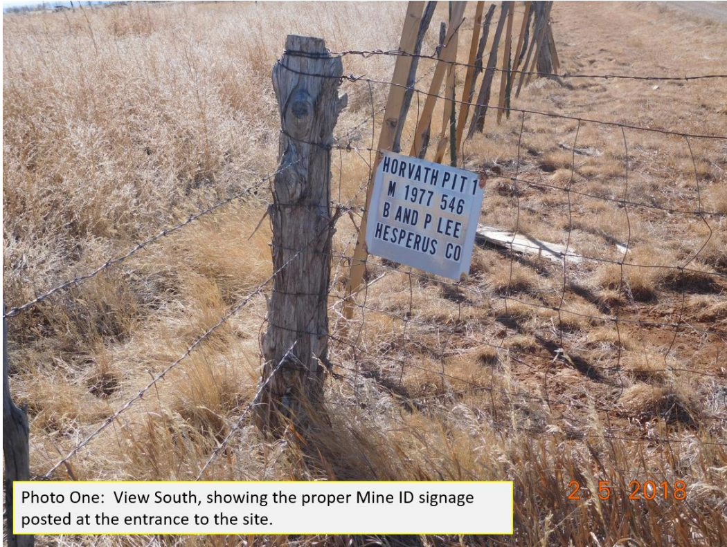
Photo One: View South, showing the proper Mine ID signage posted at the entrance to the site.