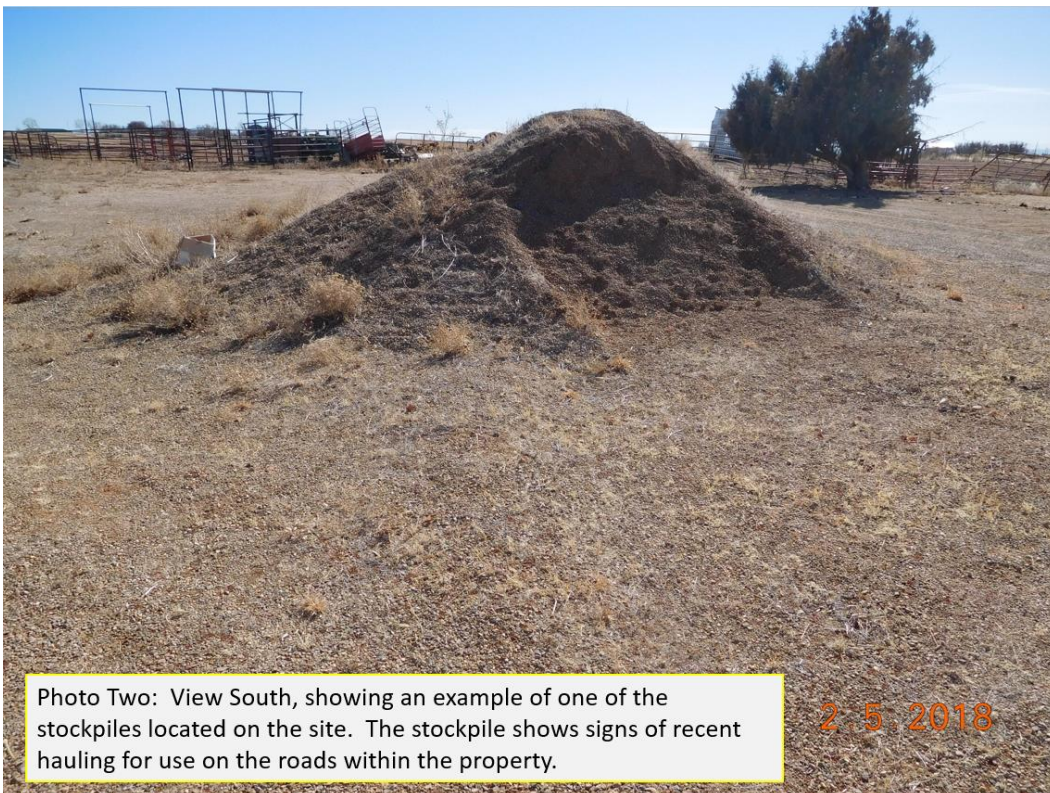
Photo Two: View South, showing an example of one of the stockpiles located on the site. The stockpile shows signs of recent hauling for use on the roads within the property.