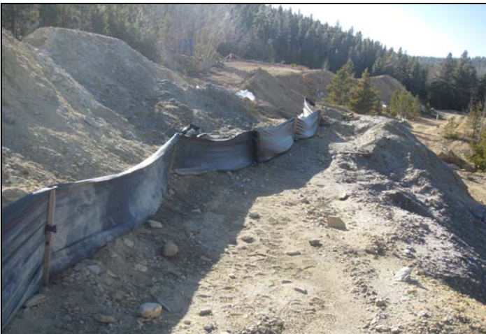
3. Silt fencing around mine dump.