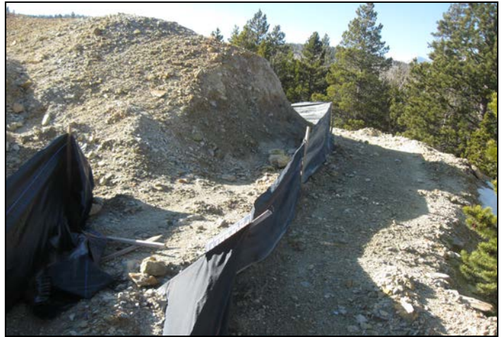
2. Silt fencing around mine dump.