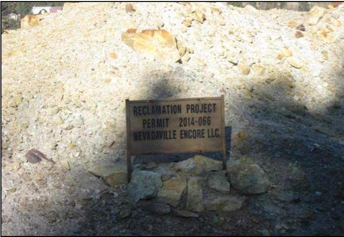
1. Permit sign.