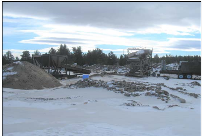
4. Wash plant for gold recovery.