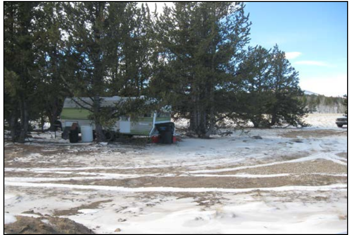
2. Trailer located outside of the permit boundary.