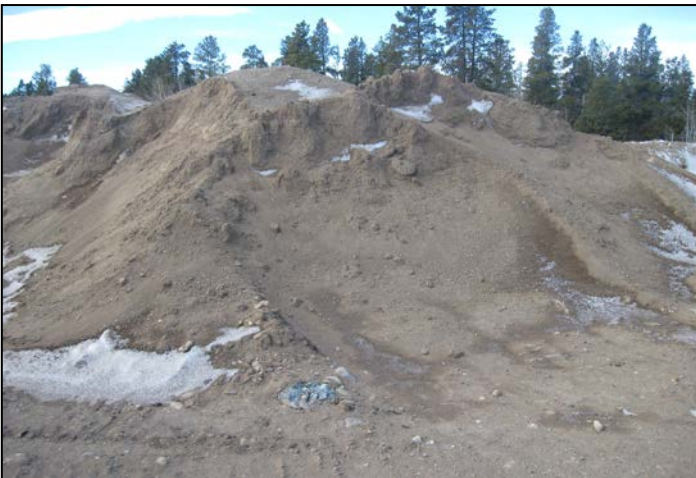
3. Screened topsoil stockpile.