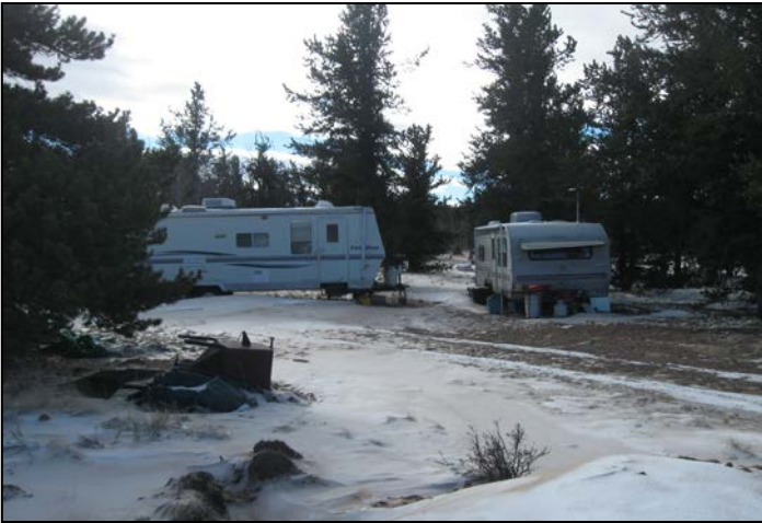
1. Trailers located outside of the permit boundary.