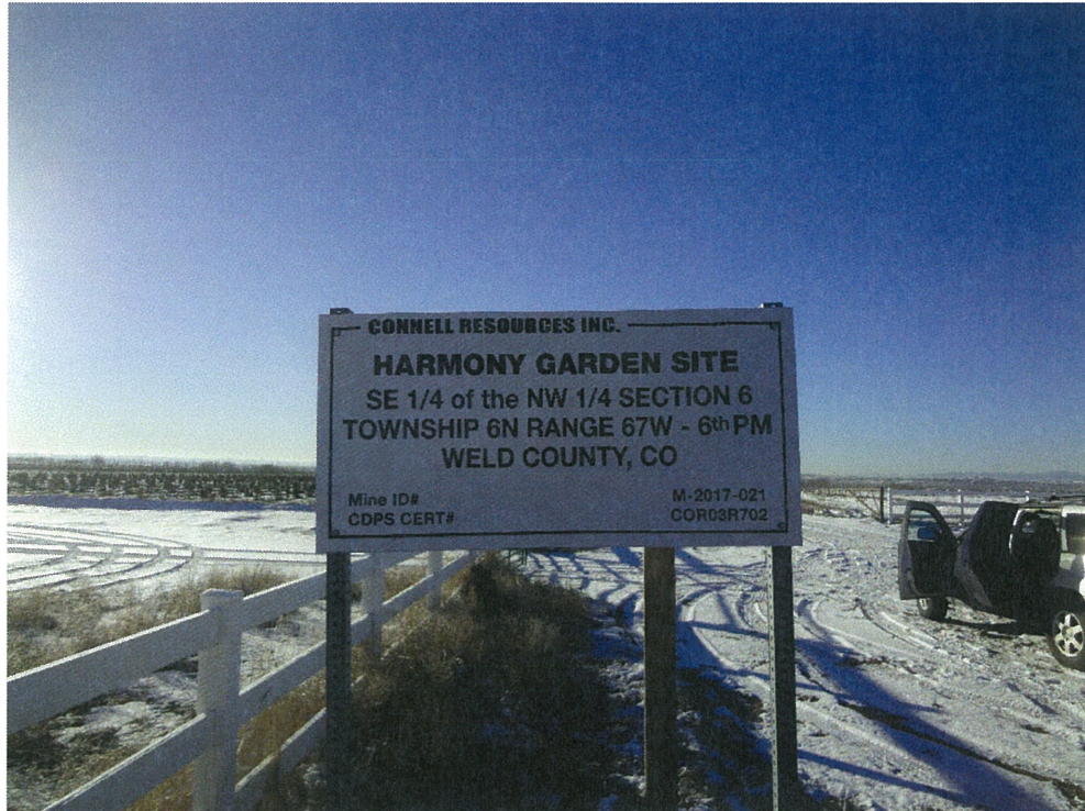
Harmony Gardens Site mine sign