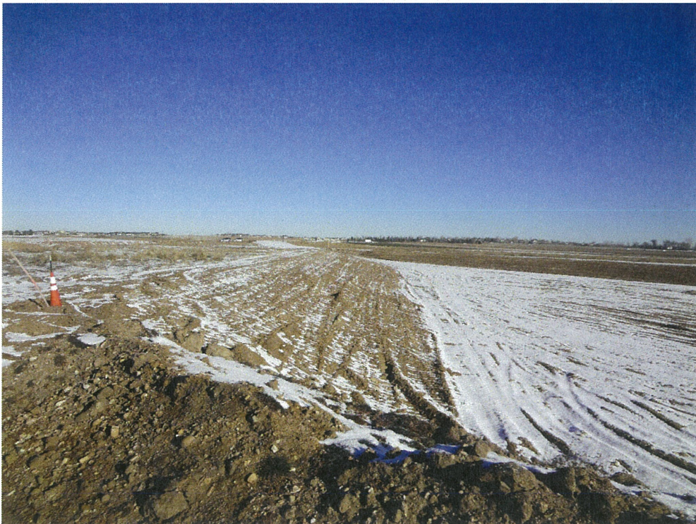
View of Phase 1 west slope from the SW corner of the phase looking north