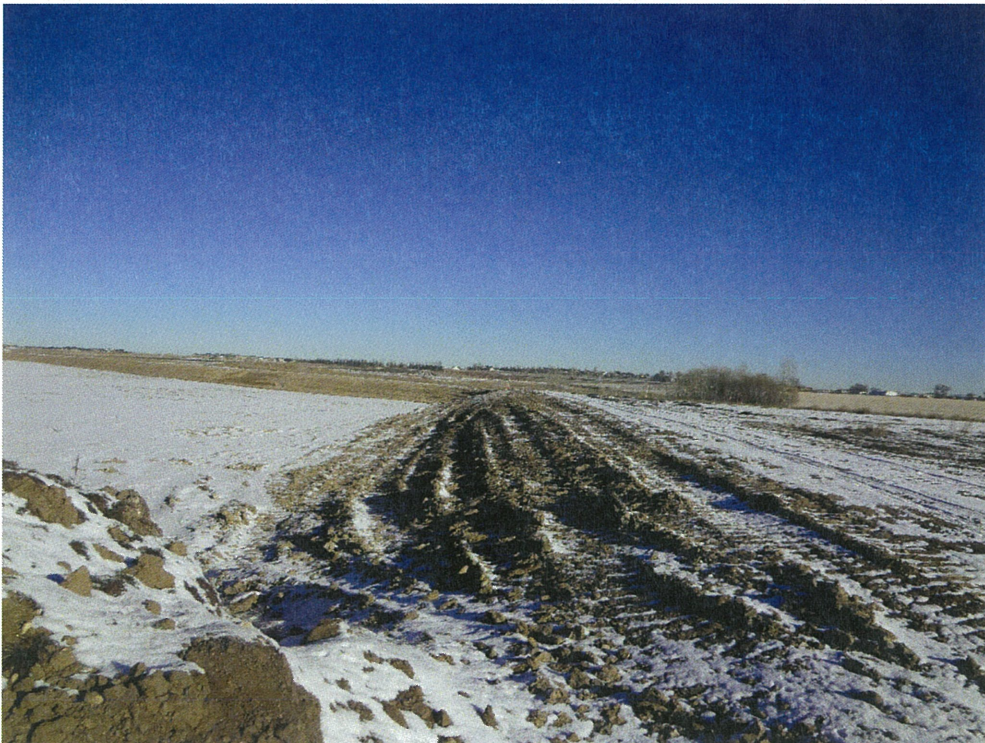
View of Phase 1 east slope from the SE corner of the phase looking north