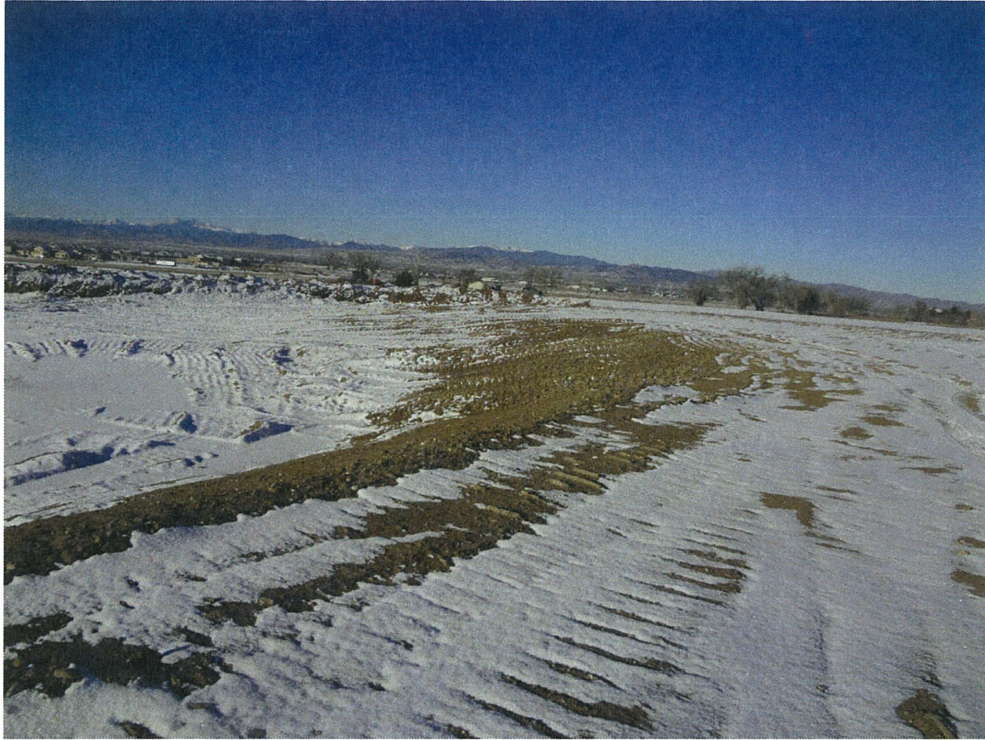
View of Phase 2 north slope from the NE corner of the phase looking west