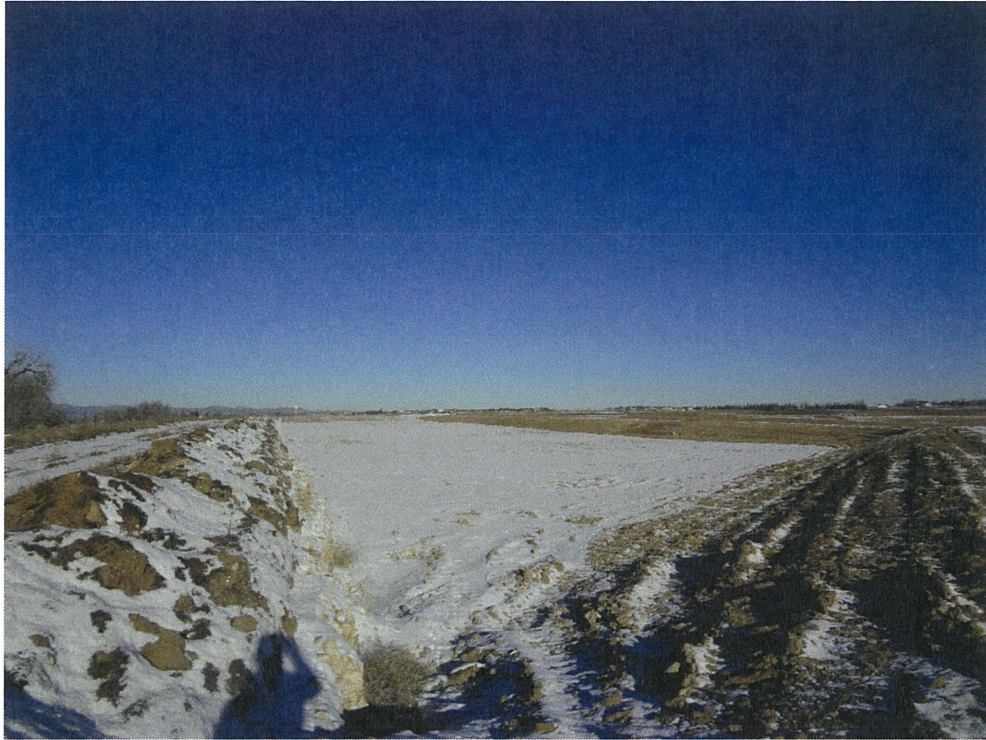
View of Phase 1 from the SE corner of the phase looking northwest