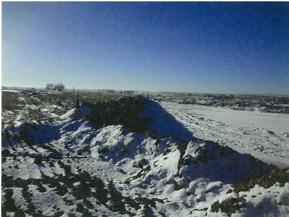
View of Phase 2 east highwall from the NE corner of the phase looking south