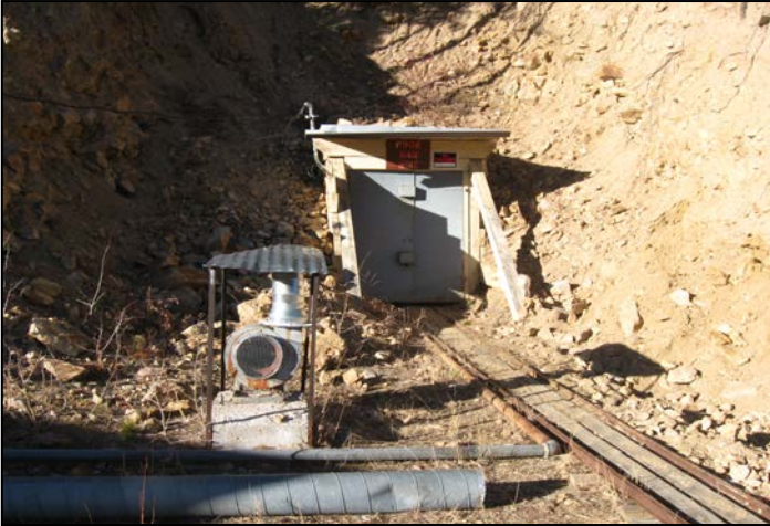
1. Portal with locking steel doors.