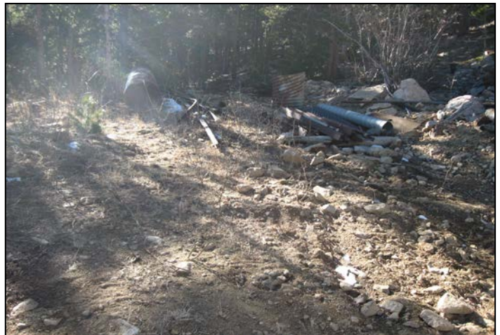
4. Scrap metal.