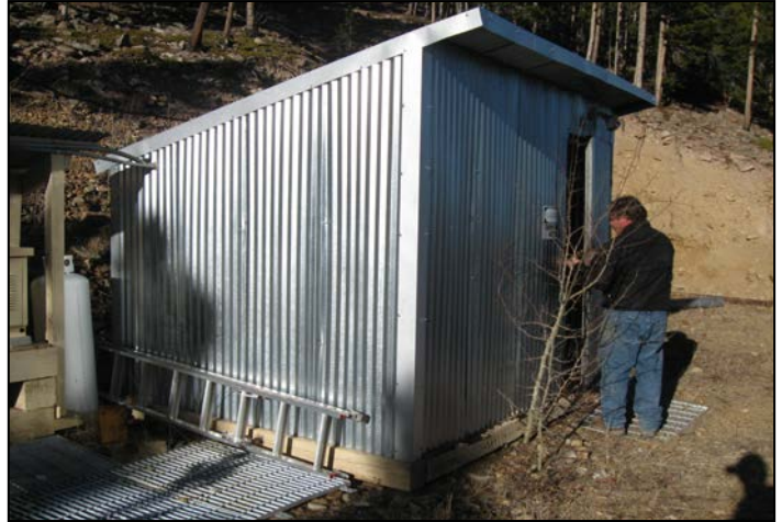
2. Mine office.