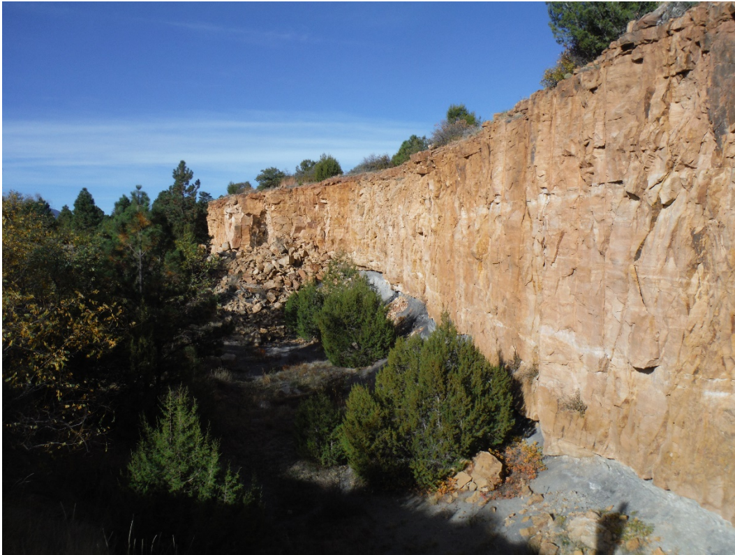
Photo 9. Historic (pre-permit) highwall located just north of the existing operation, located within the amendment area and proposed to be mined; looking west.