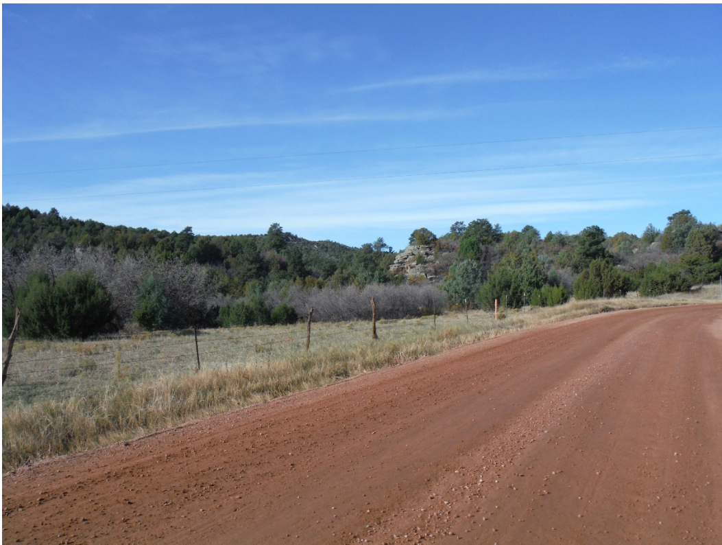
Photo 10. Sample photo of the northern portion of the amendment area; looking west from Siloam Road.