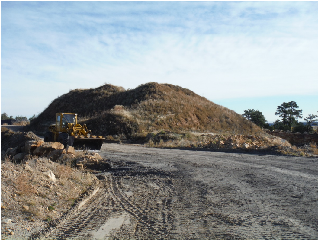
Photo 7. Sample photo of existing operations, vegetated topsoil stockpile; looking northeast.