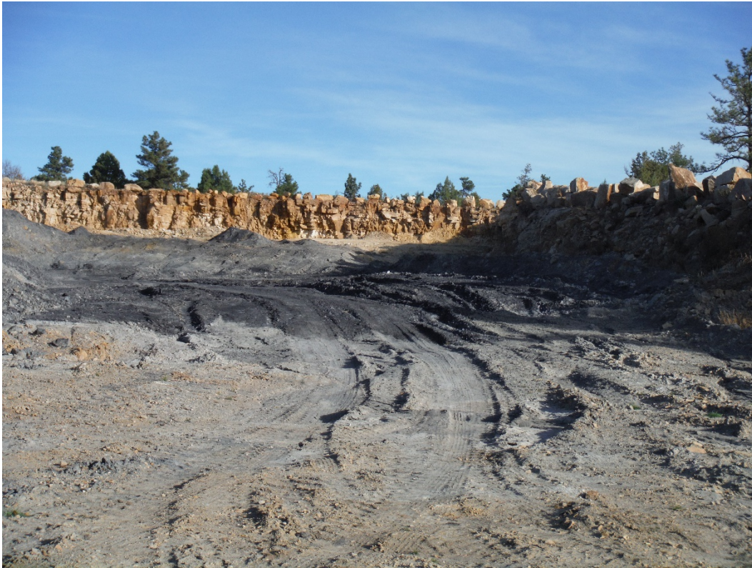
Photo 3. Sample photo of existing operations, sandstone has been removed, clay is exposed for mining; looking north.