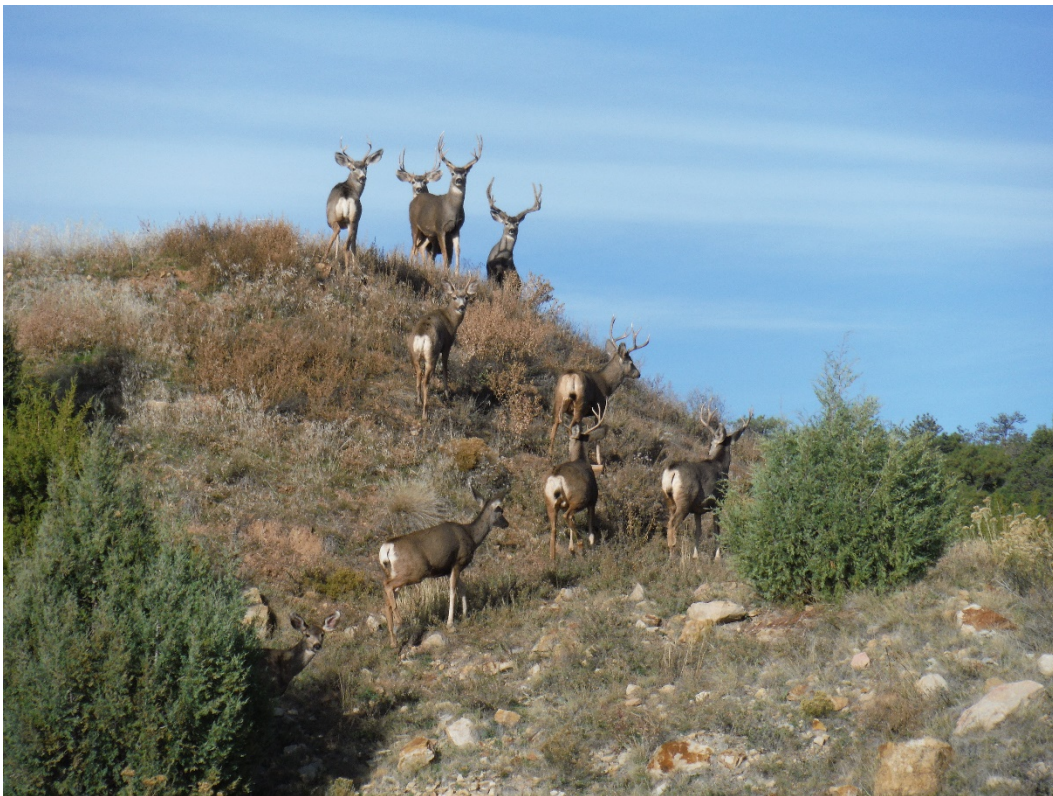
Photo 8. Mule deer observed on one of the site's topsoil stockpile; looking west.