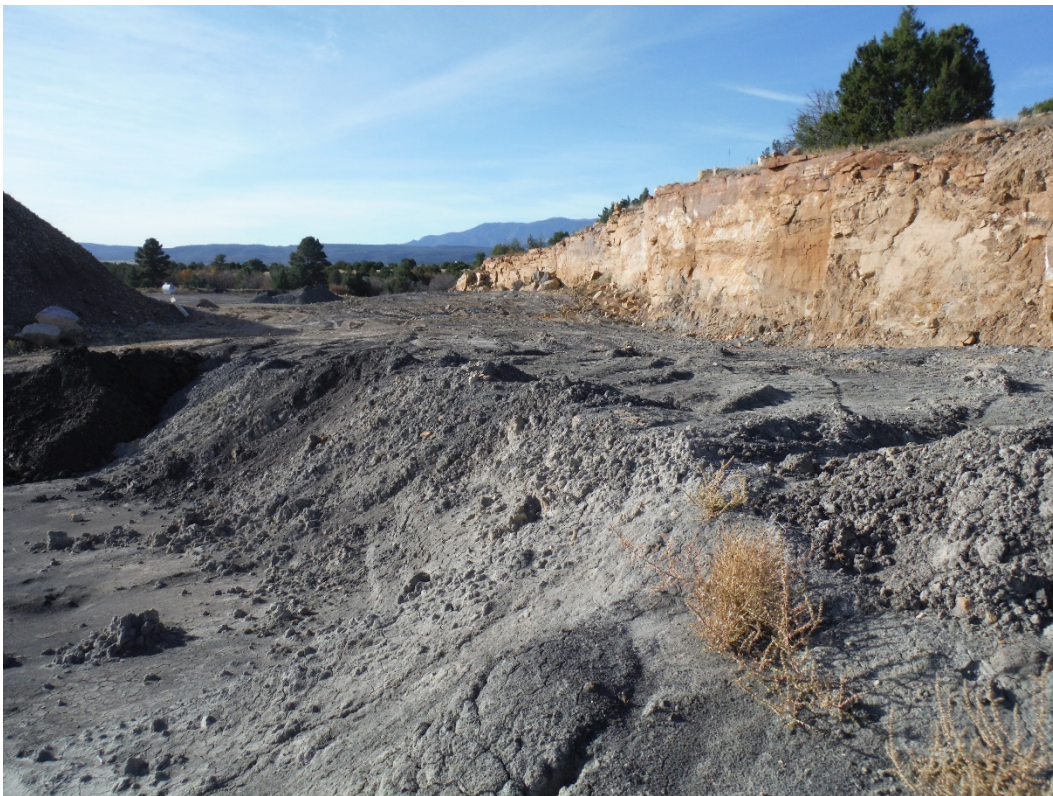
Photo 6. Sample photo of existing operations, clay currently being mined; looking south.