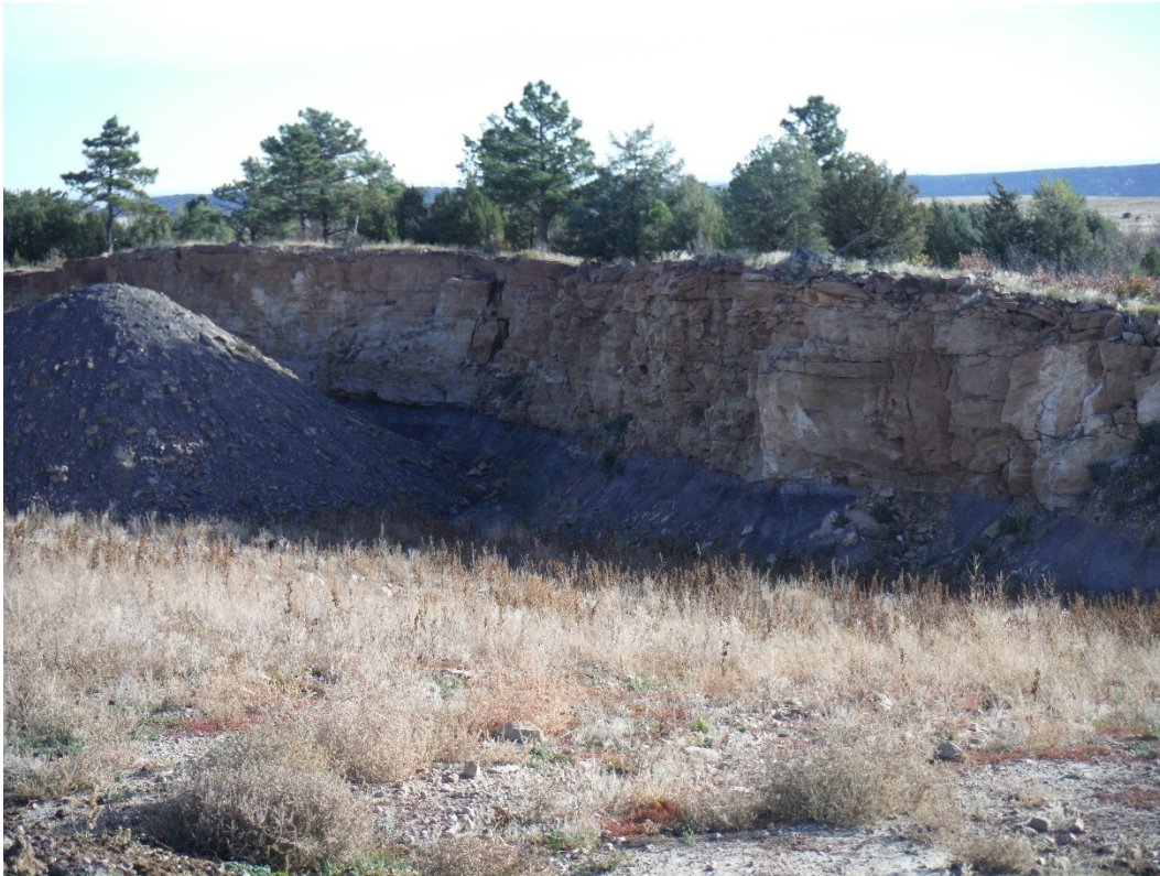
Photo 5. Sample photo of existing operations, sandstone and clay has been mined; looking northeast.