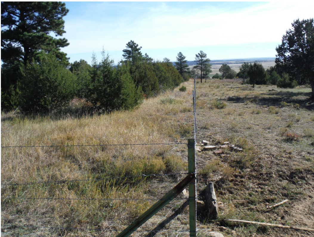
Photo 14. Sample photo of the western portion of the amendment area (right side of fence); looking.