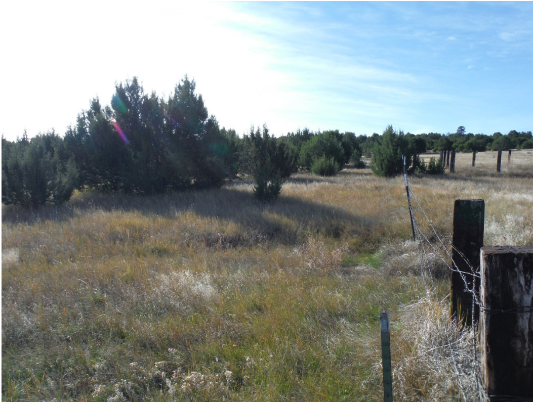
Photo 13. Sample photo of the northwest portion of the amendment area; looking south from Even Road.