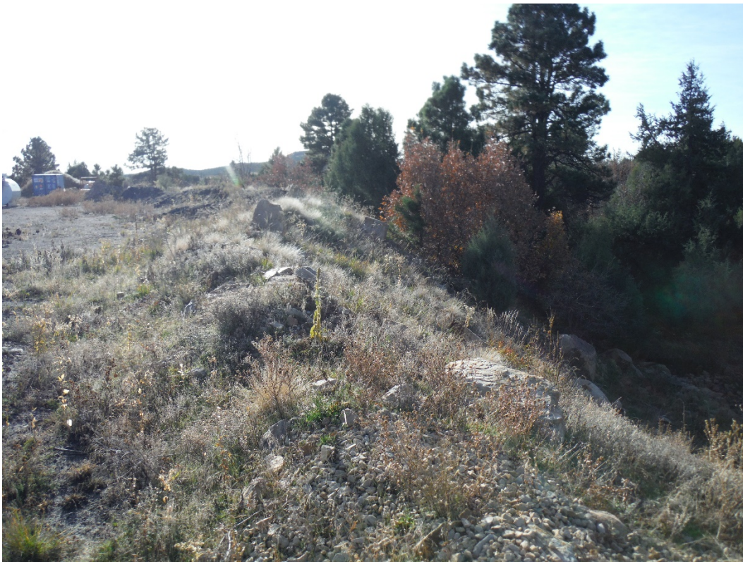
Photos 4. Berm between the southern edge of the operation and the drainage canyon located to the south of the existing operation; looking east.