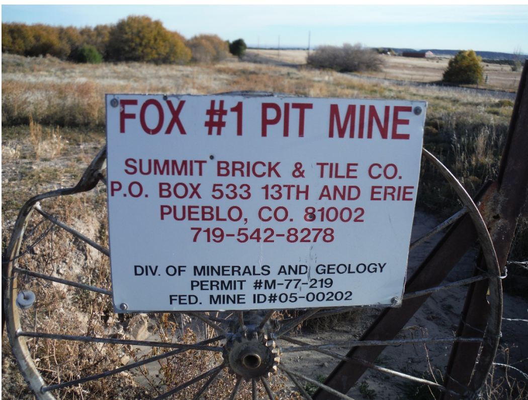
Photo 2. Permit identification sign posted at the entrance to the mine site; looking north.