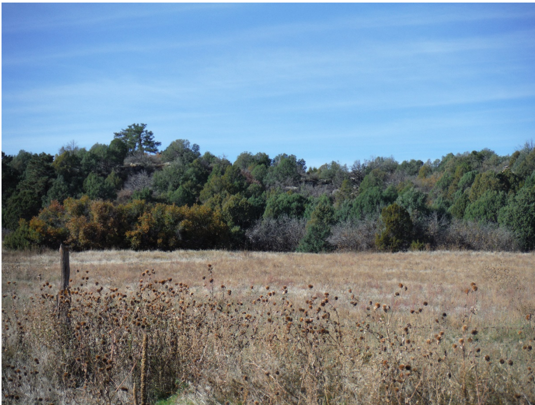
Photo 12. Sample photo of the central portion of the amendment area; looking west from Siloam Road.