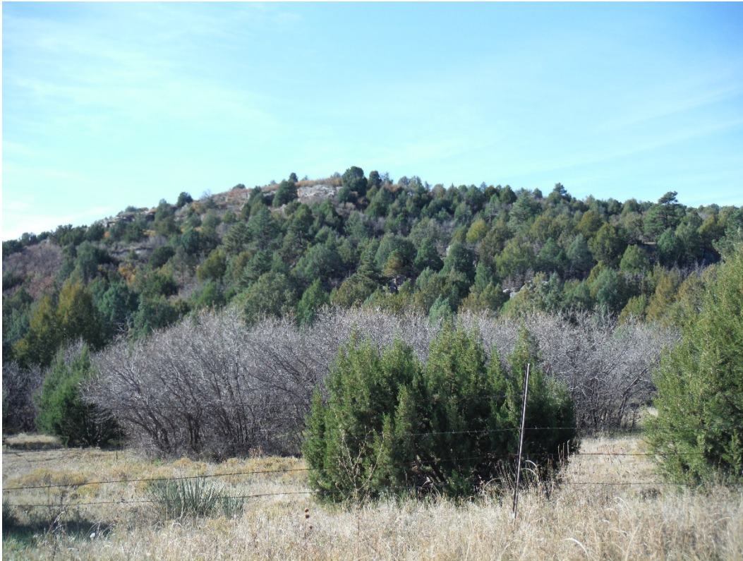
Photo 11. Sample photo of the northern portion of the amendment area; looking southwest from Siloam Road.