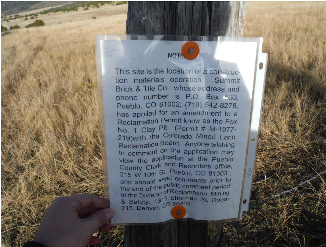
Photo 1. Sample site notice posted along Siloam Road; looking west.