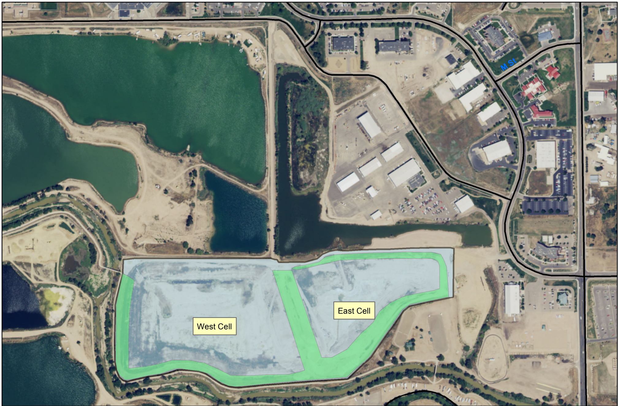
Geisert Pit M-1978-210 2018 Annual Report Site Map