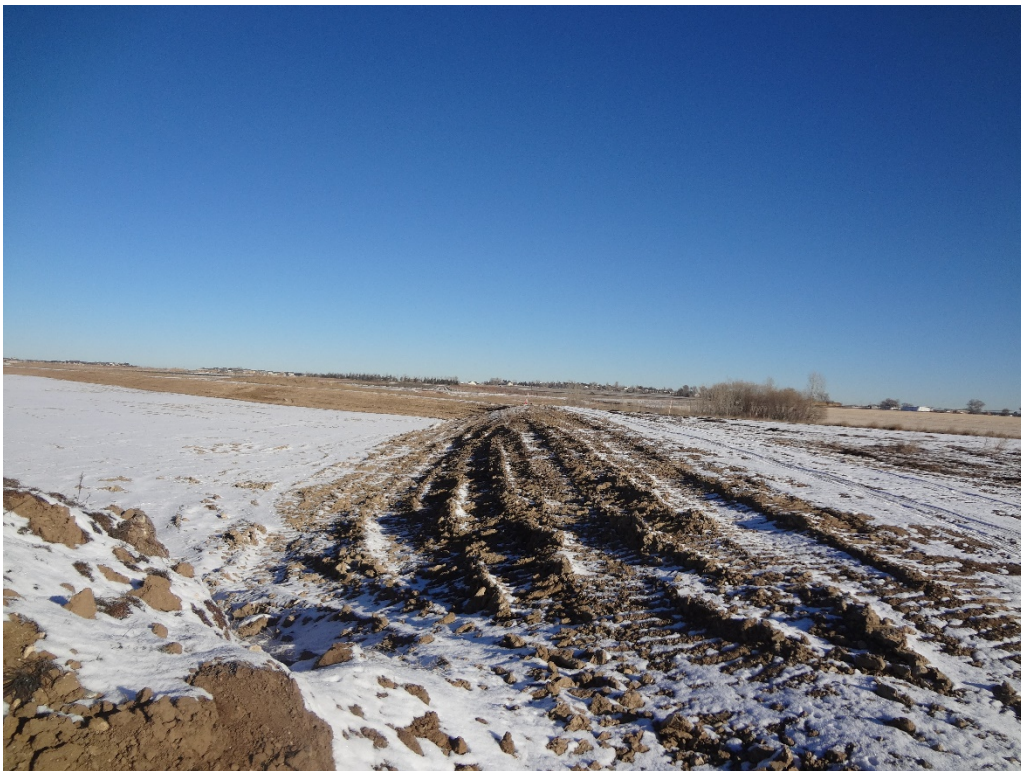
View of Phase 1 east slope from the SE corner of the phase looking north