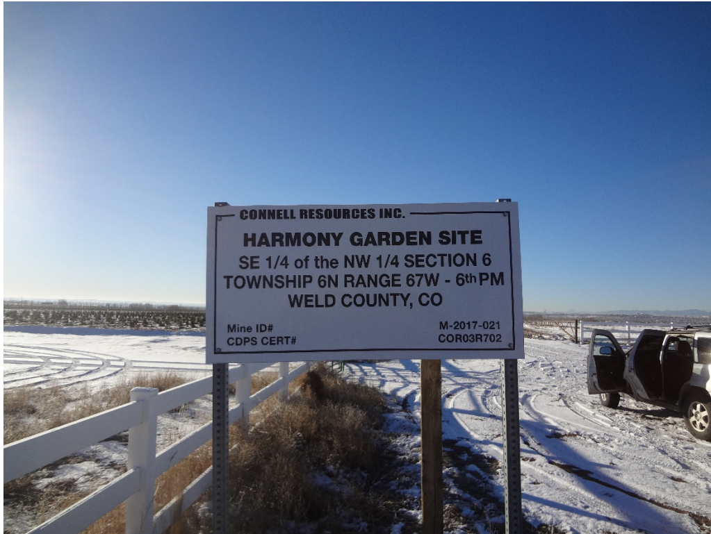
Harmony Gardens Site mine sign