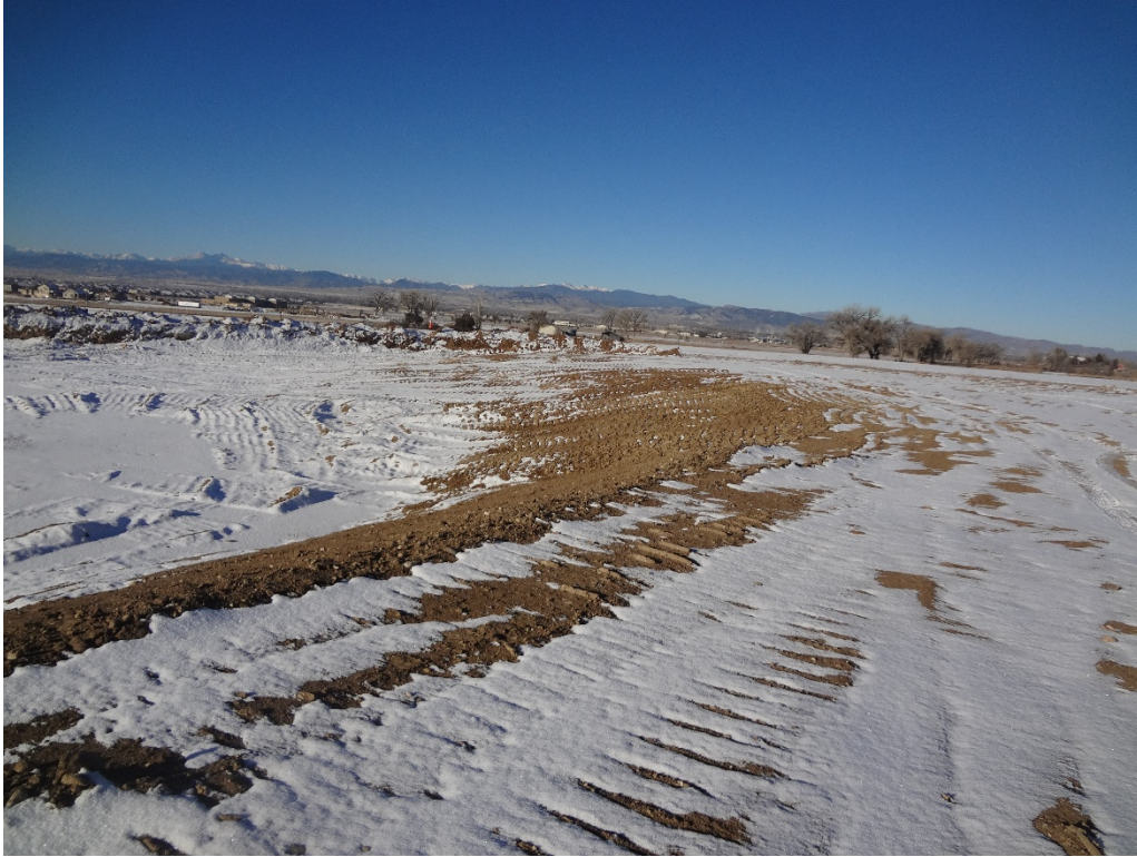
View of Phase 2 north slope from the NE corner of the phase looking west