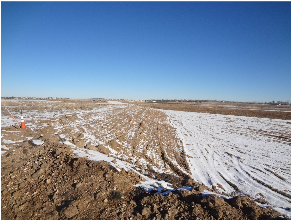
View of Phase 1 west slope from the SW corner of the phase looking north