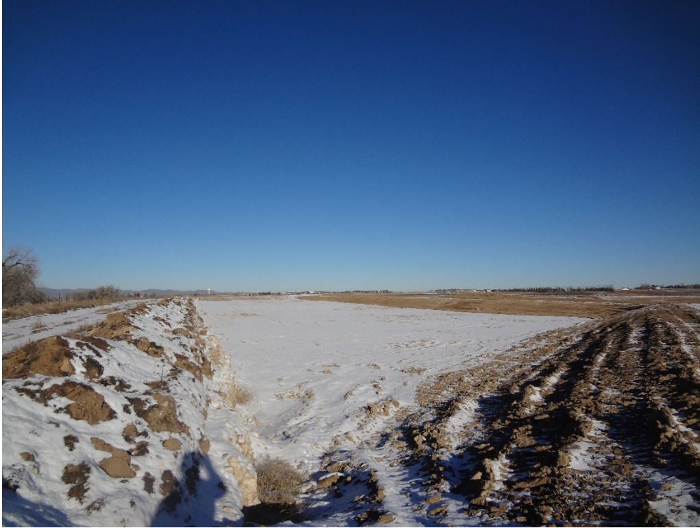
View of Phase 1 from the SE corner of the phase looking northwest