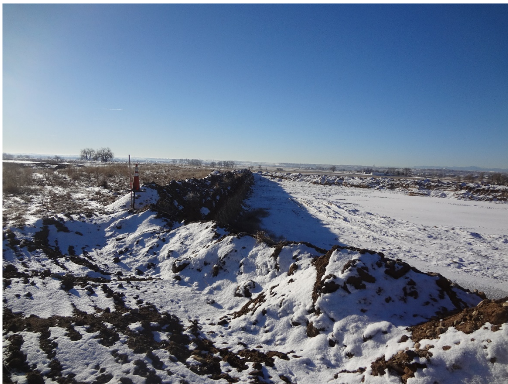
View of Phase 2 east highwall from the NE corner of the phase looking south