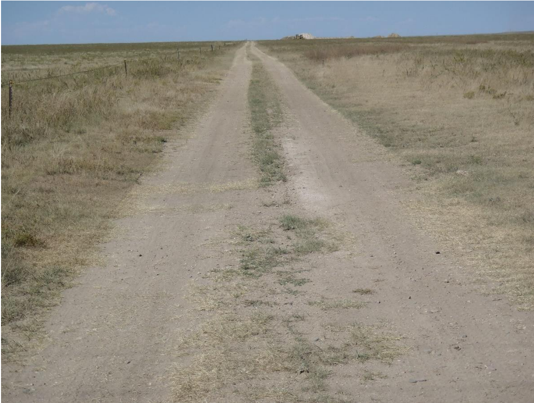
Photo 3. Haul/access road (looking west from County roads 22 & EE).