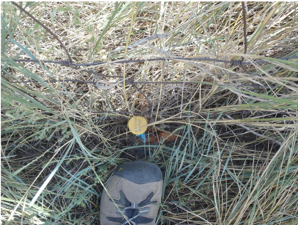
Photo 4. Typical survey pin marking road boundary.