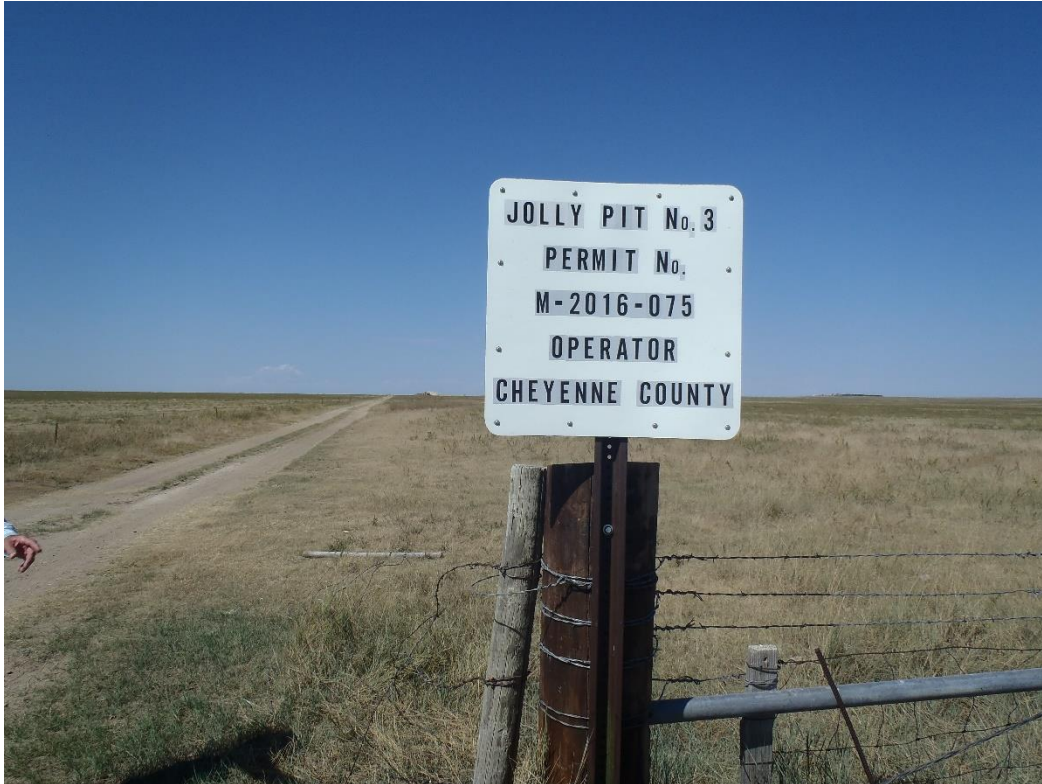
Photo 5. Permit sign (looking west from entrance off County roads).