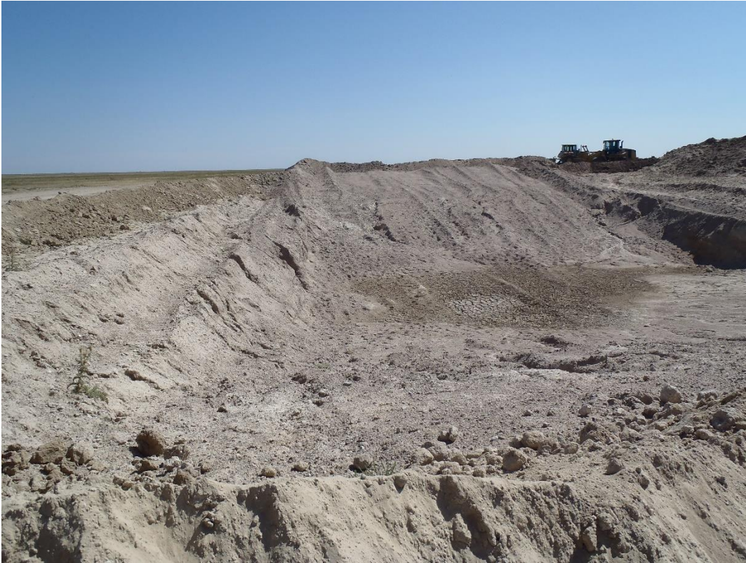
Photo 1. Active pit area, bottom (1 of 2, looking east from NW corner of pit).