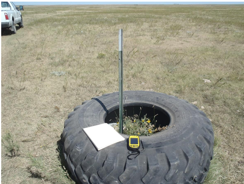
Photo 6. Typical permit boundary corner marker.