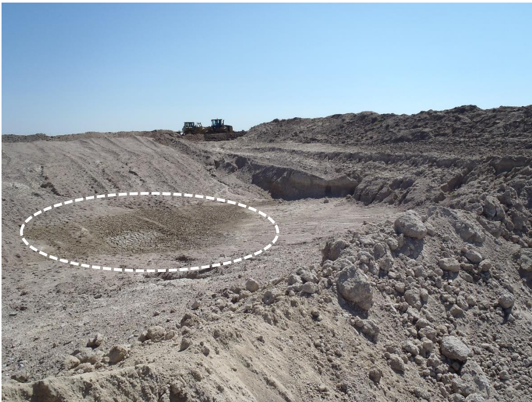
Photo 2. Active pit area, bottom (2 of 2, looking SE from NW corner of pit, note dried mud).