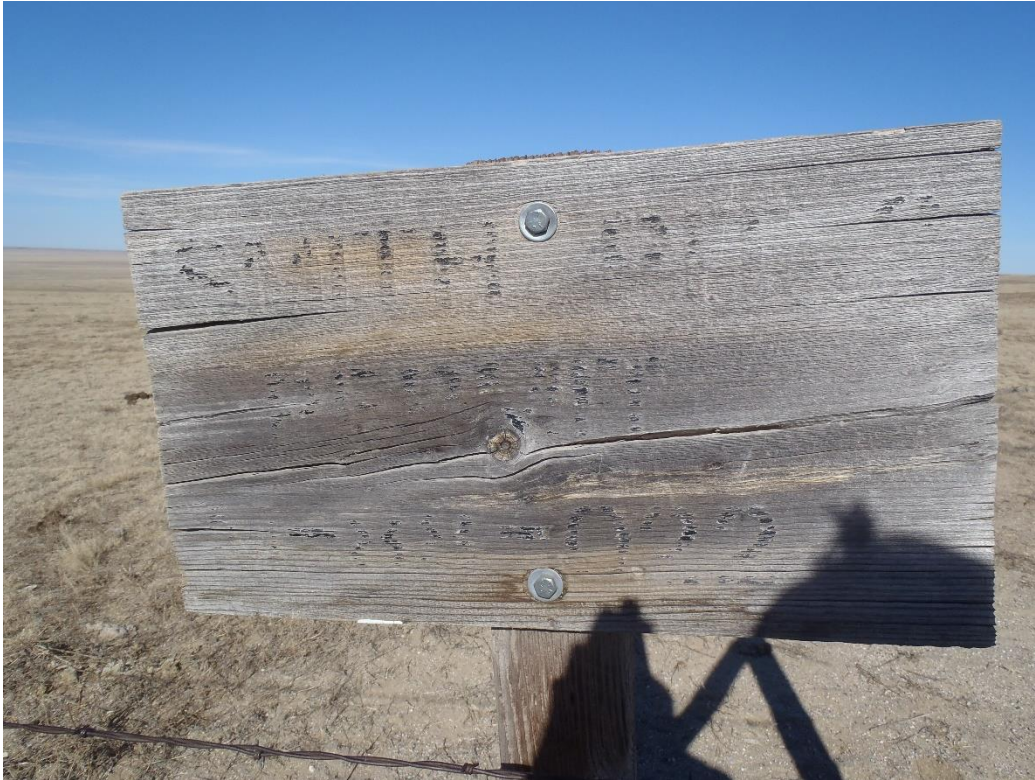
Photo 6. Permit sign off County Road T (requires repainting or replacement).