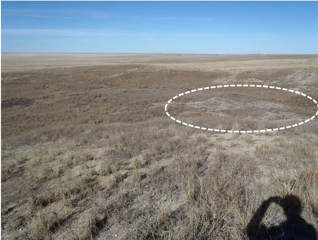
Photo 2. Reclamation grading (2 of 3, looking NW from SE corner of site, note bare area).