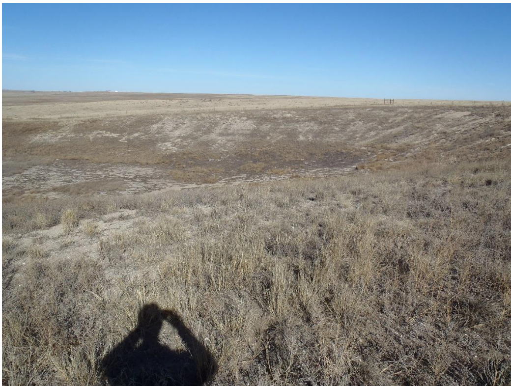
Photo 3. Reclamation grading (3 of 3, looking north from SE corner of site).