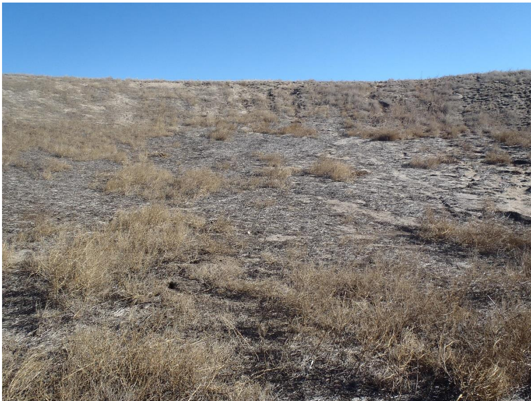
Photo 5. Typical weeds on east pit slope (looking east from pit floor).