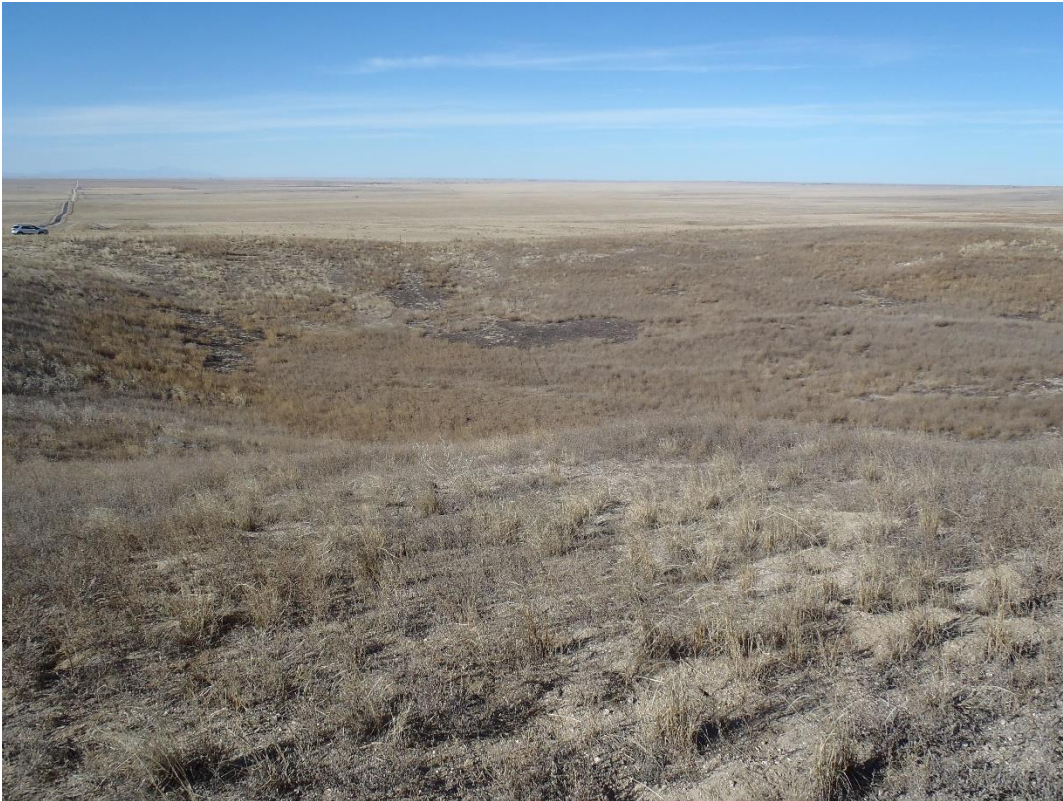
Photo 1. Reclamation grading (1 of 3, looking west from SE corner of site).