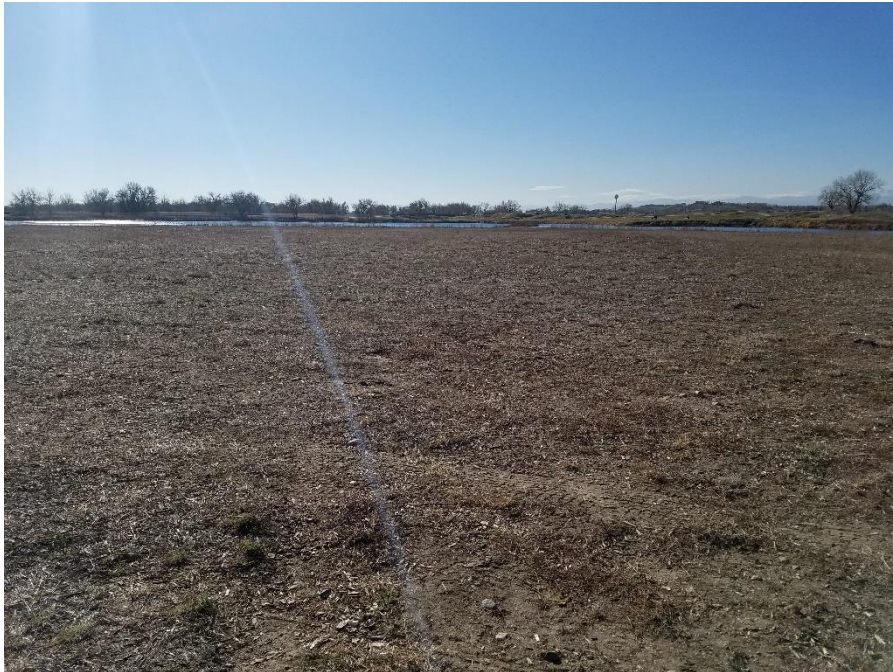
Figure 2. From the north end of the site looking south, inert fill area.