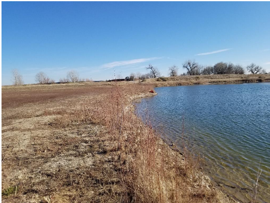
Figure 4. Northern pond slope looking east.