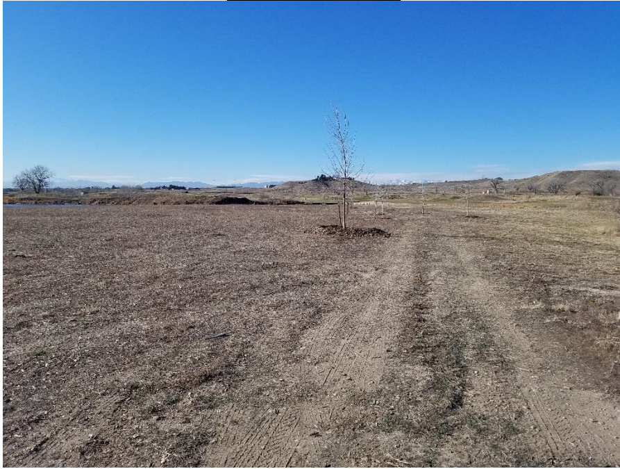
Figure 1. From the north end of the site looking southwest.