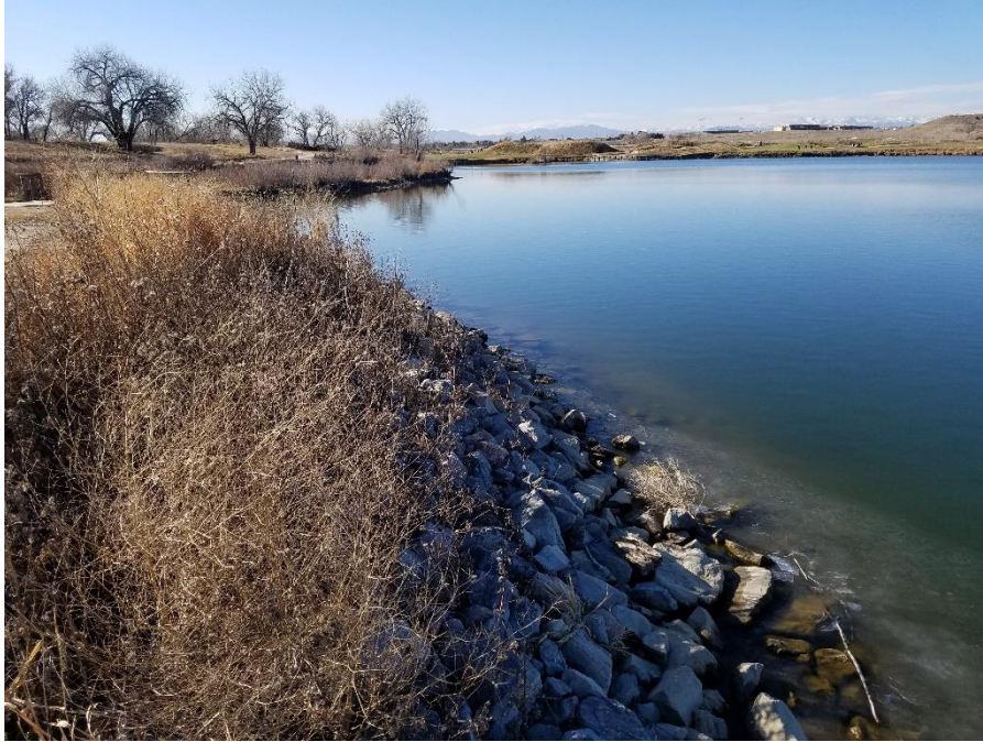
Figure 5. Shoreline stabilization along the southern shore. Looking west.