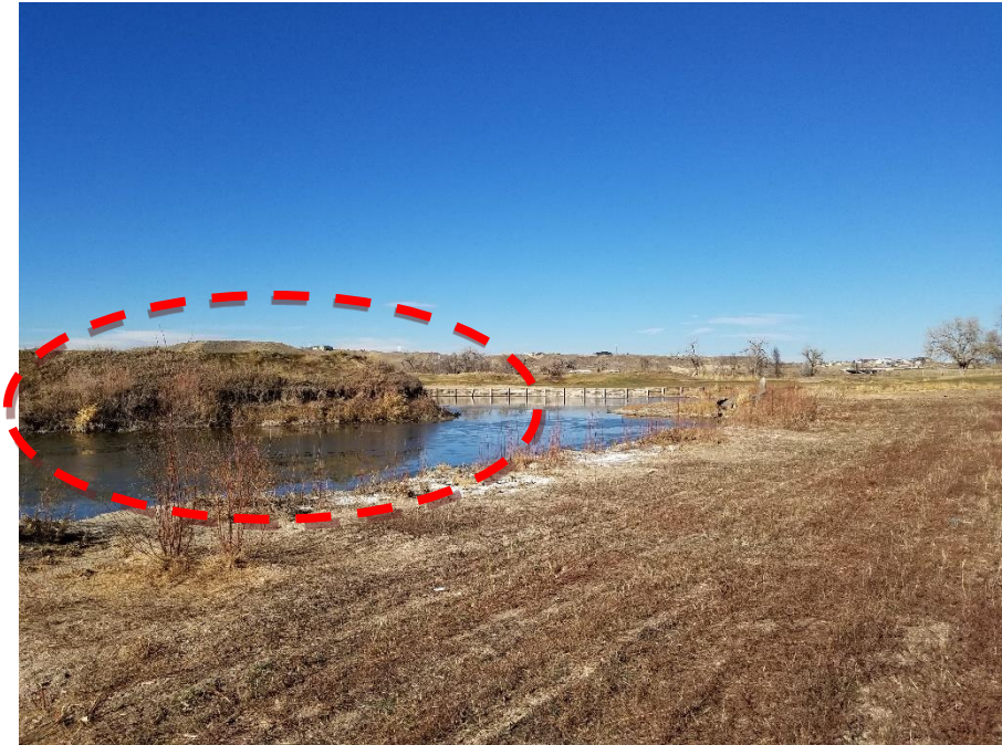
Figure 3. Shoreline sluffing and erosion on western slope, approximate 100' section shown on TR02 Figure 2 Map.