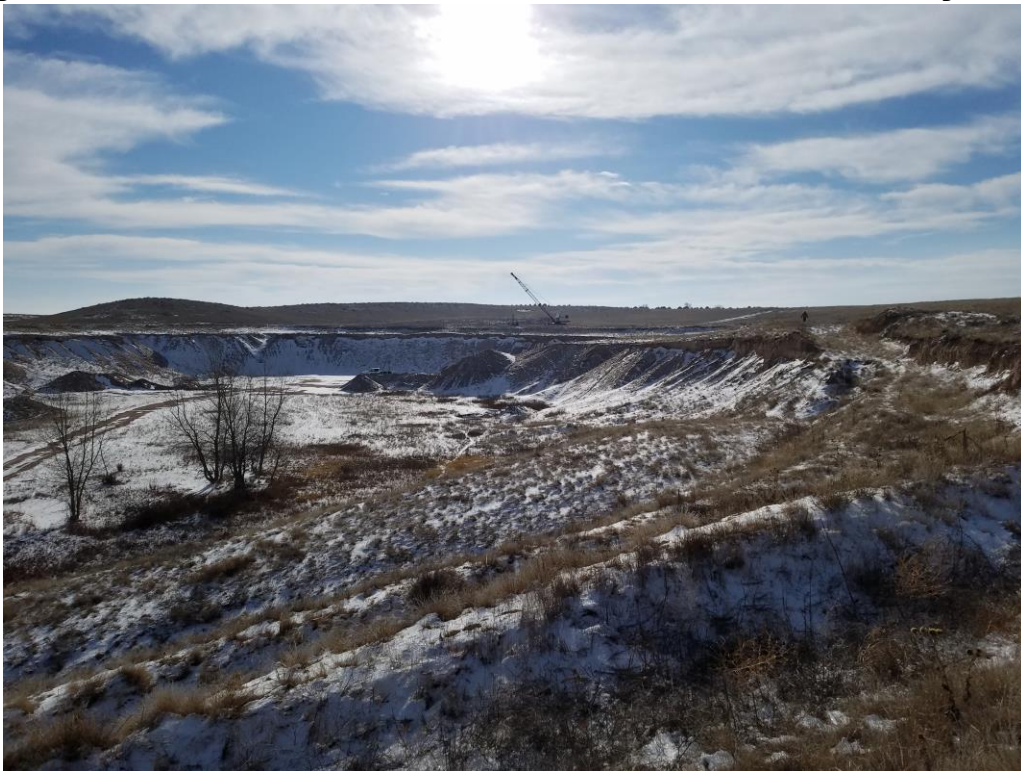
Figure 2. From the northwest end of the affected land looking south.