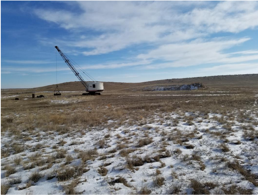
Figure 3. From the south end of the permit area looking northeast.