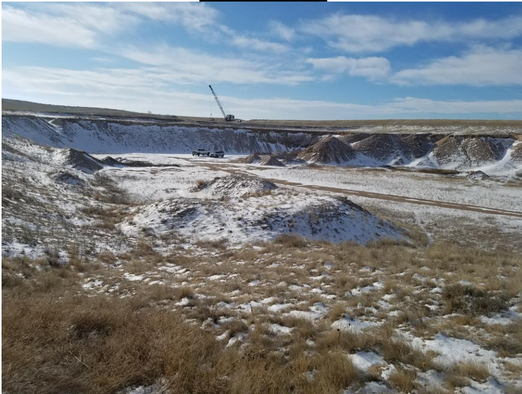
Figure 1. From the northeast end of the affected land looking south.