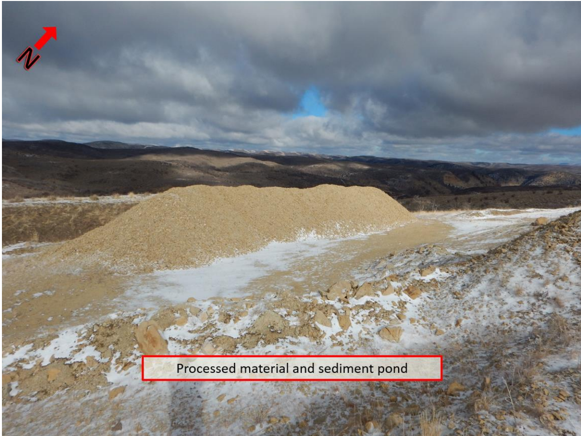
Processed material and sediment pond