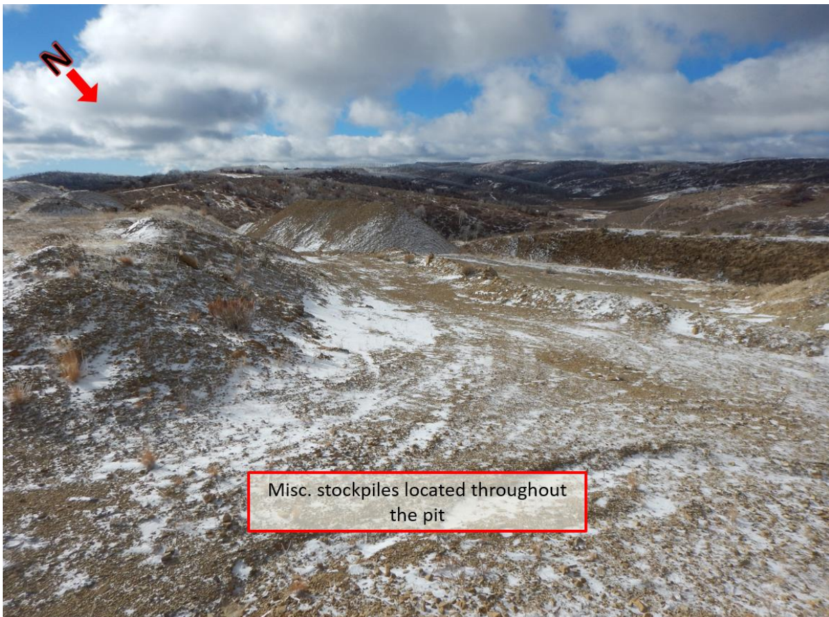
Misc. stockpiles located throughout the pit