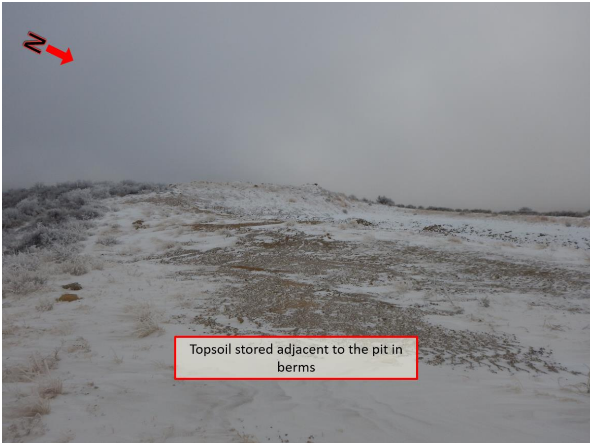
Topsoil stored adjacent to the pit in berms