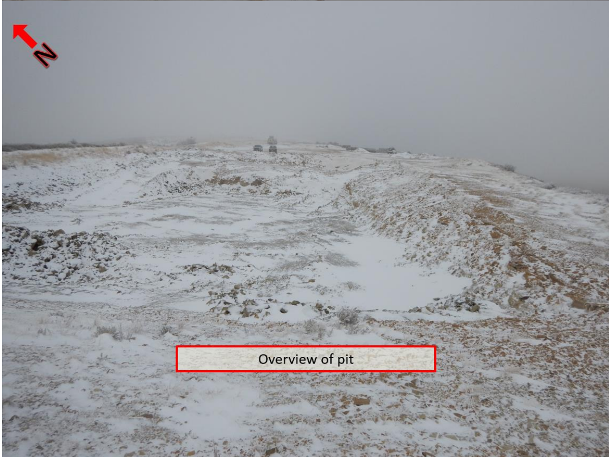
Overview of pit