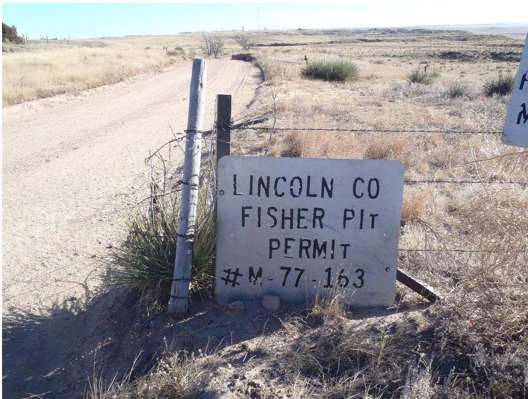
Photo 7. Permit sign at entrance.