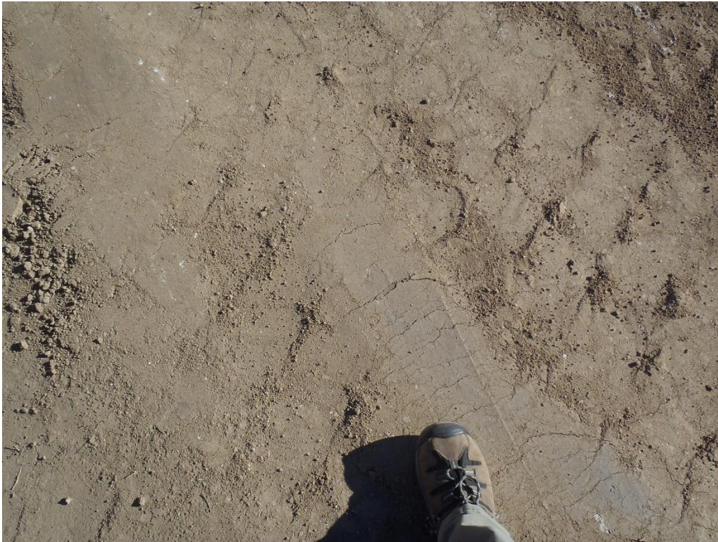
Photo 6. Heavily compacted soil in second from west gully repair.