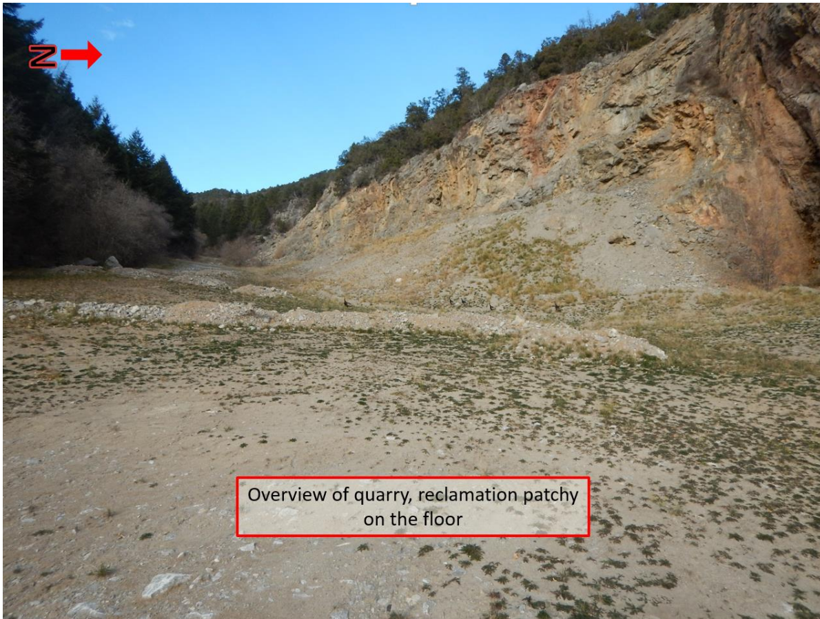
Overview of quarry, reclamation patchy on the floor