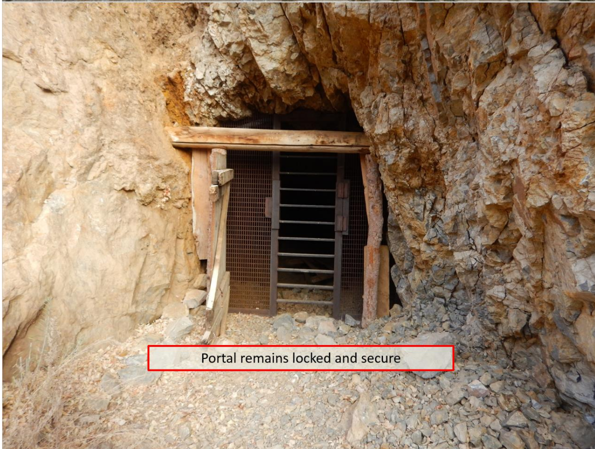
Portal remains locked and secure