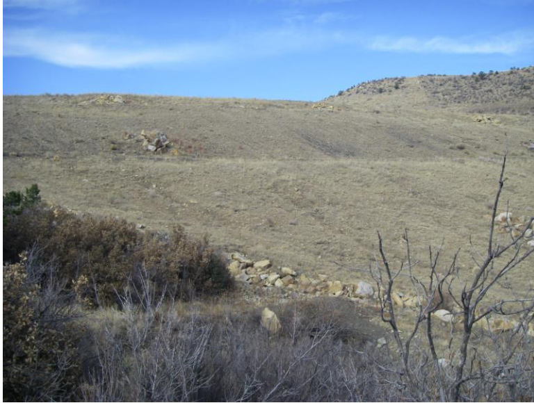
Fill 7 – upper portion where rills were located