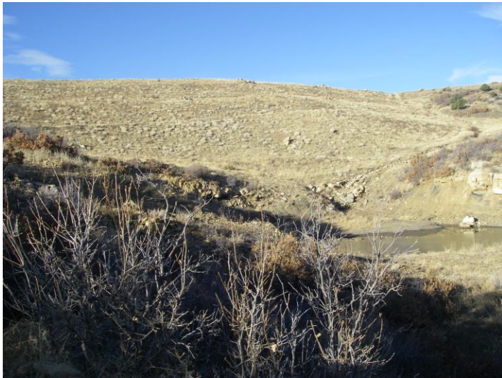
Fill 9 from below

Number of Partial Inspection this Fiscal Year: 6