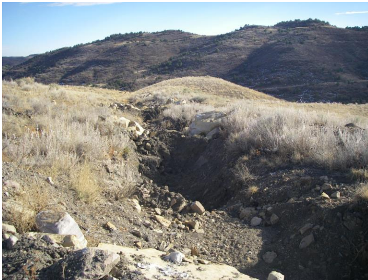
Ditch D9 – recently cleaned check dams

Number of Partial Inspection this Fiscal Year: 6 Number of Complete Inspections this Fiscal Year: 2