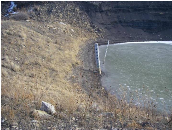
Pond 8 with new holes on spillway

Number of Partial Inspection this Fiscal Year: 6