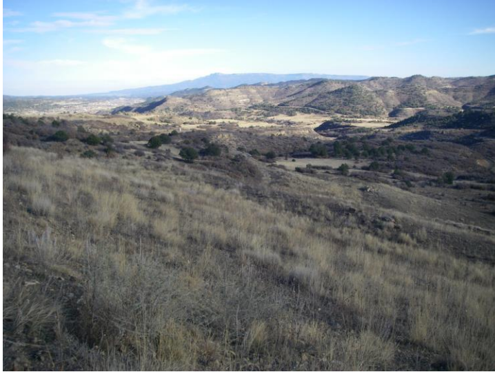
Fill 9 – northeast portion