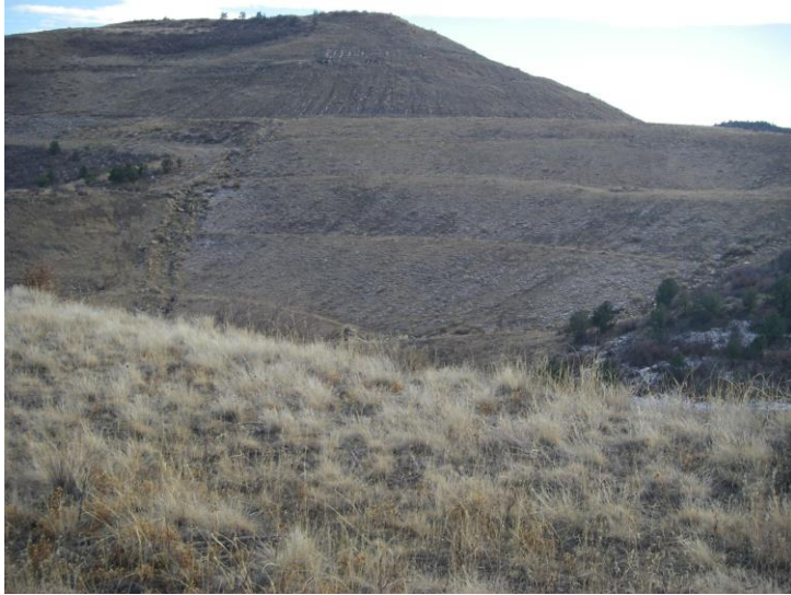
Fill 8 and northwestern portion of “the knob”