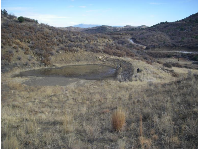
Pond 7 – NECC staff looking at spillway