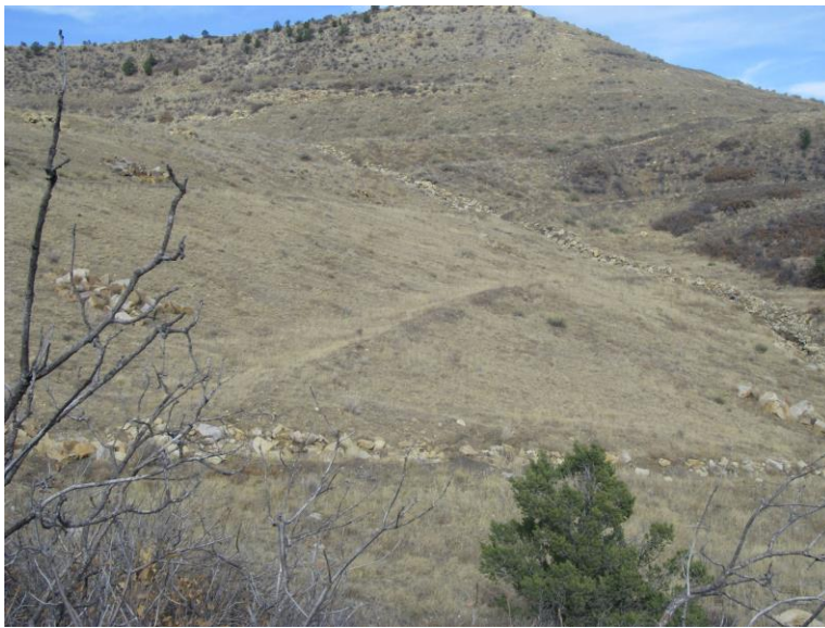
Fill 7 – lower portion

Number of Partial Inspection this Fiscal Year: 6