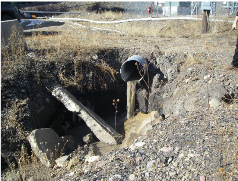
Flow into ditch that flows to Pond 007A

Number of Partial Inspection this Fiscal Year: 6