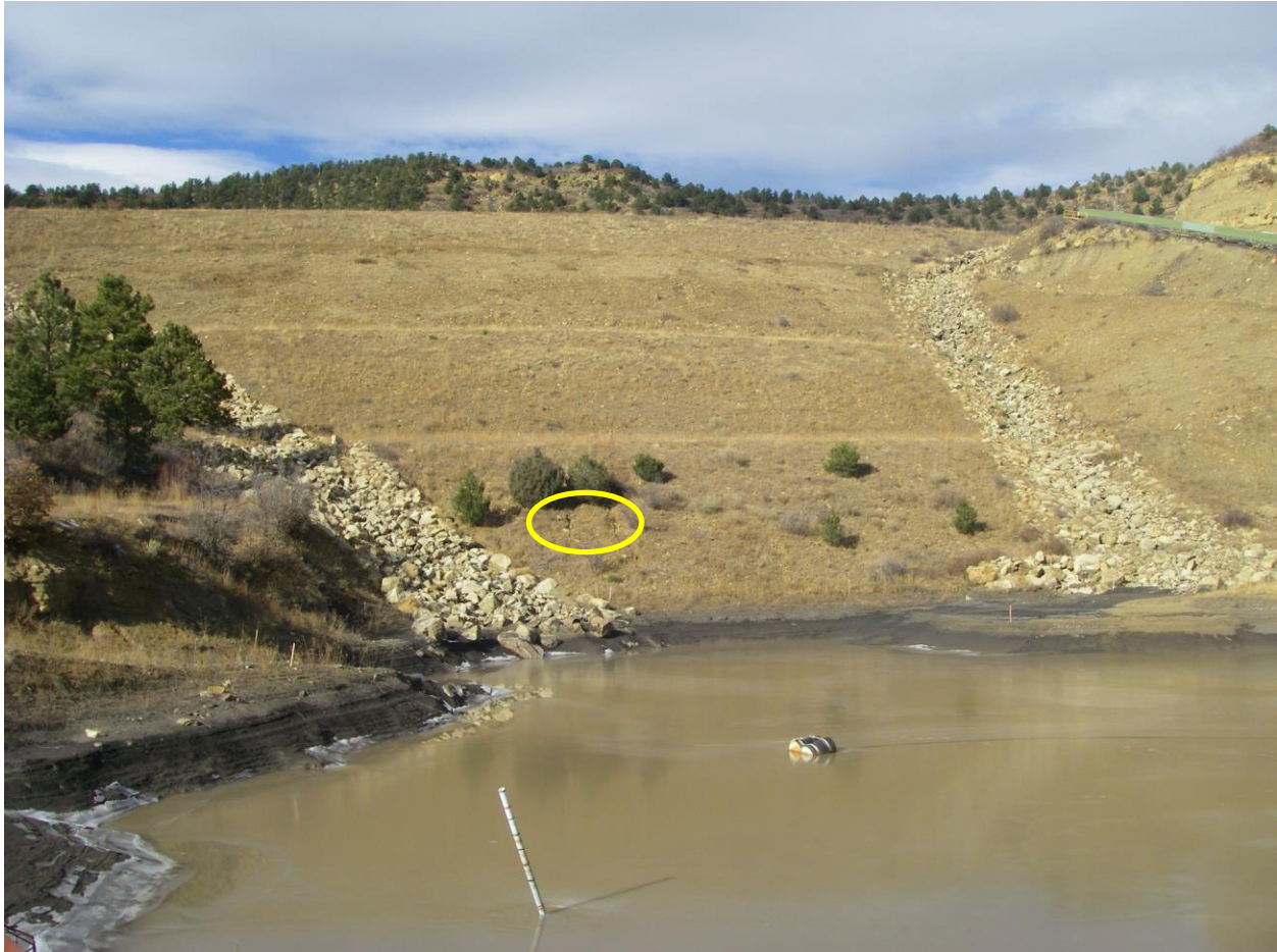
RDA and portion of Pond 08 Rills are circled

Number of Partial Inspection this Fiscal Year: 6 Number of Complete Inspections this Fiscal Year: 2