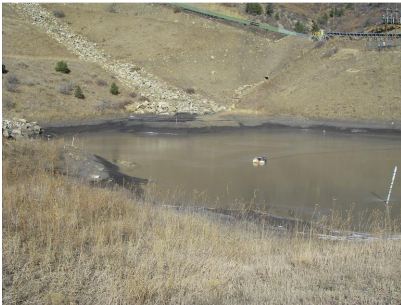
Pond 08 (note large amount of sediment)

Number of Partial Inspection this Fiscal Year: 6