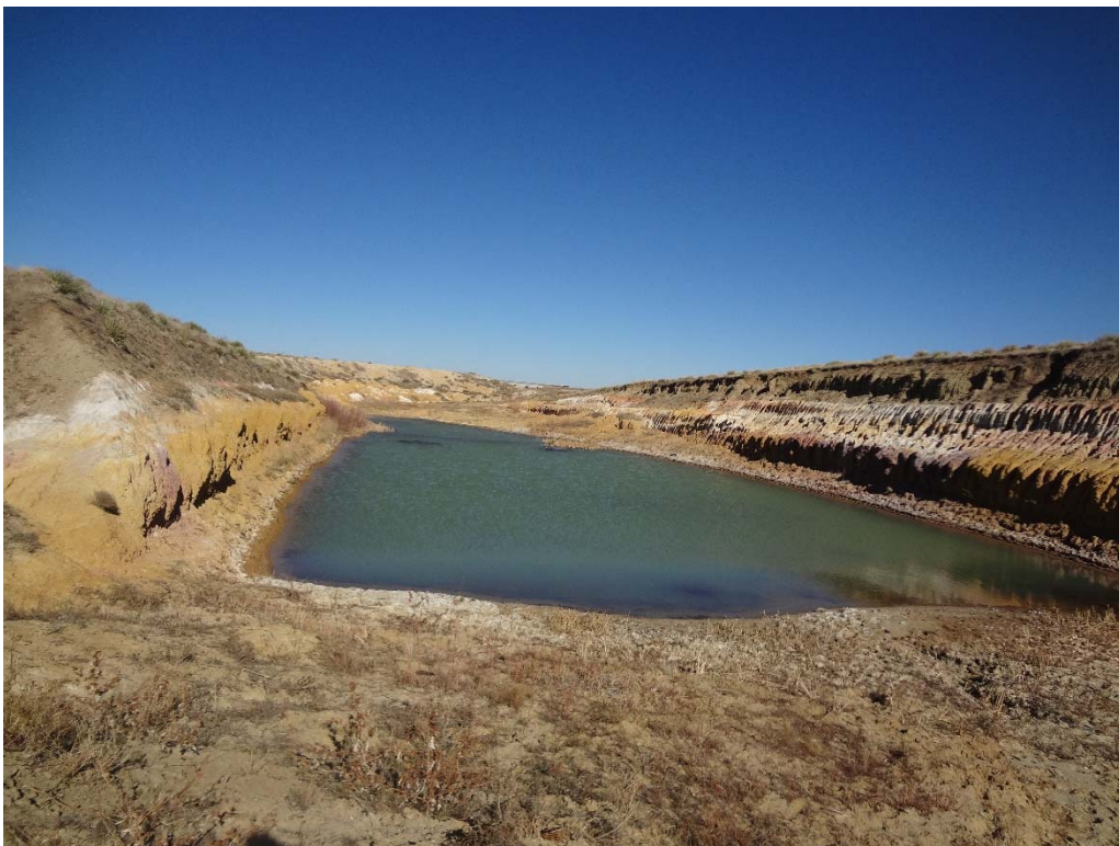
View of the mine pit from the south side looking north