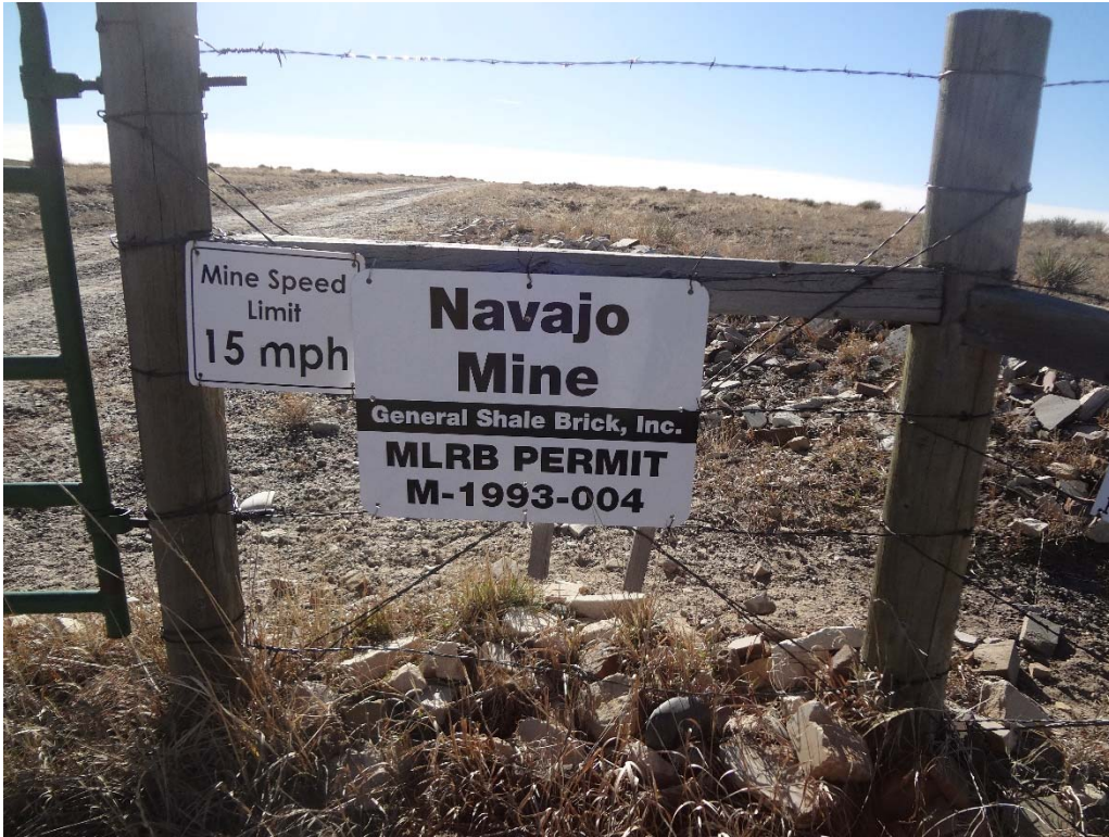
Navajo Mine sign