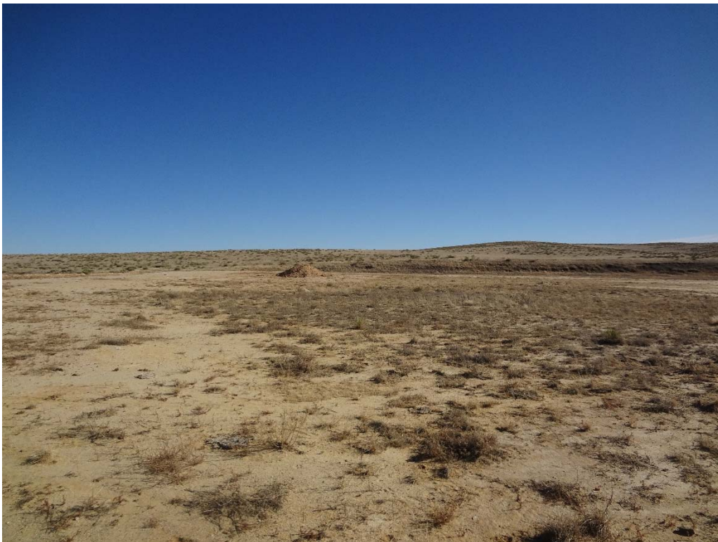
Stockpile area containing a small material stockpile looking east from the west side of the area