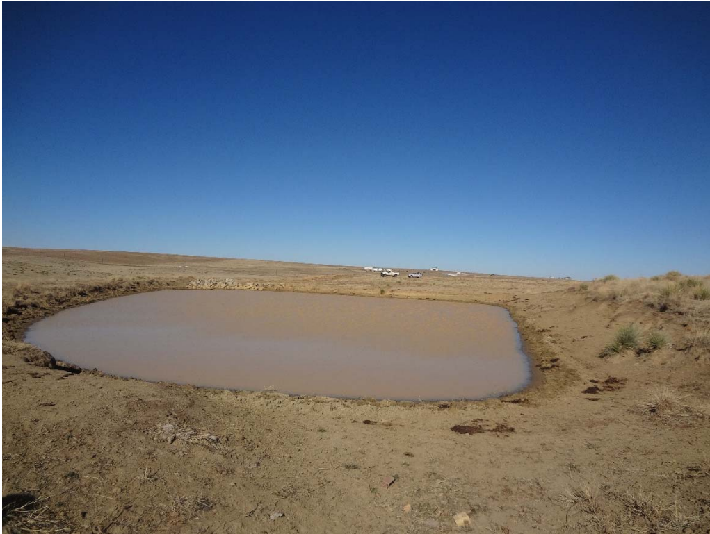
View of the stormwater detention pond from the south side looking north