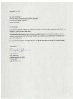
Objection Letter.JPG 3160K