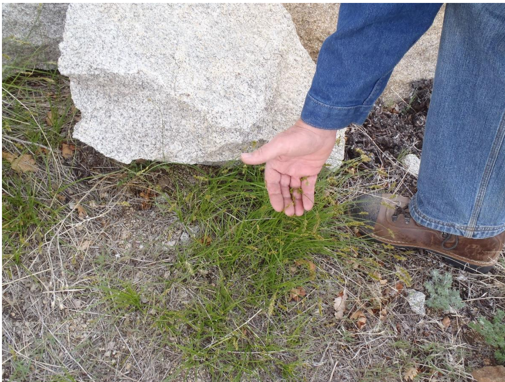
Photo 7. Grasses observed on East side.