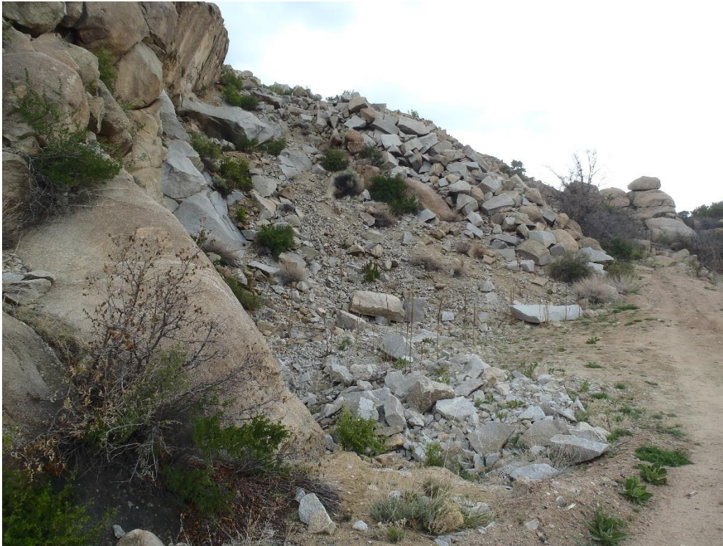
Photo 2. Example of fines supporting vegetation (East side, looking north).