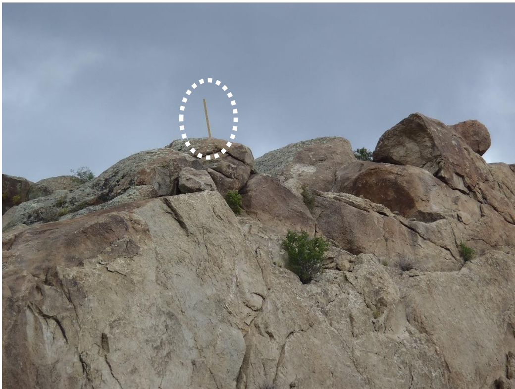
Photo 9. Typical survey lathe marking proposed boundary (West side, top of highwall).