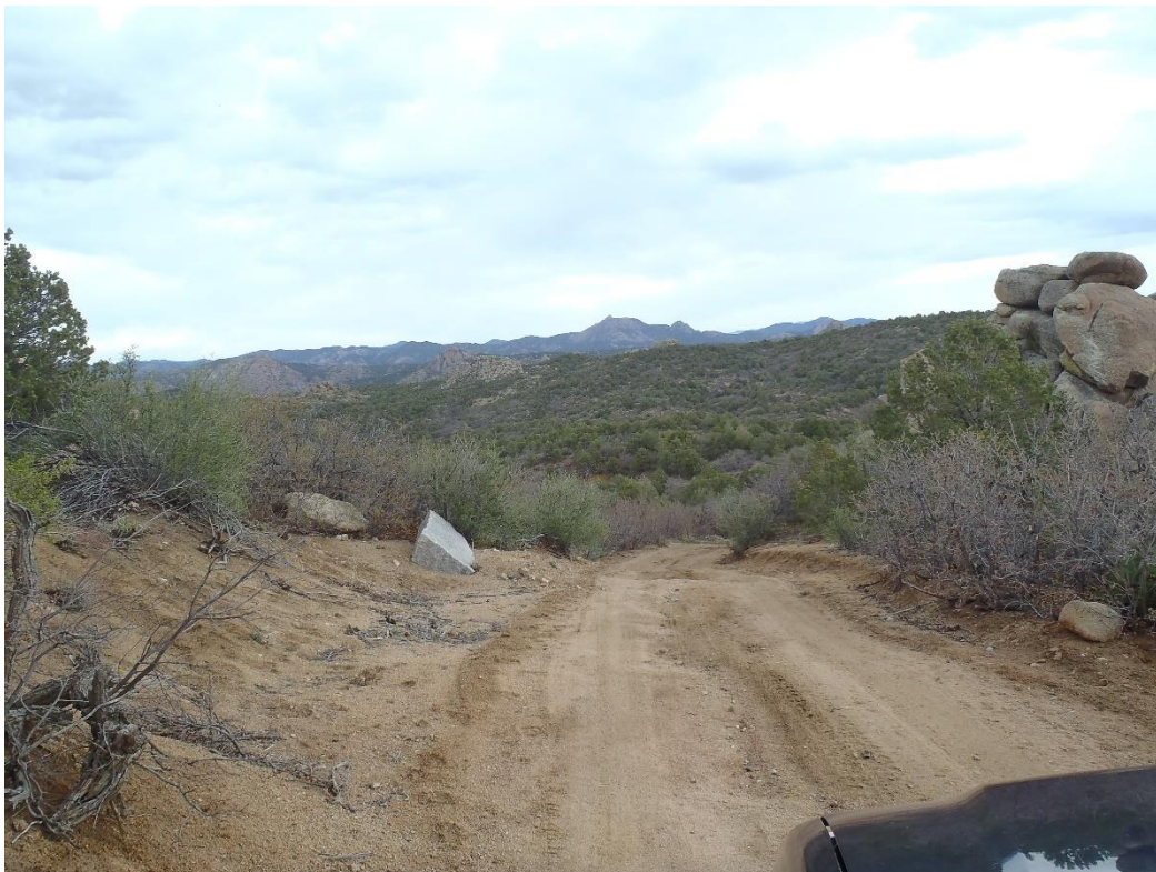
Photo 5. West side access road from CR 37 (looking SE towards CR 37).