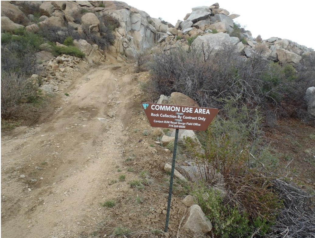
Photo 6. East side access road from CR 37 (looking north, note Common Use Area sign)