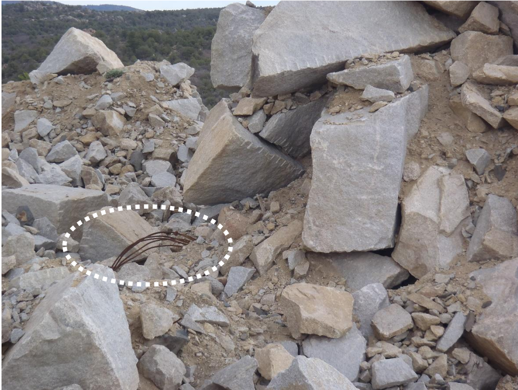
Photo 8. Typical heavy rusted cables from the pre-law mining operations (West side).