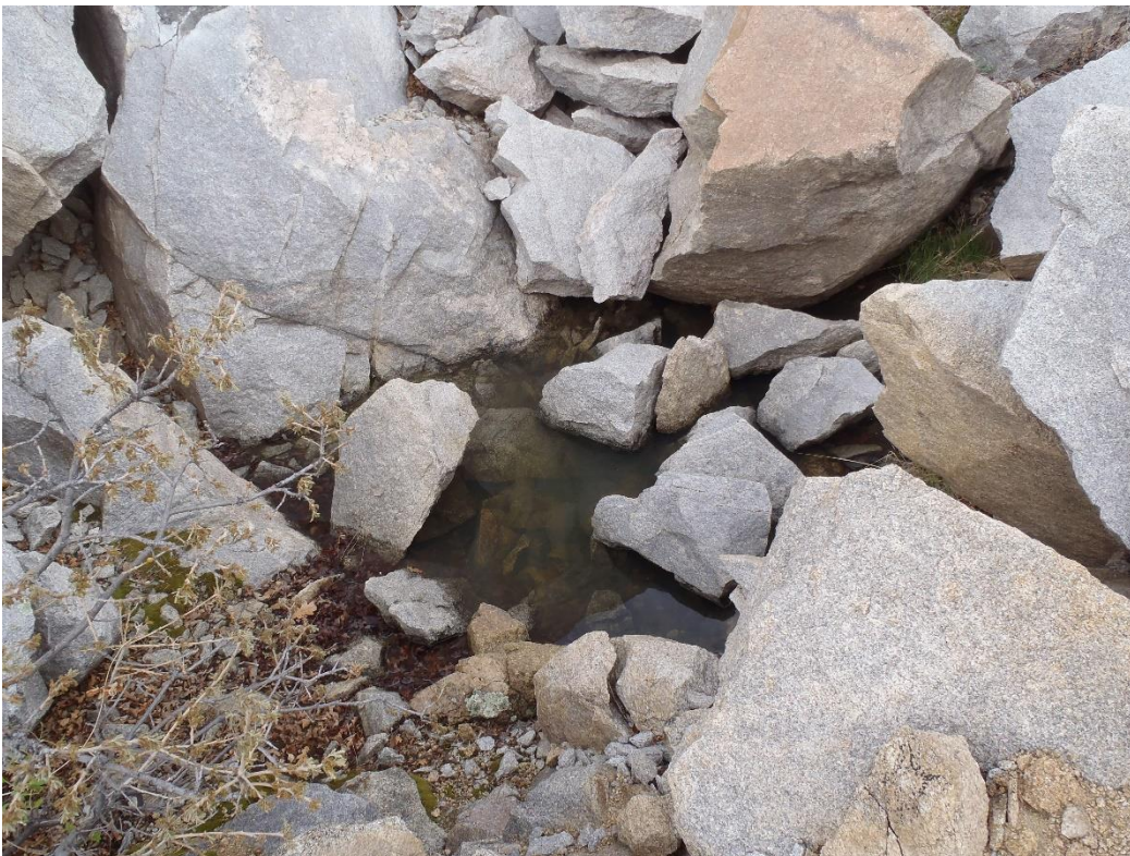
Photo 3. Standing water observed in the east working area (south side).