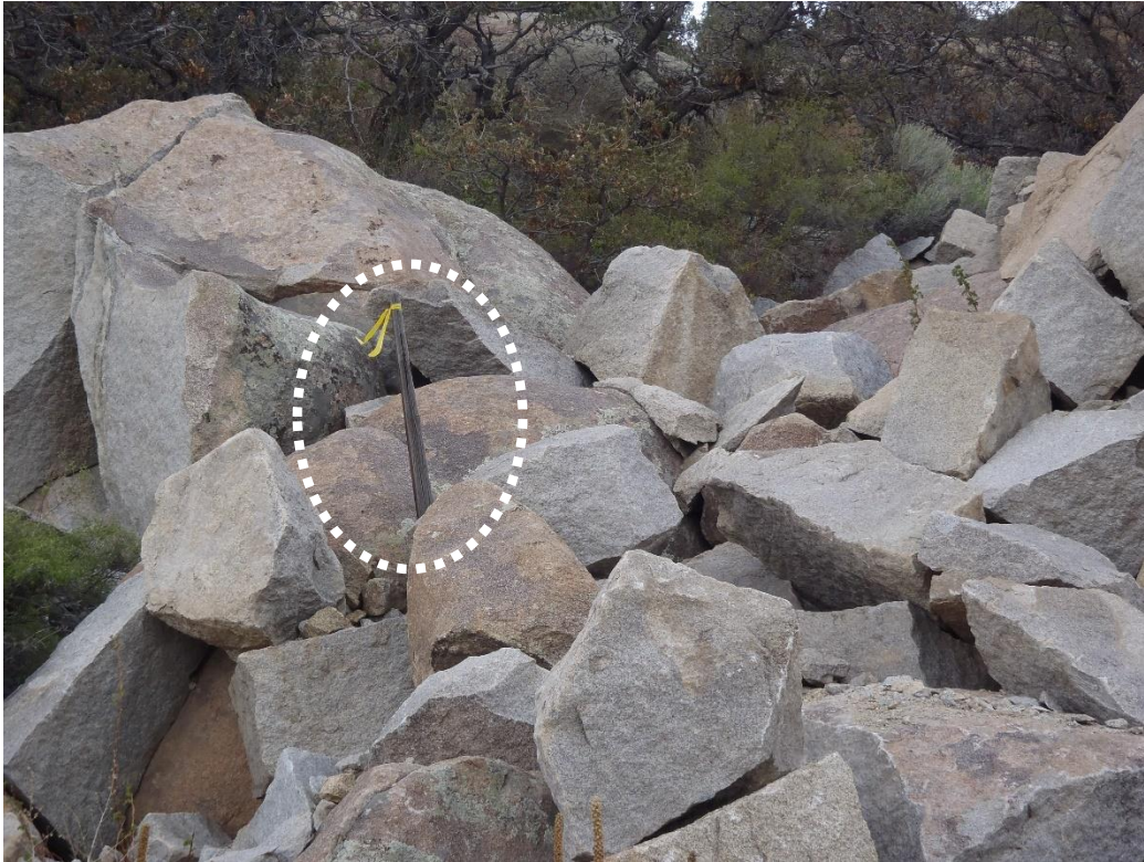
Photo 10. Typical survey lathe marking proposed boundary (East side).