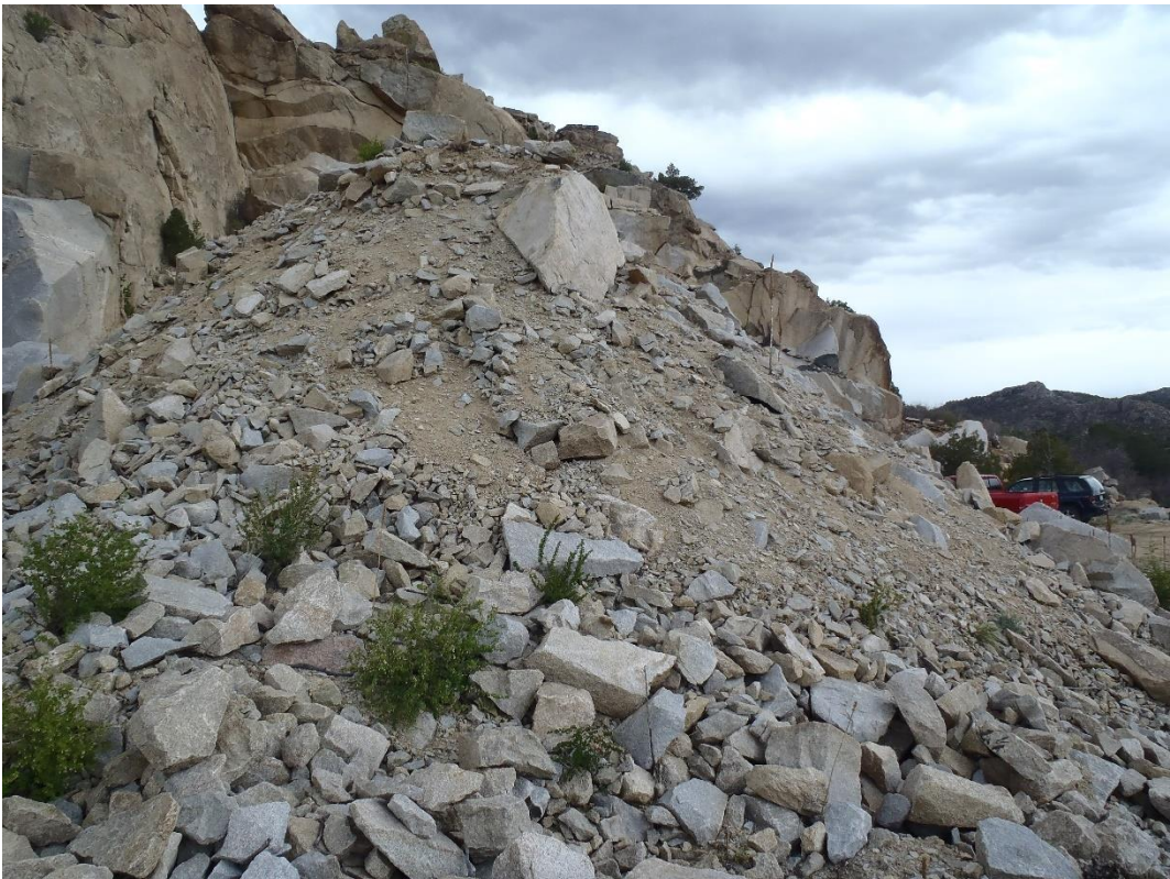
Photo 1. Example of fines supporting vegetation (West side, looking SE).