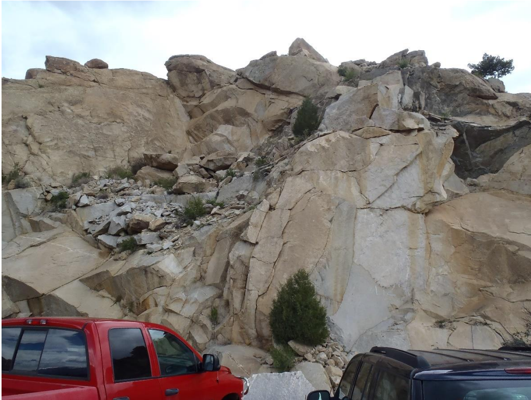
Photo 4. High walls estimated between 10 and 50 feet in height (West side, looking NE).