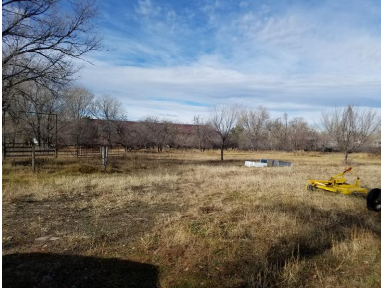
Figure 5. Grove of trees in the southwest corner of the site.