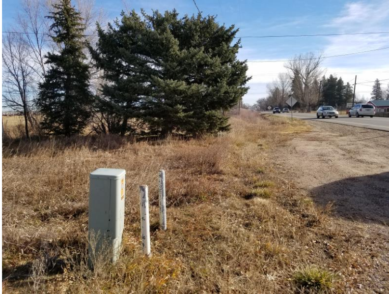
Figure 3. From the southwest entrance looking east.