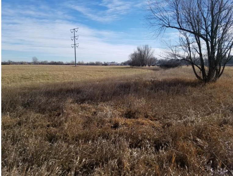
Figure 7. Lateral ditch from the Cache La Poudre Ditch bending east in the permit area.