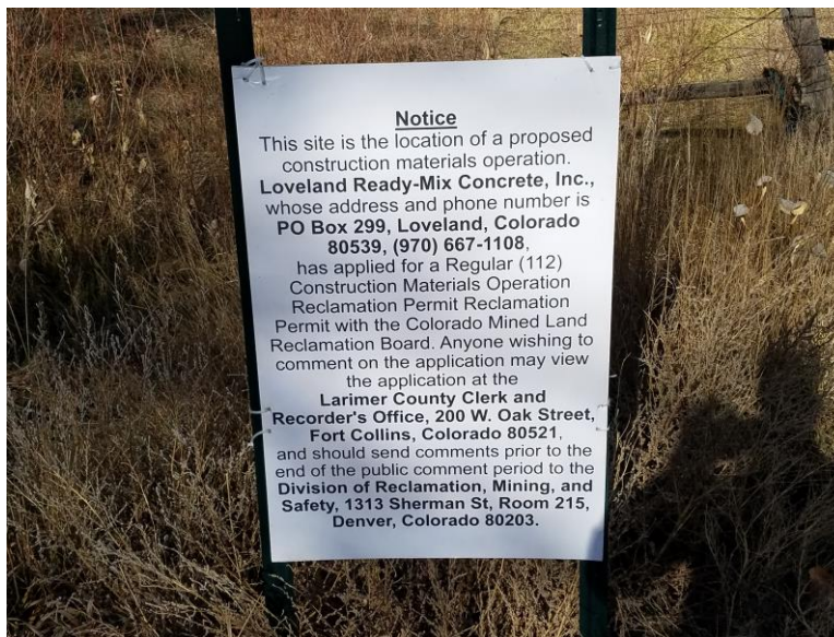
Figure 2. Notice sign located at the southeast entrance to the site.