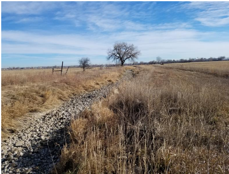
Figure 10. Little Cache La Poudre Ditch.