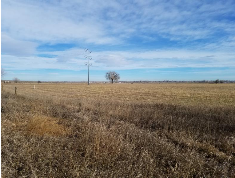
Figure 8. Pasture located in the southwest corner of the site.