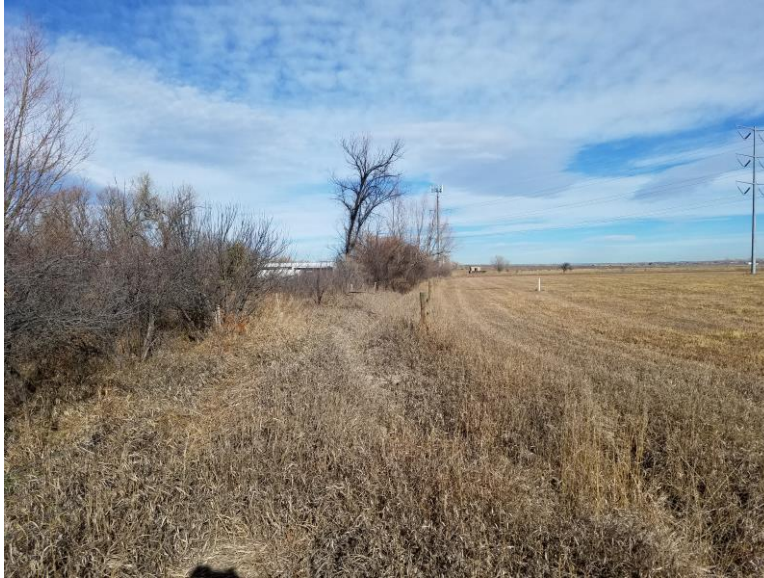
Figure 9. Lateral ditch from the Cache La Poudre Ditch next to the Taylor and Gill Ditch on the west side of the site in the SW quarter of the site.