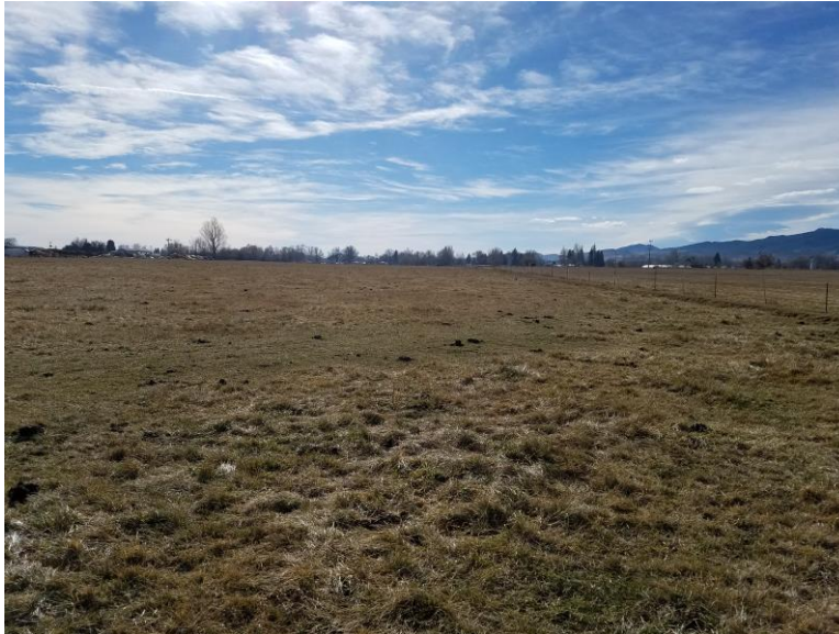
Figure 12. Pasture located in the northeast quarter of the site.