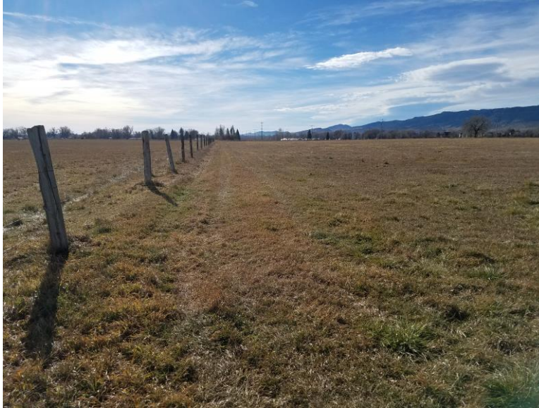
Figure 11. Pasture located in the northwest quarter of the site.