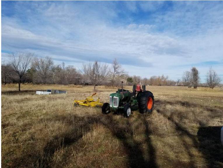
Figure 6. Agricultural equipment located in the southwest corner of the site.