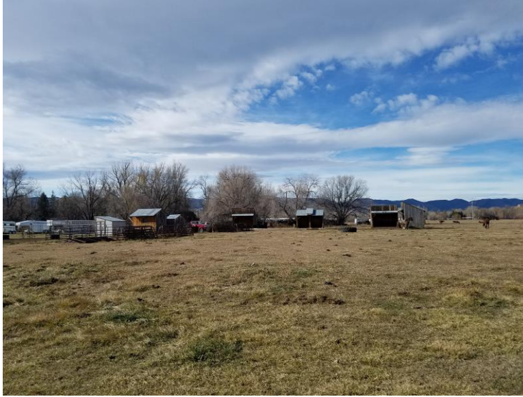
Figure 13. LRM property located within the southeast quarter of the site.

Stephanie Fancher-English Loveland Ready-Mix Concrete, Inc. 644 N. Namaqua Road Loveland, CO 80539