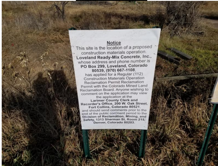
Figure 1. Notice Sign located at the southwest entrance to the site.