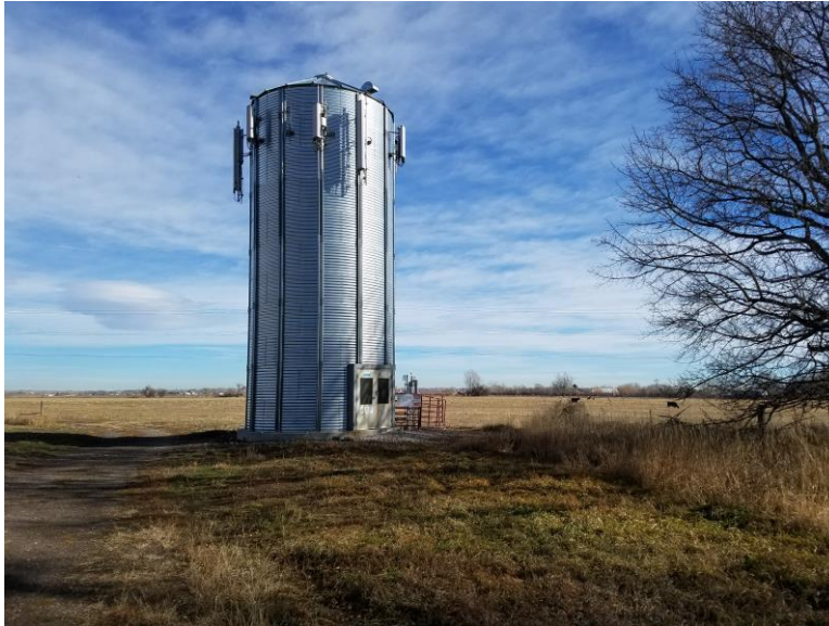
Figure 4. Silo/Cell Tower located in the southwest corner of the site.