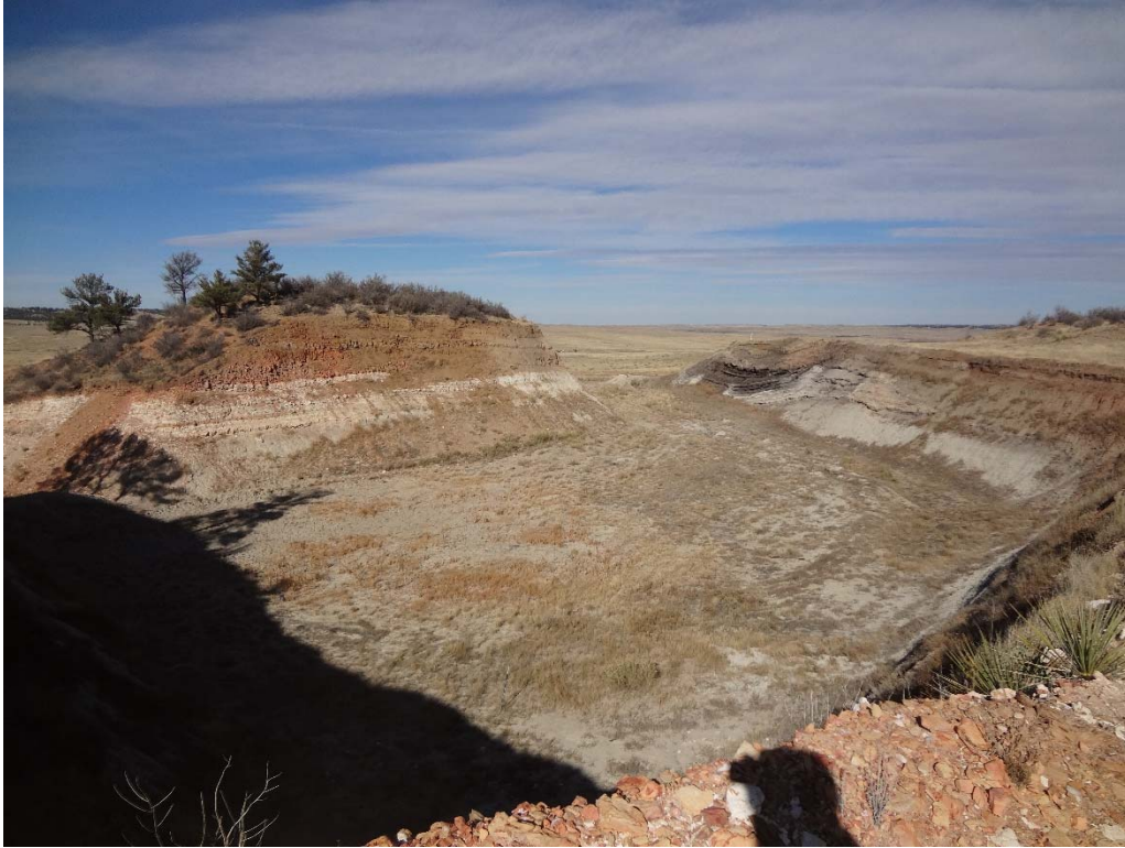
View of the eastern mining area from the southwest corner looking northeast