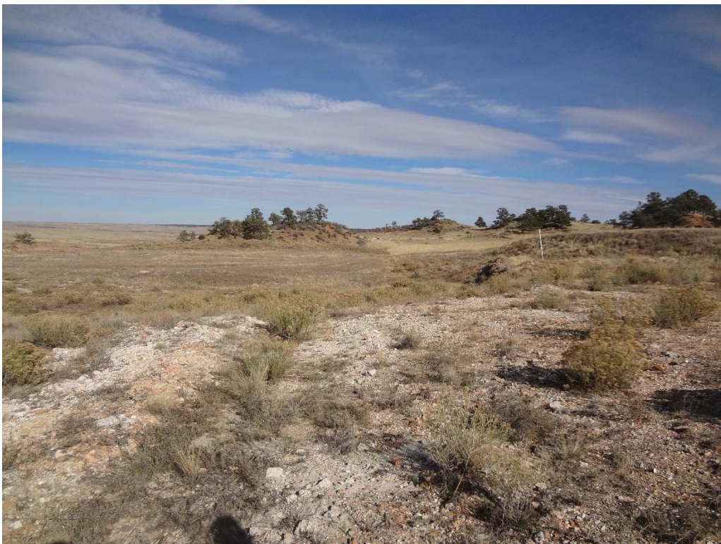
View of the site from the southwest corner of the site looking north east