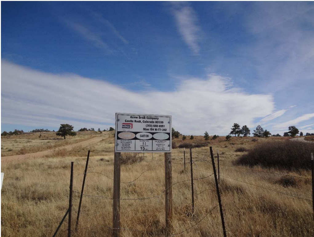
Dawson Mine sign