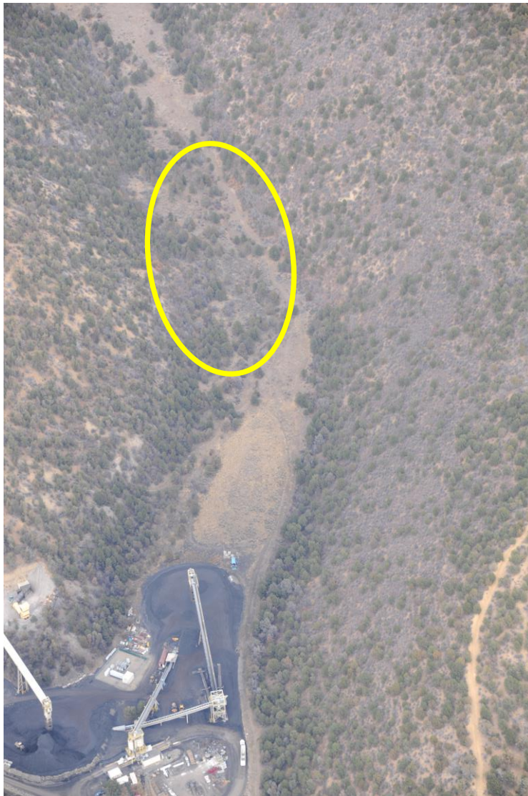
King II – facilities, topsoil pile, and vegetation reference area (reference area is within yellow oval)

Number of Partial Inspection this Fiscal Year: 4