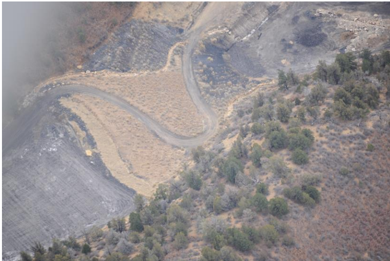
Refuse Pile at King I

Number of Partial Inspection this Fiscal Year: 4