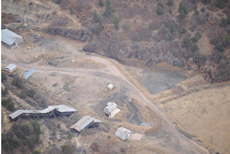
King I – lower area with improvements of ponds