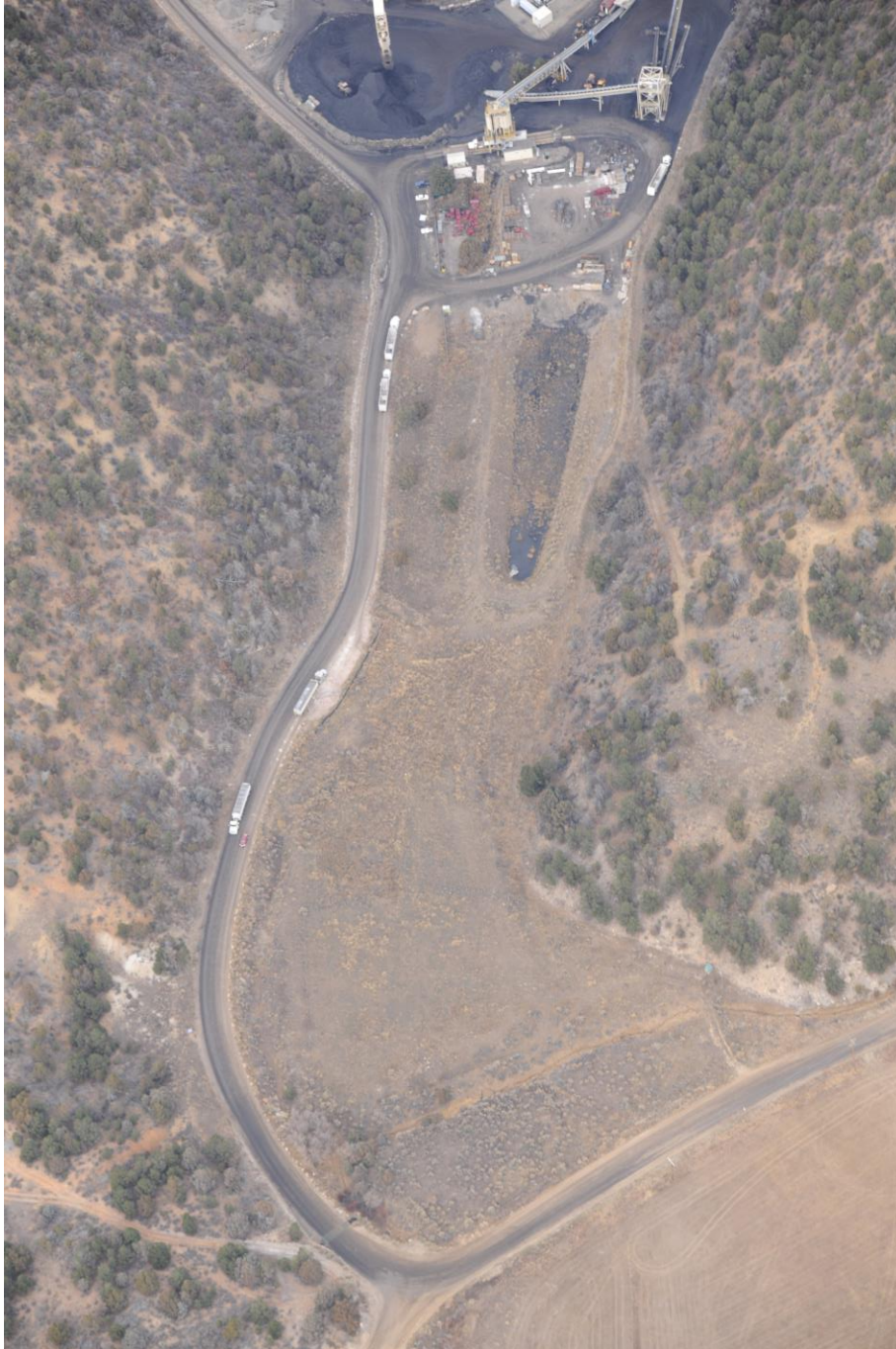
King II – lower portion

Number of Partial Inspection this Fiscal Year: 4