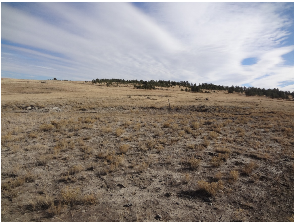
View of the site from the northwest corner looking southeast