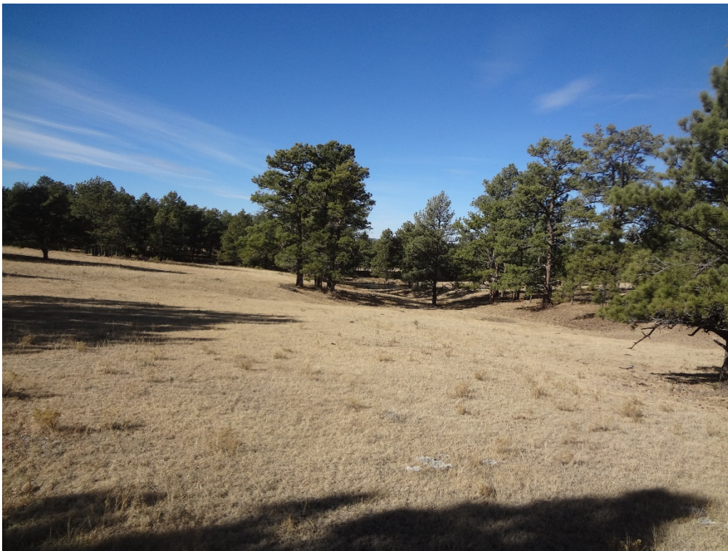
View of the site from the southeast corner looking northwest