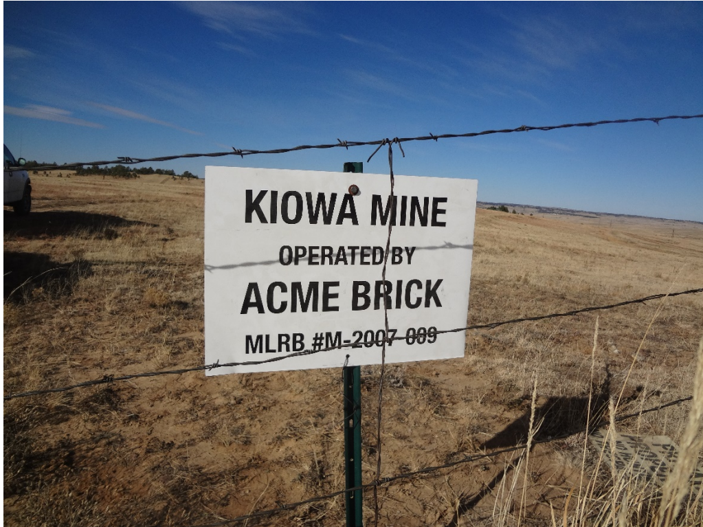
Kiowa Mine sign