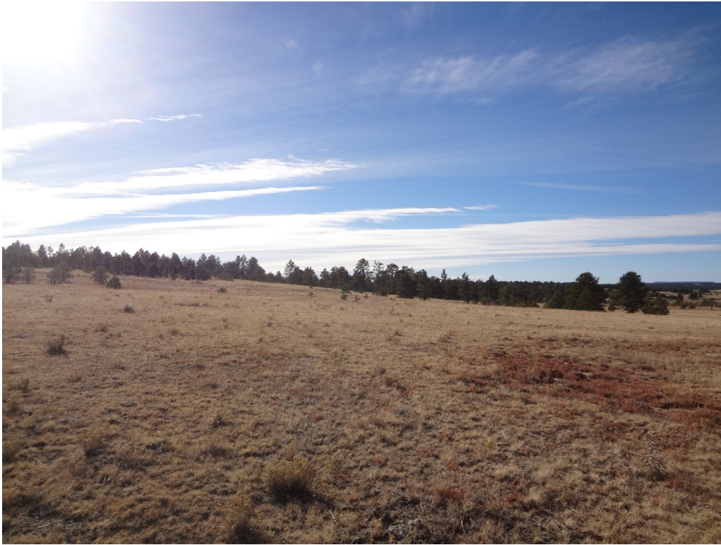
View of the site from the northeast corner looking south