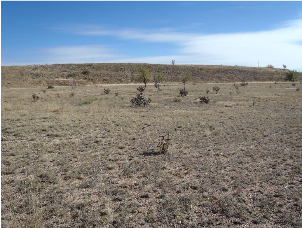
Photo 6. Release area adequately revegetated (3 of 3, looking east).