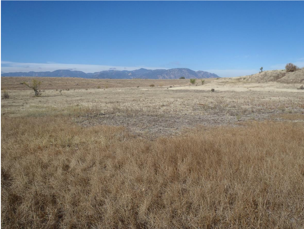
Photo 4. Release area adequately revegetated (1 of 3, looking NW).