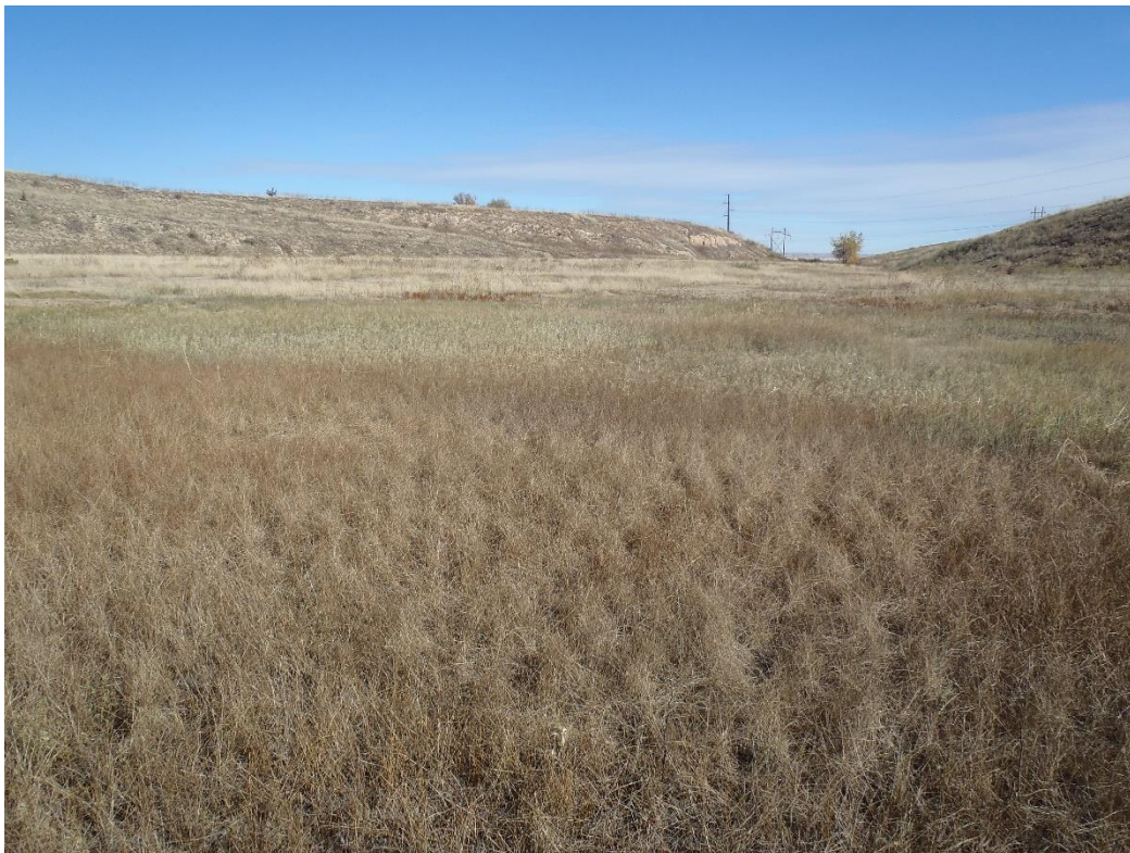
Photo 5. Release area adequately revegetated (2 of 3, looking NE).