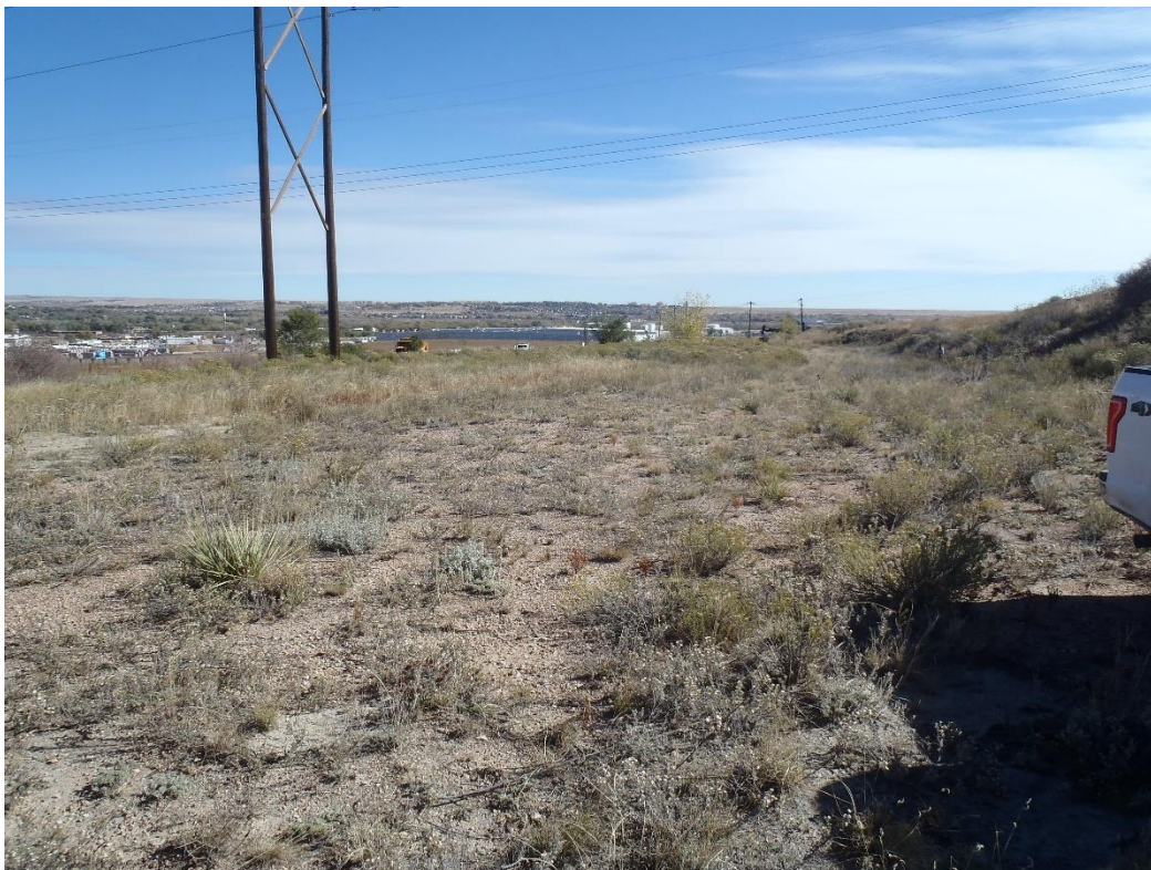
Photo 3. Reclaimed original access road (looking east near original entrance).