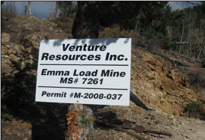
1. Permit sign at site entrance.