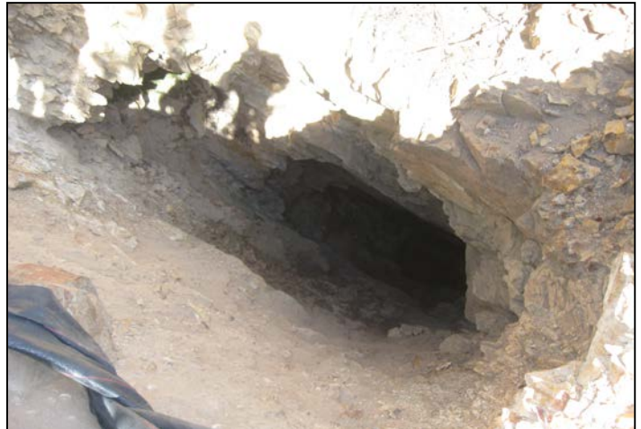
2. Unsecured mine shaft.