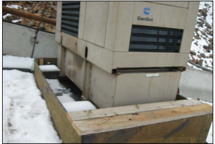
2. Lined secondary containment for generator.