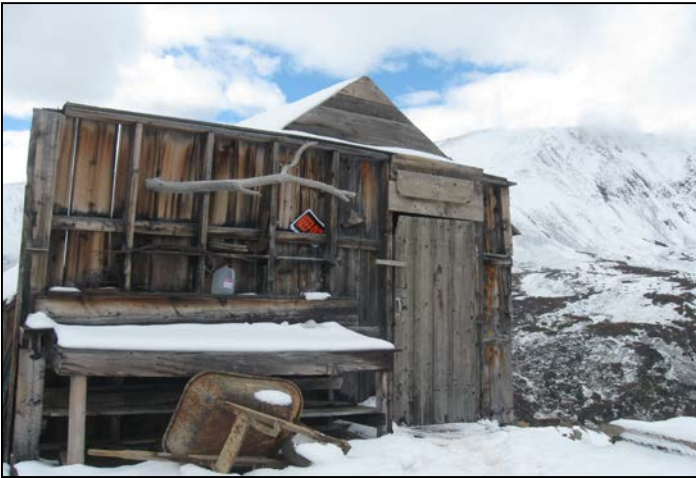
1. 1950's Wooden Shack.