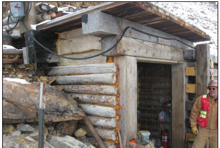
4. Front view of portal.