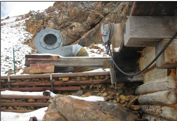
3. Side view of portal.