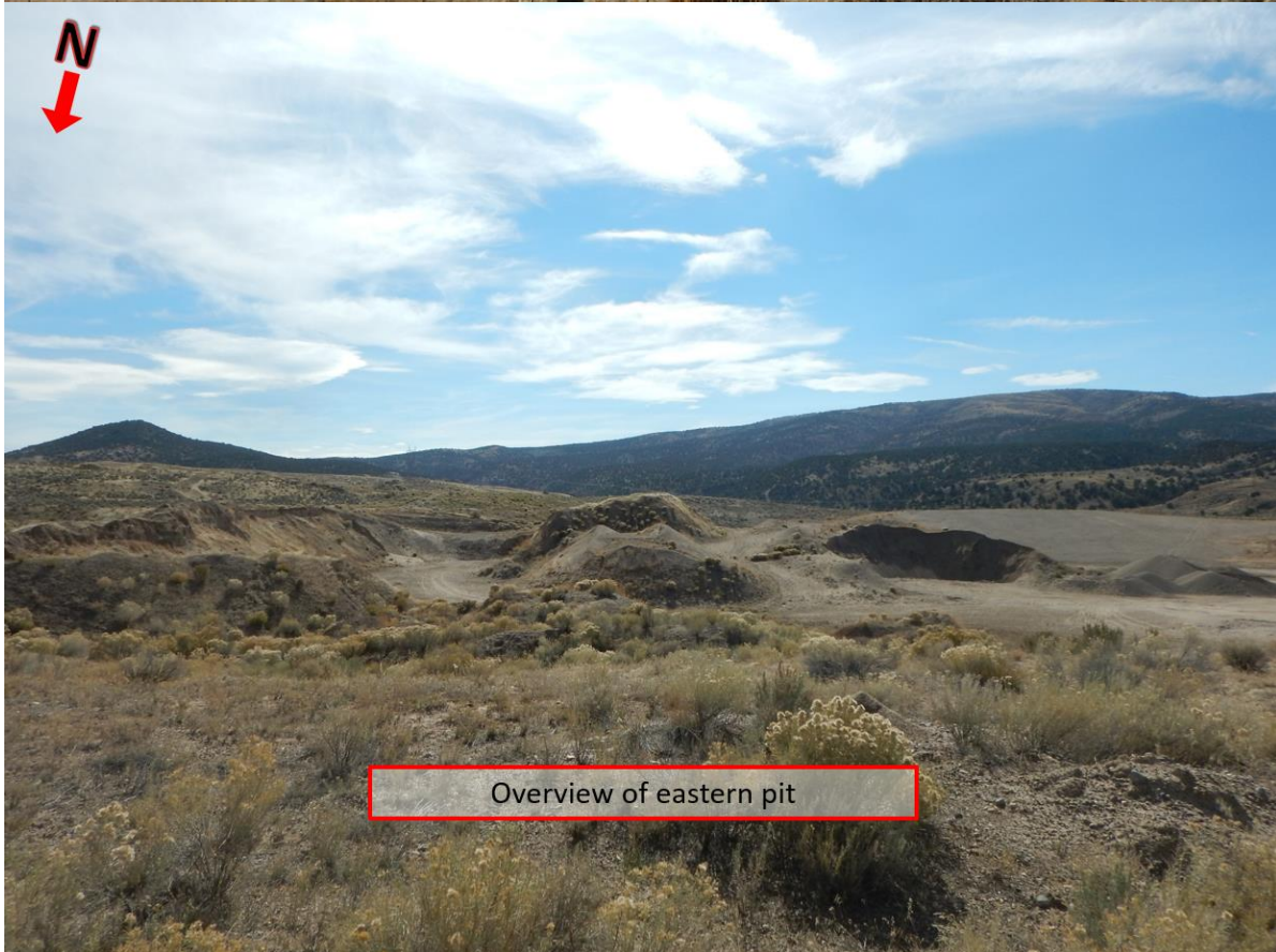
Overview of eastern pit