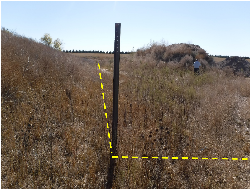
Photo 4. Northeast amendment boundary corner, stockpile on left is accosted with the landfill, stockpile on right is mining disturbance; looking south.